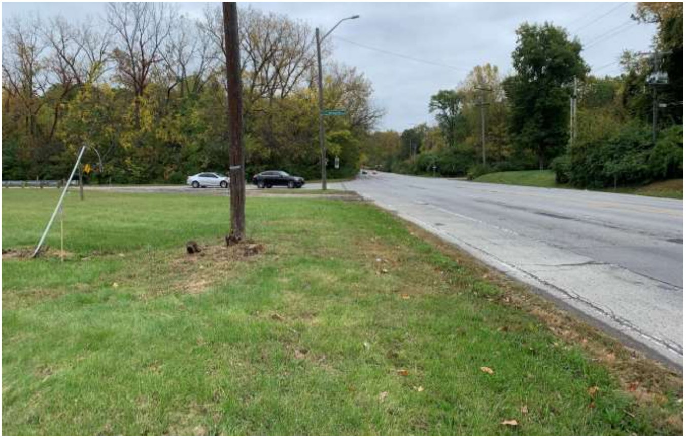
Photo of the street frontage looking east along 46th Street.