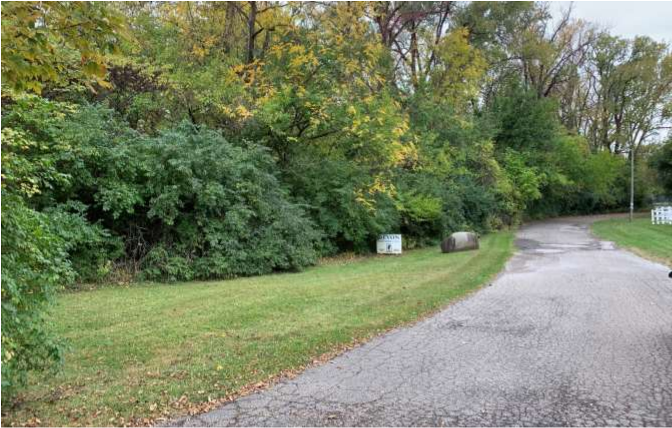
Photo of the driveway north of the site that leads toward the sports club.