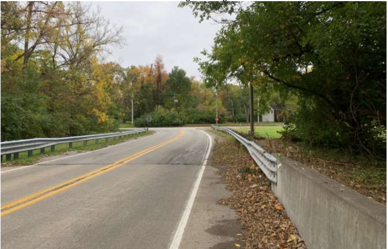
Photo of the eastern street frontage looking south on Millersville Road.