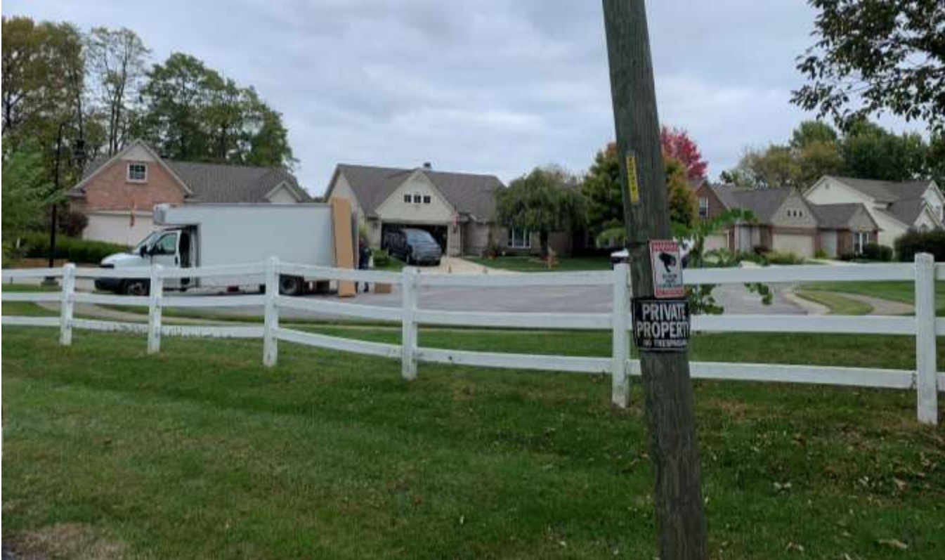
Photo of single-family dwellings north of the sports club driveway.