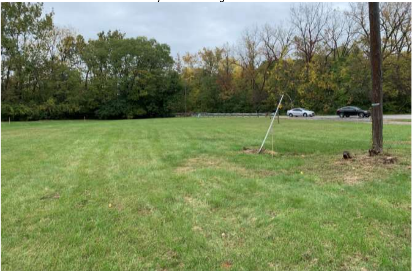
Photo of the subject site looking northeast from 46 th Street.