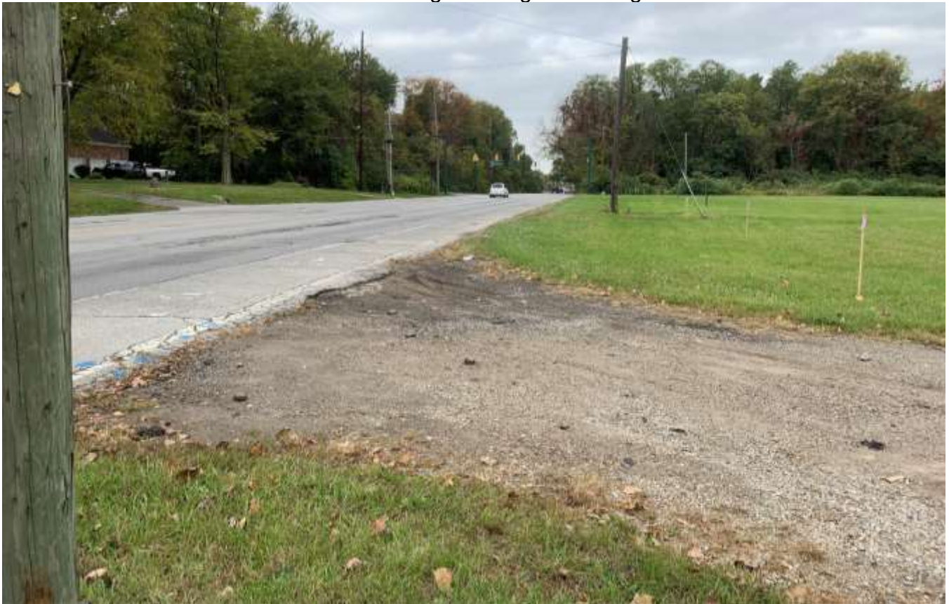
Photo of the entire southern street frontage.