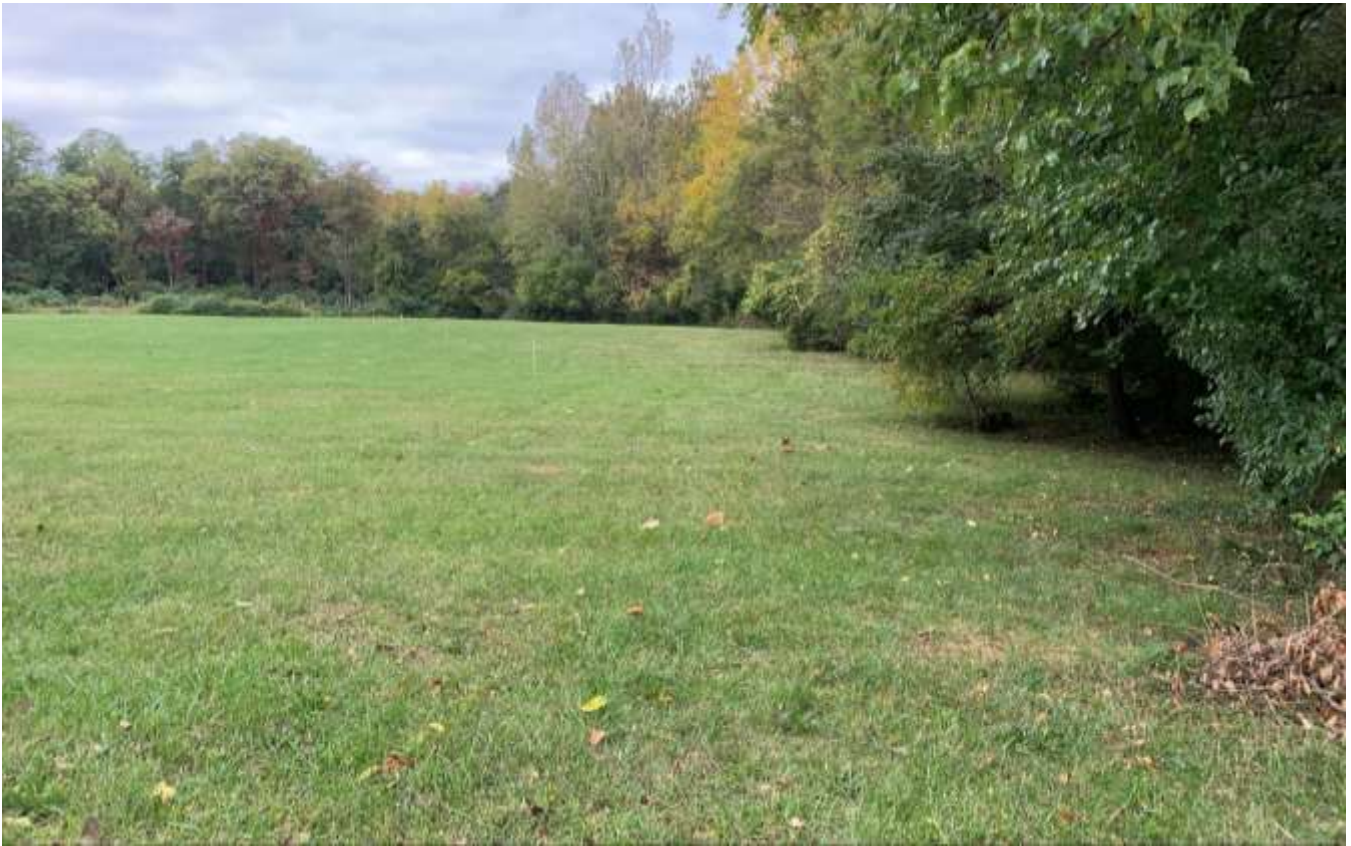
Photo looking west towards where the access easement would be proposed.