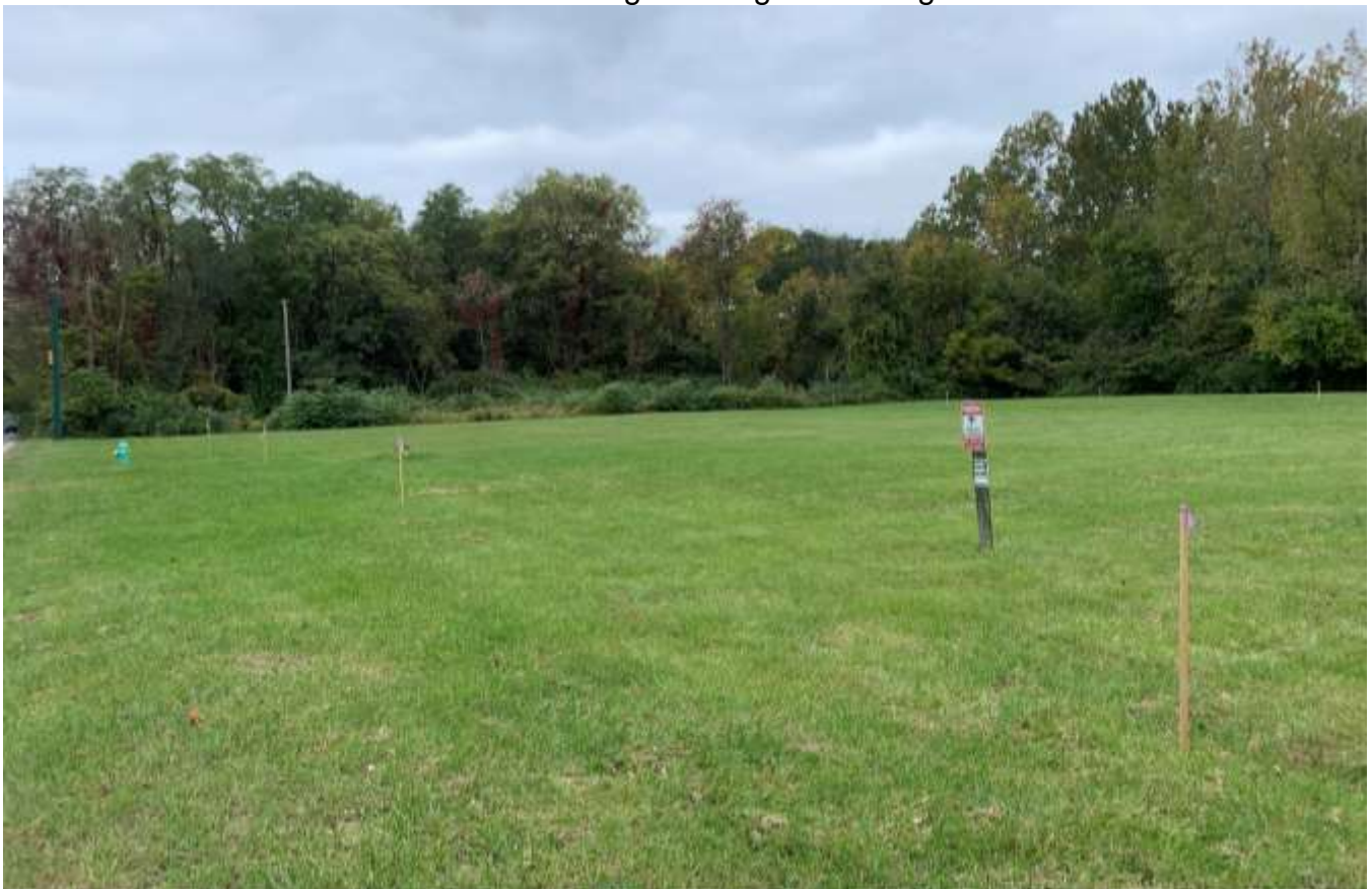
Photo of the subject site looking northwest from 46 th Street.