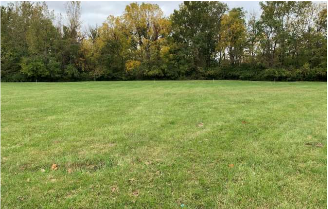
Photo of the subject site looking north from 46th Street.