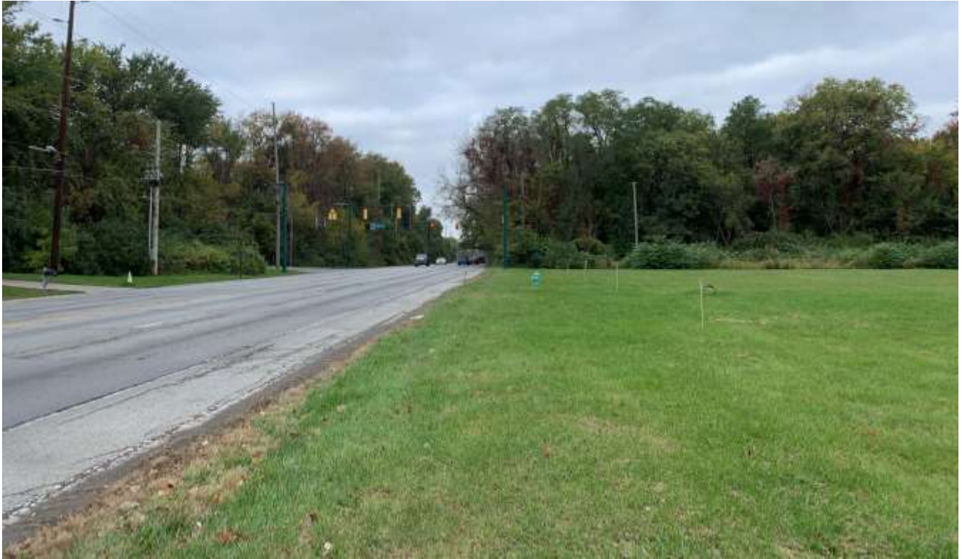
Photo of the street frontage looking west along 46 th Street.