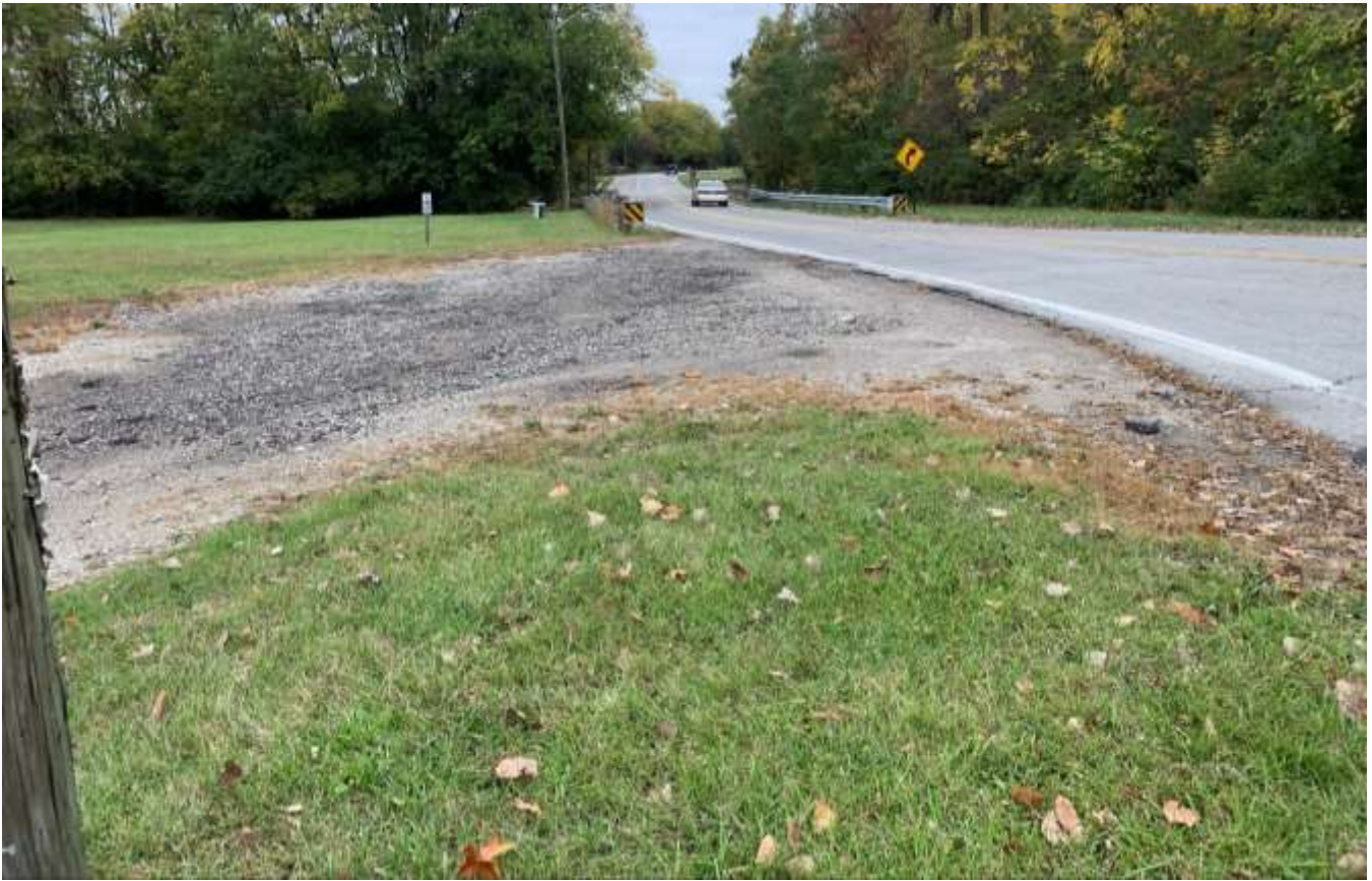
Photo of the eastern street frontage looking north on Millersville Road.