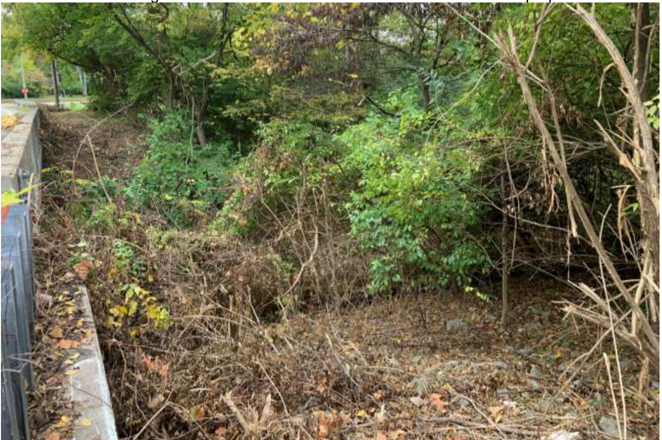
Photo looking south at Devon Creek located along the northern property boundary.