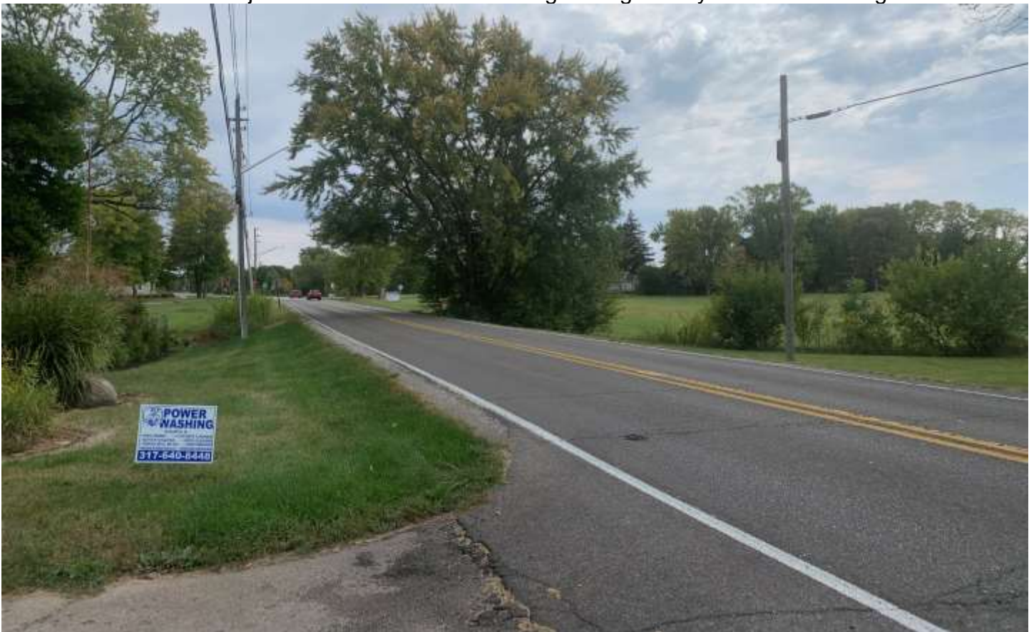
Photo of the subject site northern street frontage along Shelbyville Road looking east.