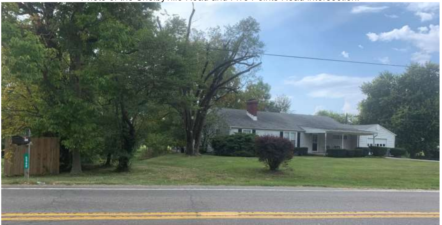
Photo of the single-family dwelling west of the site.