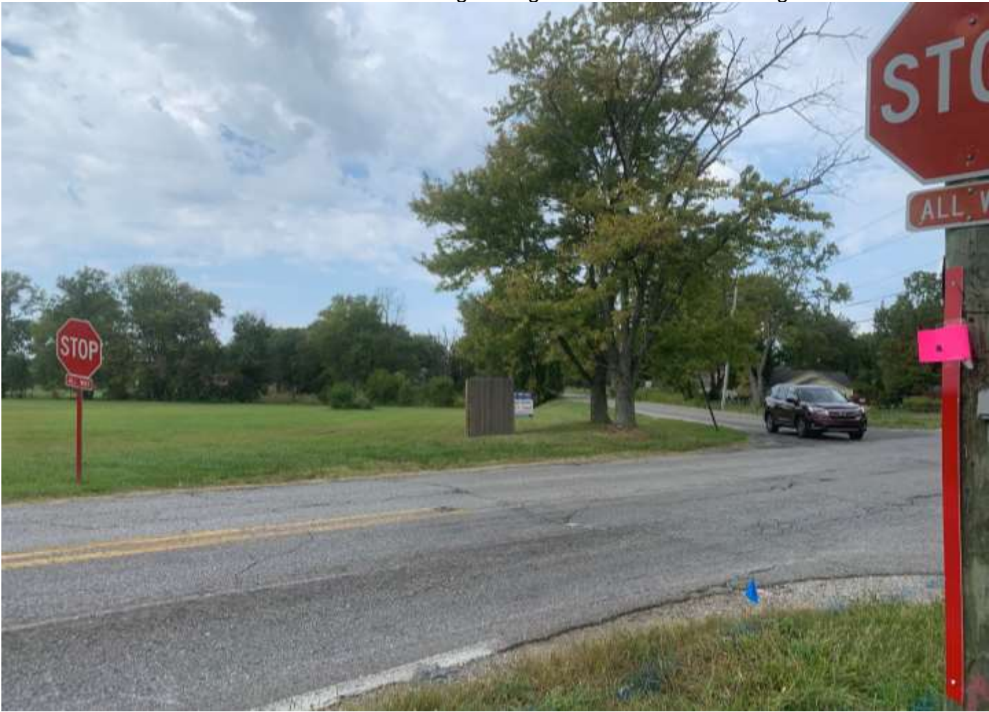
Photo of the subject site at the intersection.