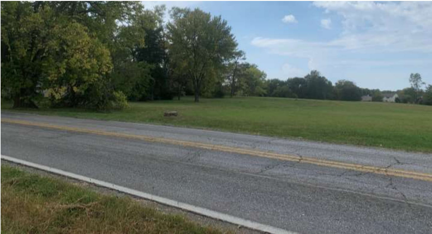
Photo of the eastern street frontage along Five Points Road looking south.