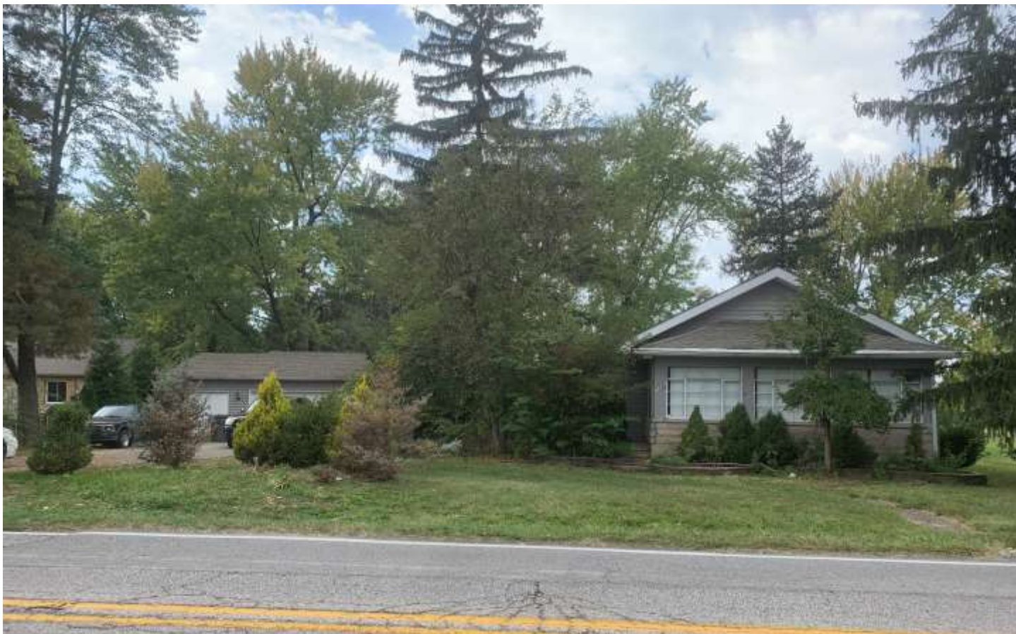
Photo of the existing single-family dwelling and detached garage on site.