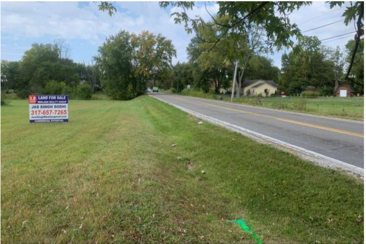
Photo of the subject site northern street frontage along Shelbyville Road looking west.