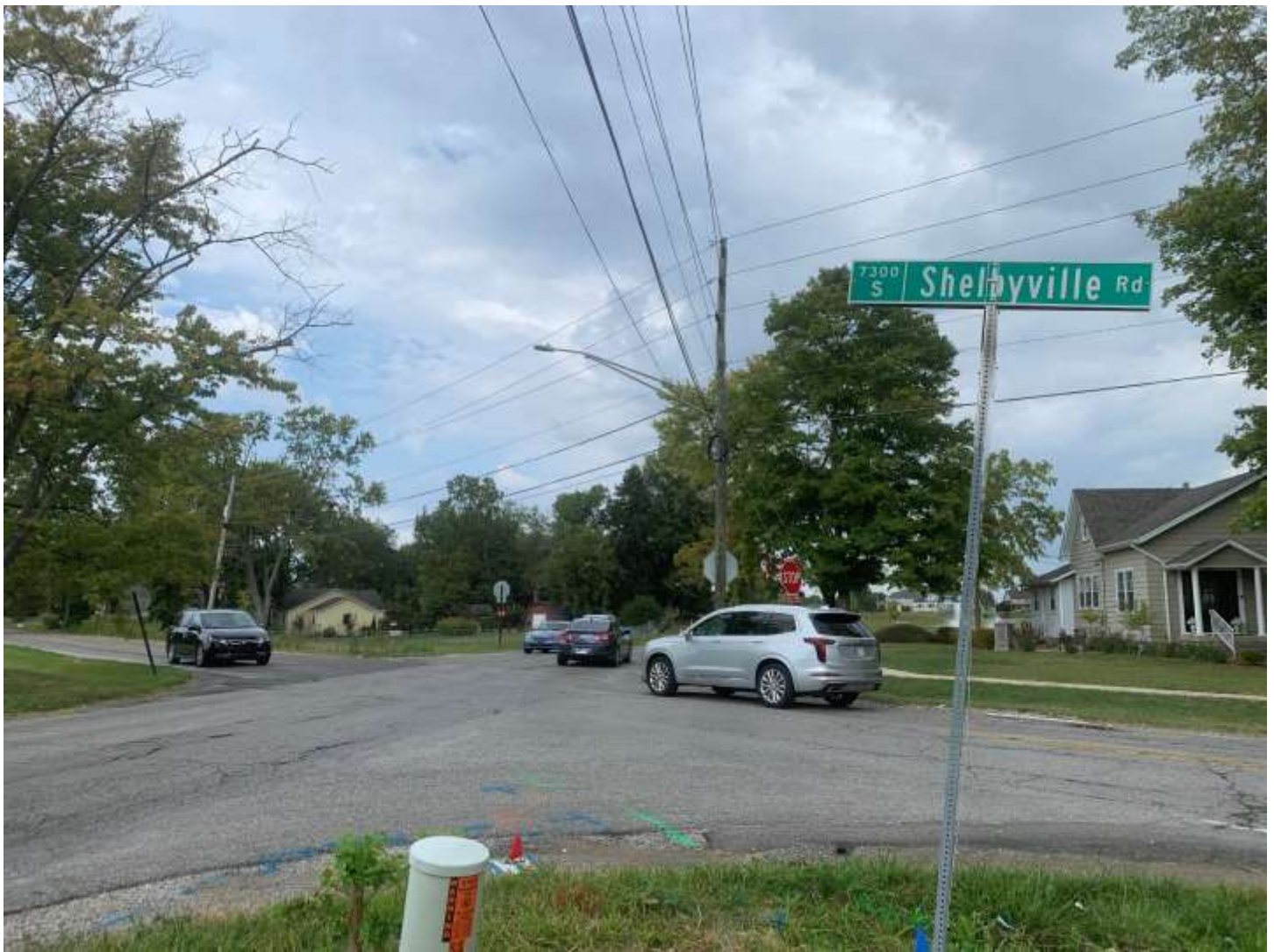
Photo of the Shelbyville Road and Five Points Road intersection.