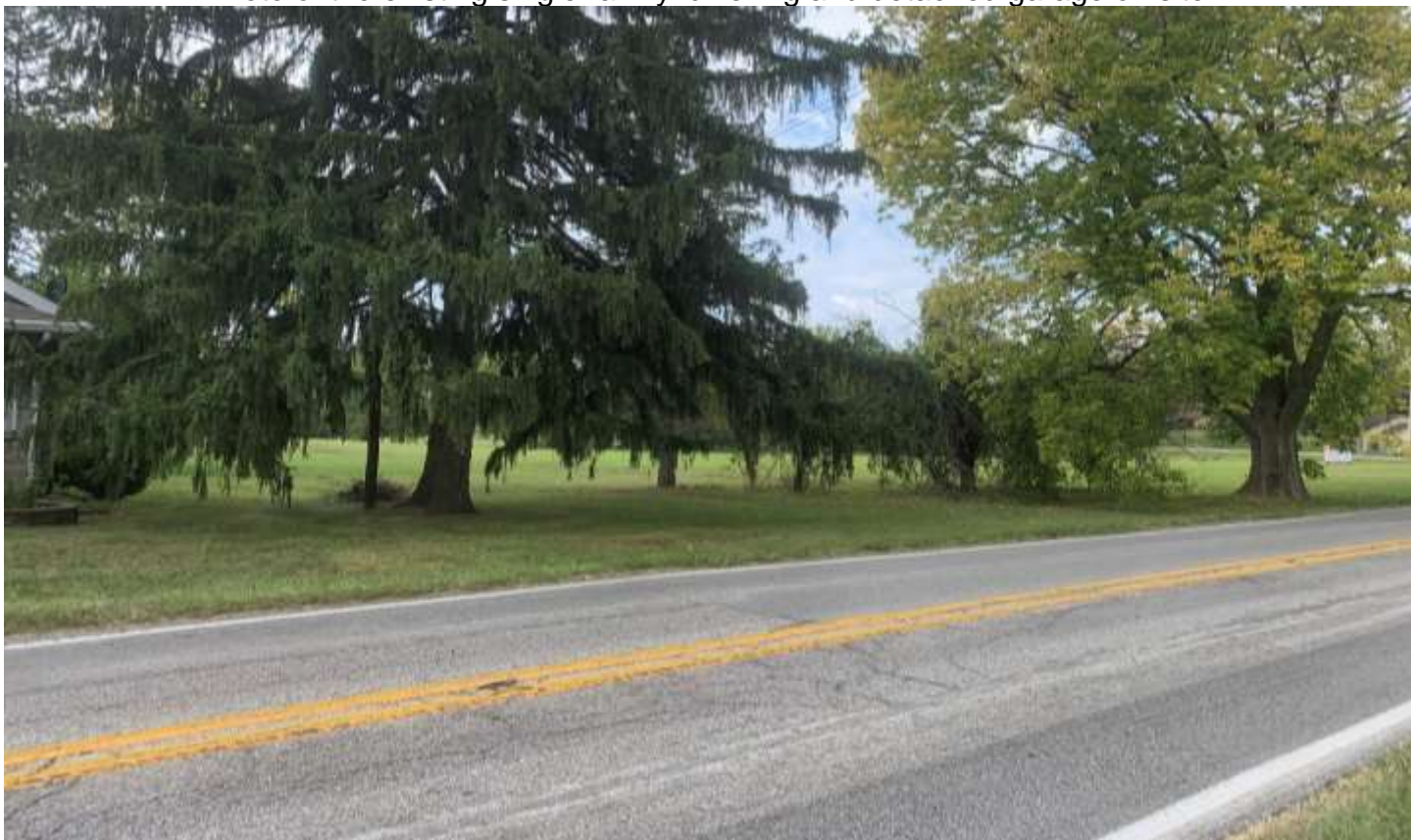
Photo of the eastern street frontage along Five Points Road looking north.