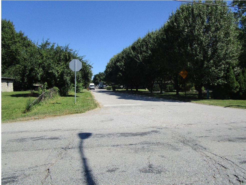
View looking east into adjacent neighborhood across the intersection of South Arlington Avenue and East Southern Avenue