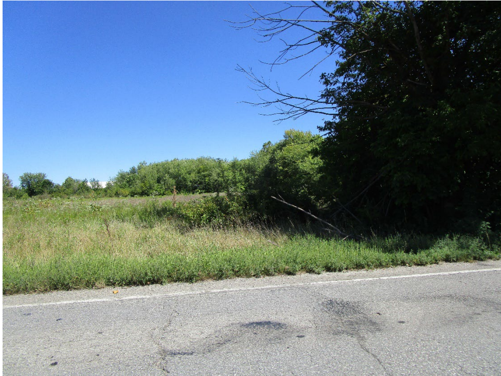
View of site looking east across South Arlington Avenue