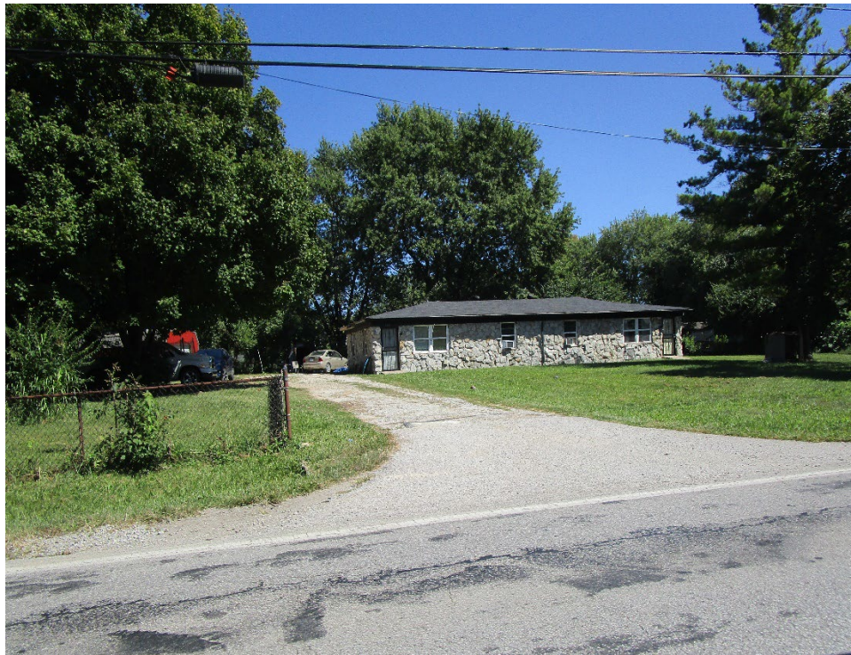
View looking across South Arlington Avenue at the adjacent dwelling to the south