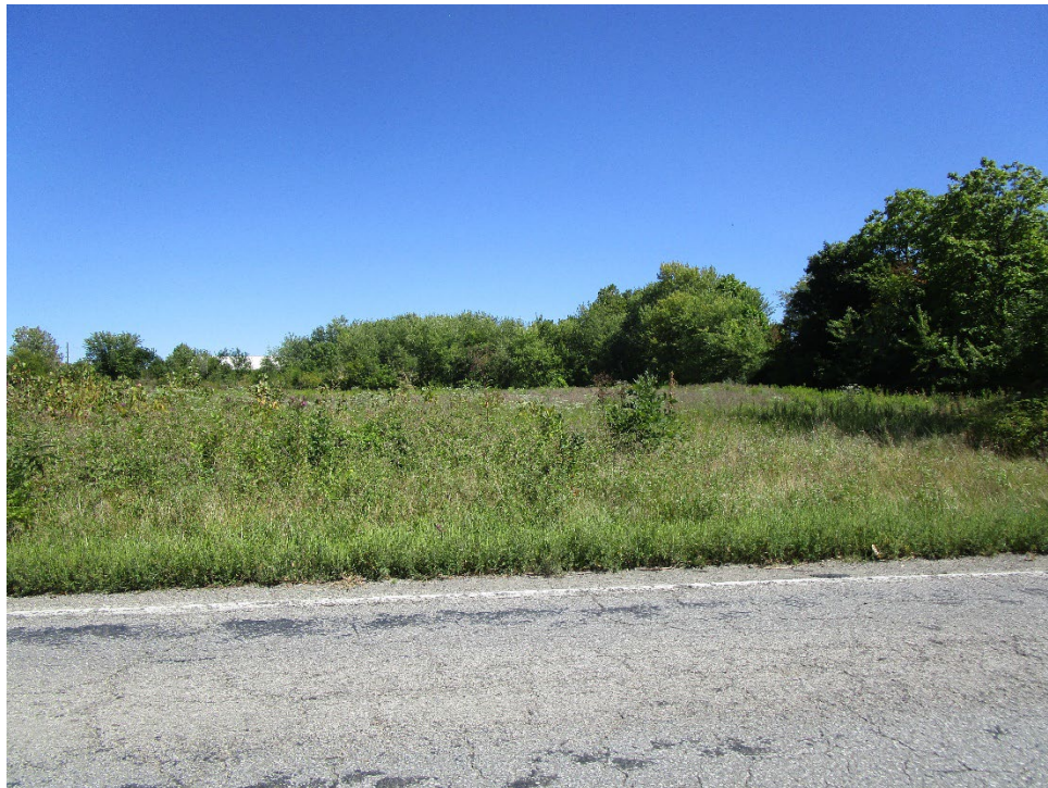
View of site looking east across South Arlington Avenue