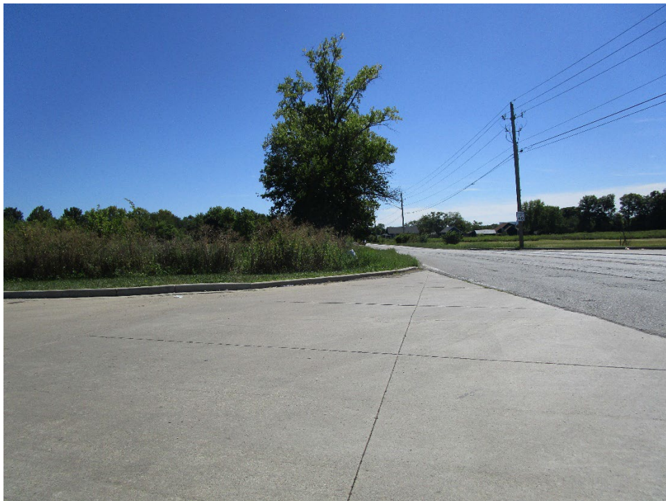
View looking south along South Arlington Avenue