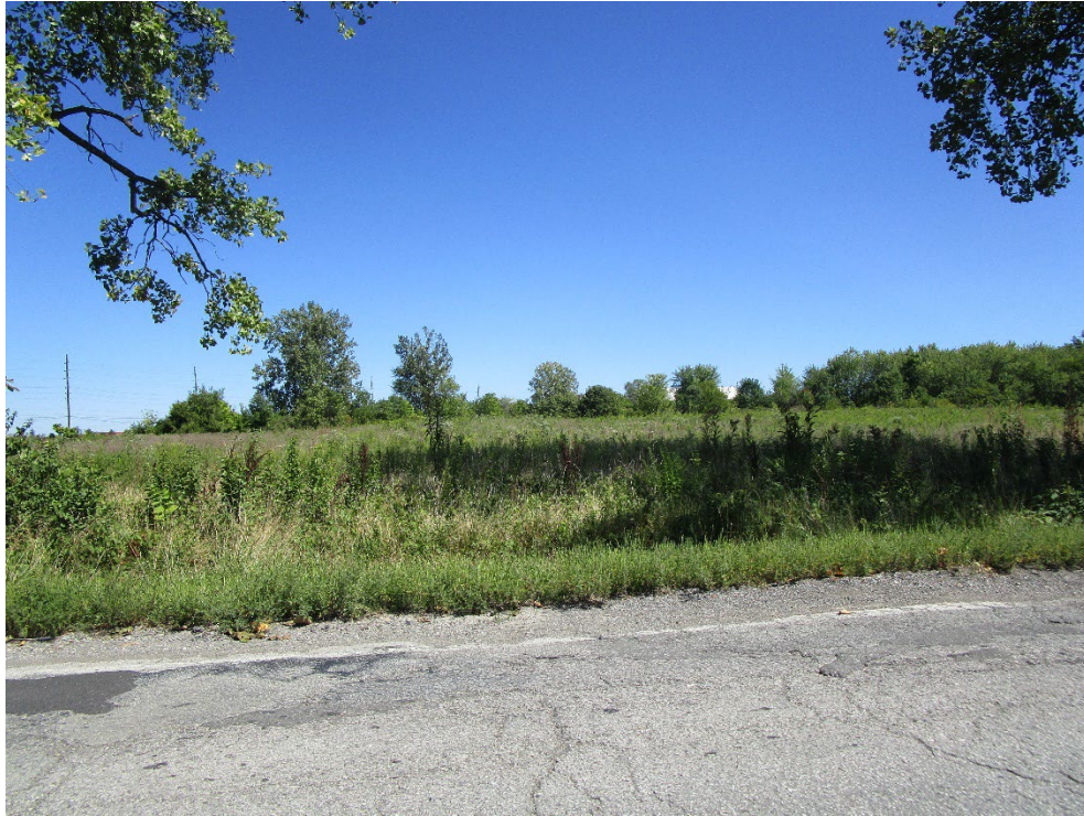
View of site looking east across South Arlington Avenue