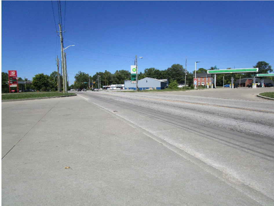
View looking north along South Arlington Avenue