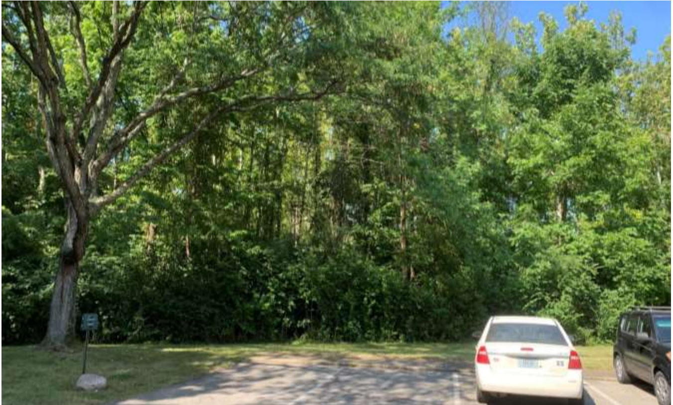
Photo of the wooded the subject site looking north from the quadrominiums southeast of the site.