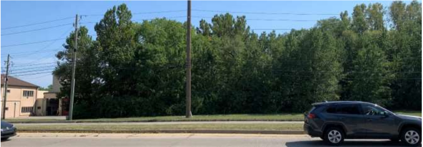
Photo of the street frontage along 86 th Street looking south.