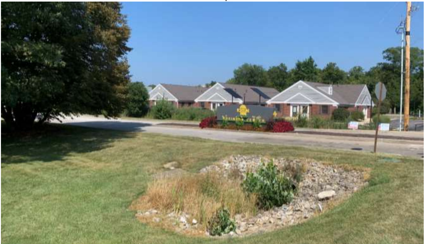
Entrance to a commercial business park north of the site.