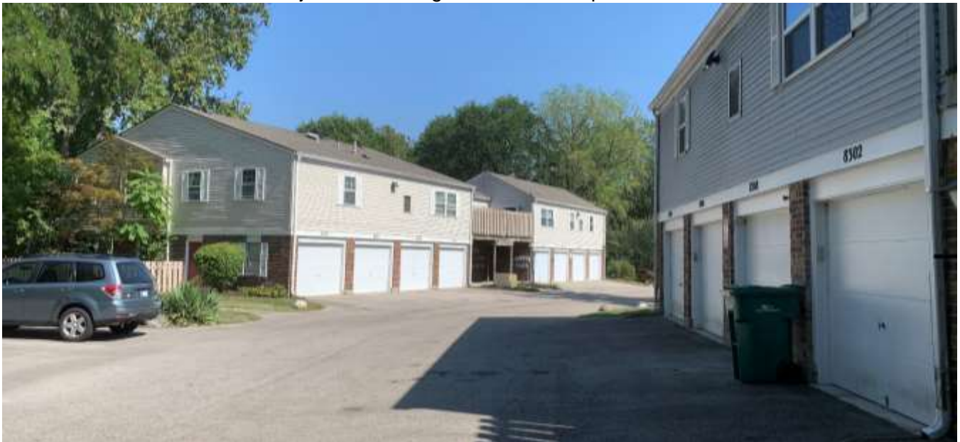
Photo of the quadrominiums southeast of the site looking southeast towards Woodall Drive.