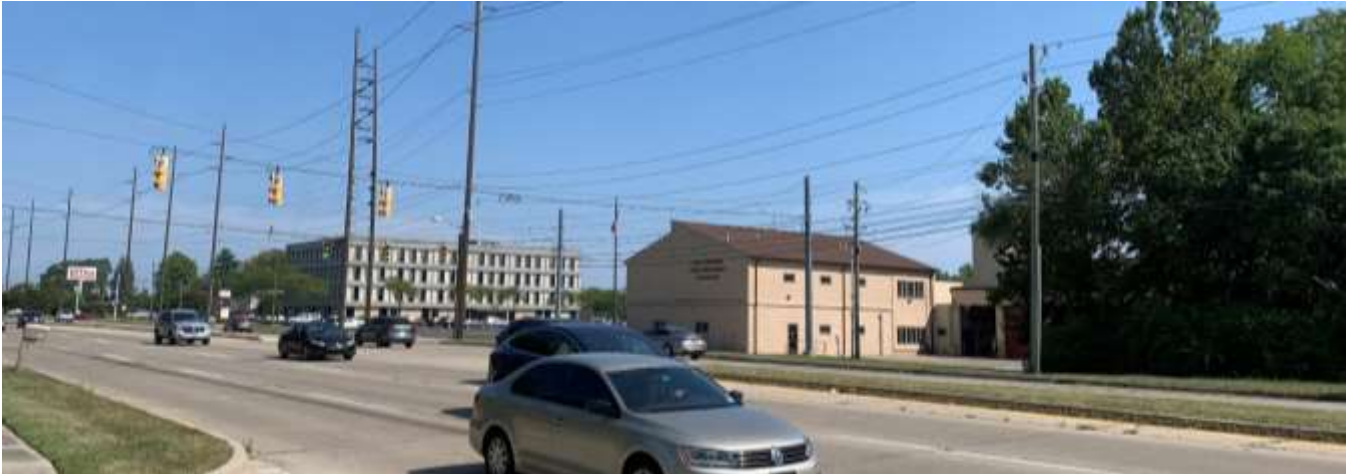
Photo of the eastern property boundary and fire station east of the site looking south from 86 th Street.