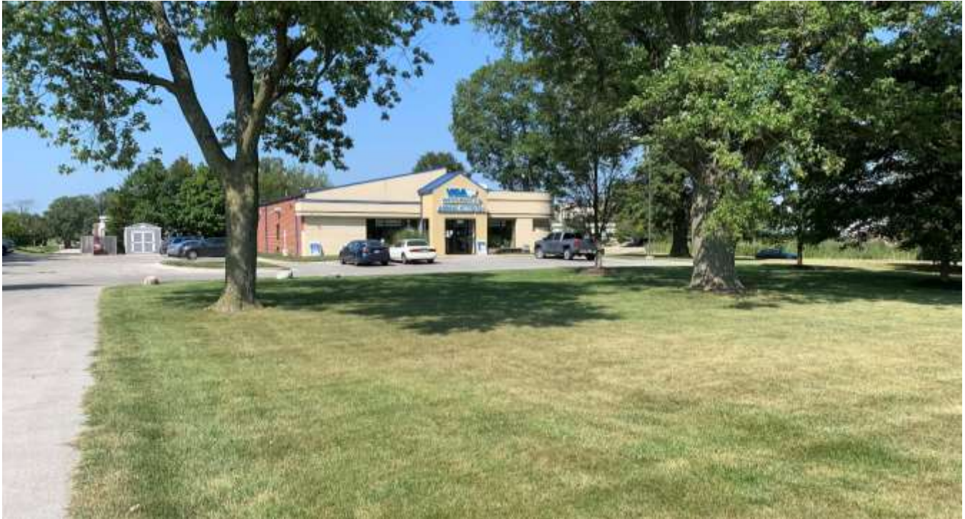
Photo of an animal hospital to the north.