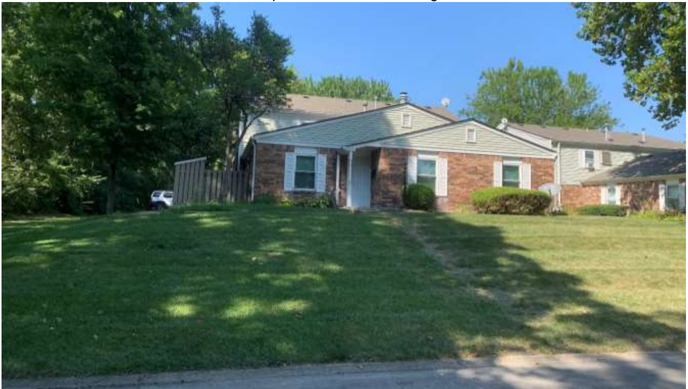
Photo of the adjacent quadrominiums southeast of the site.