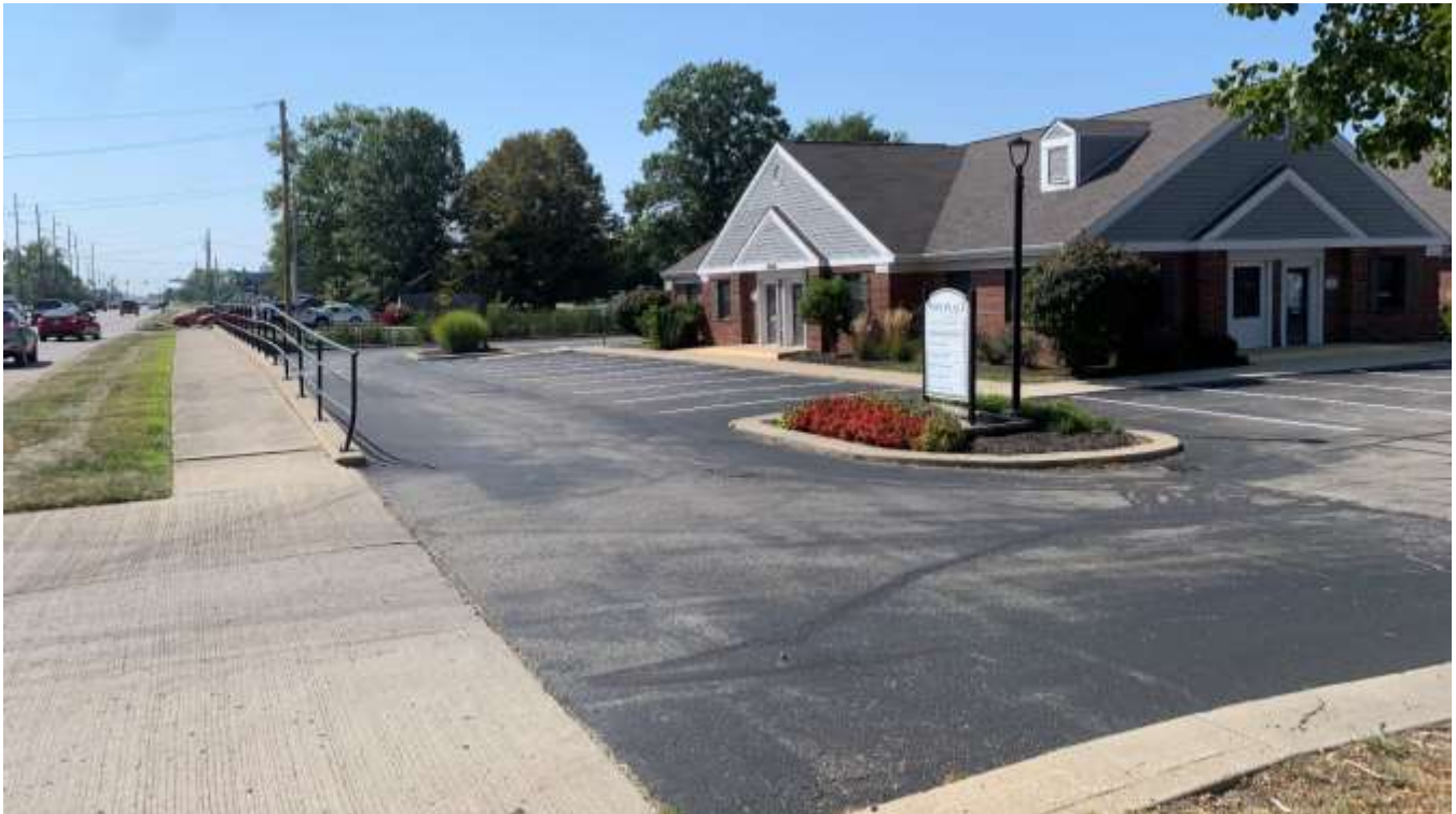
Photo of offices north of the site.