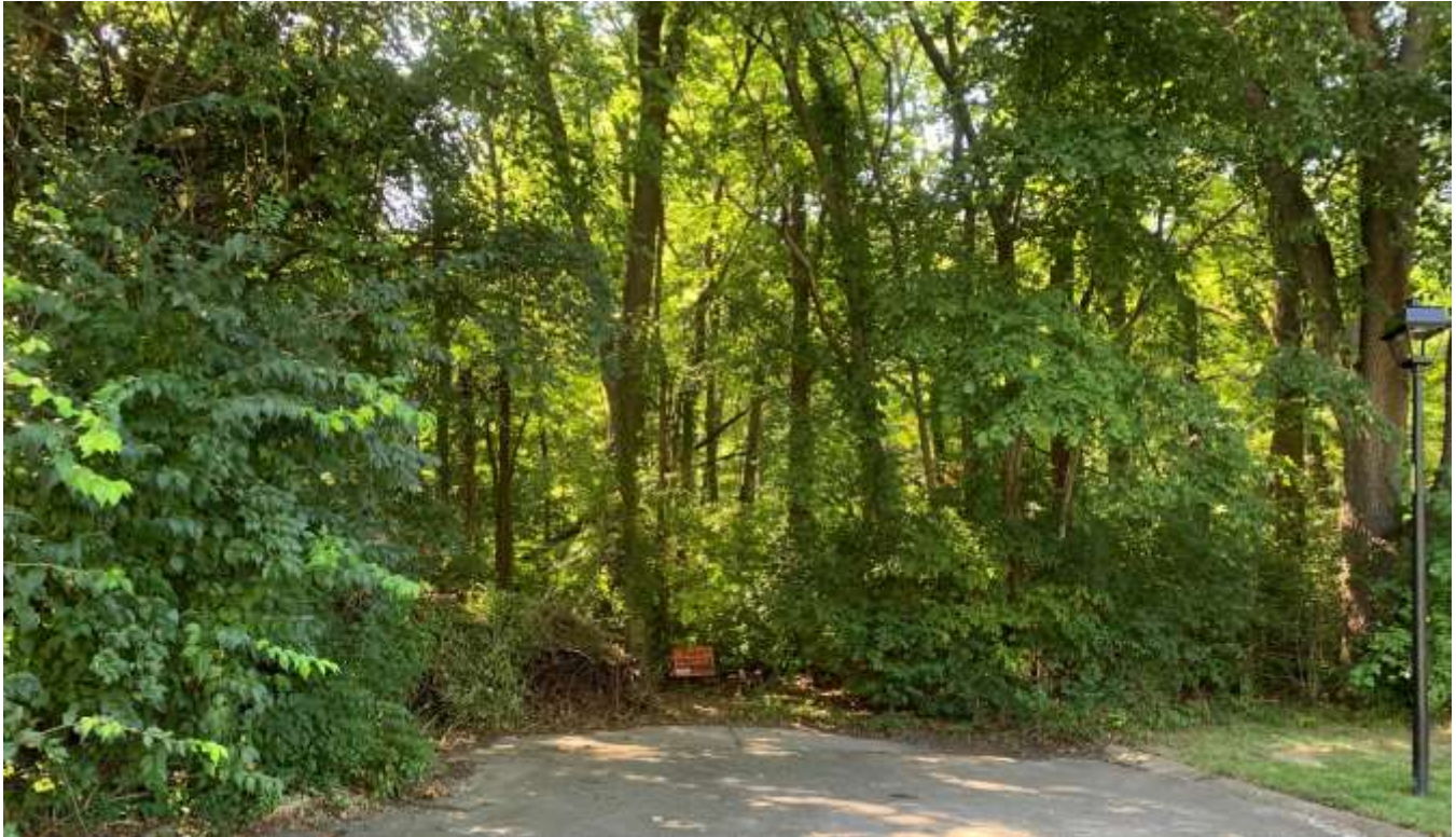
Photo of the southern wooded portion of the site looking west from Braddock Road.