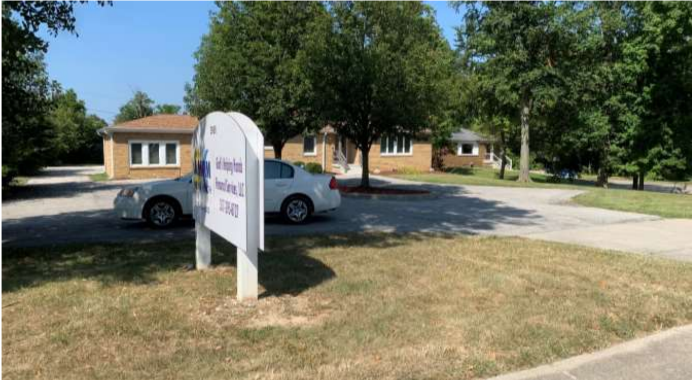
Photo of offices north of the site.