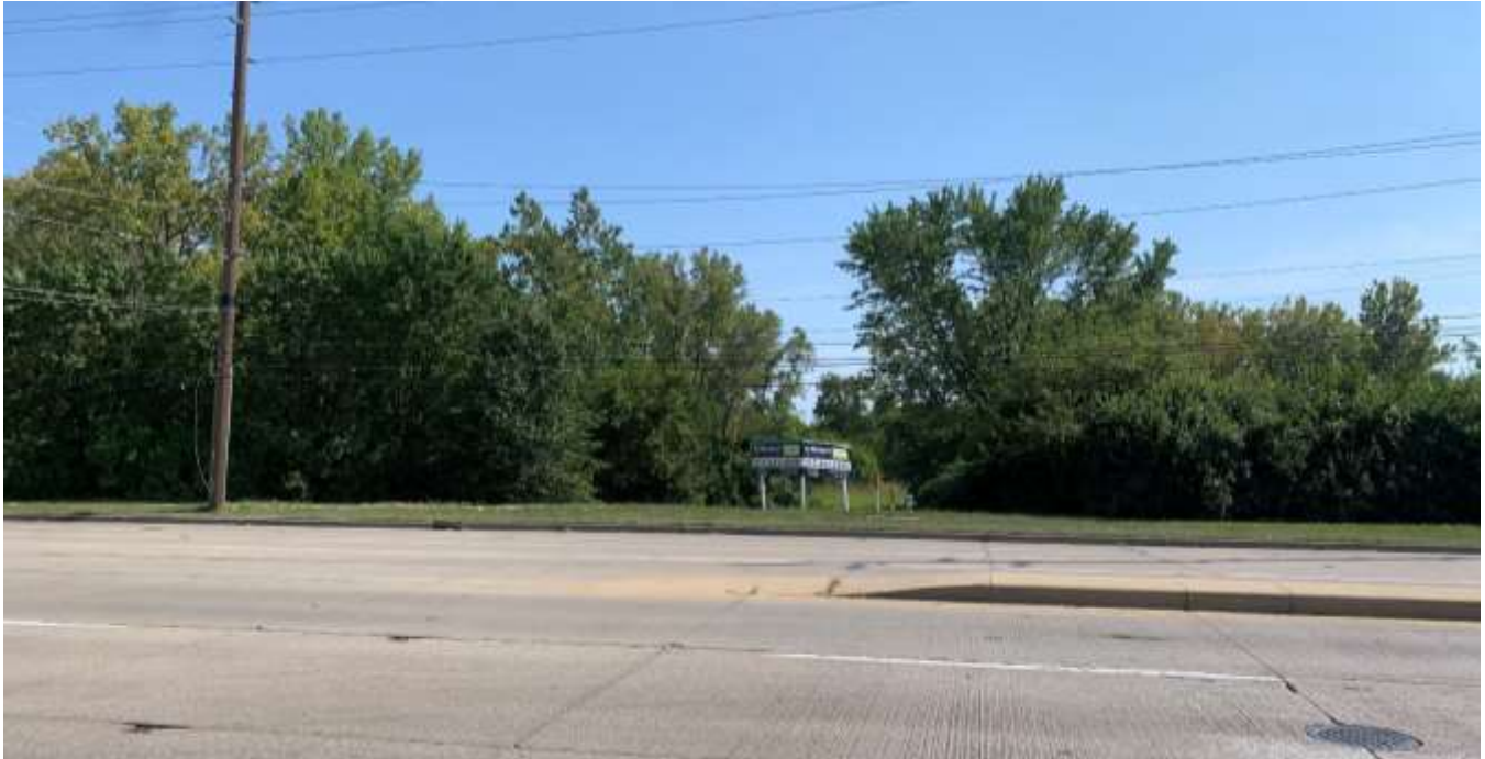
Photo of the street frontage along 86 th Street looking south toward proposed entrance drive.