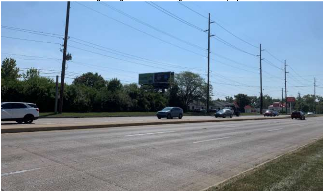
Photo of the street frontage along 86 th Street looking south.