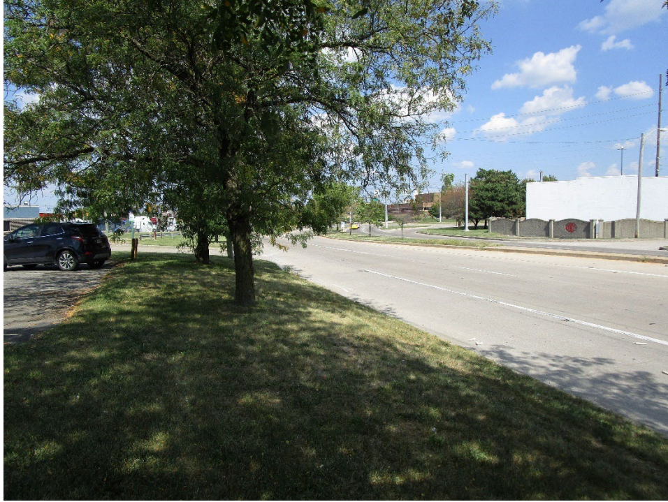
View looking north along Kentucky Avenue