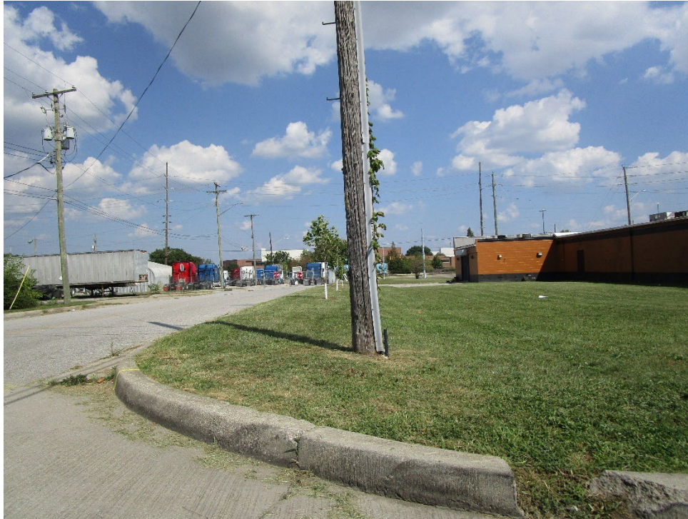
View looking east along West Minnesota Street