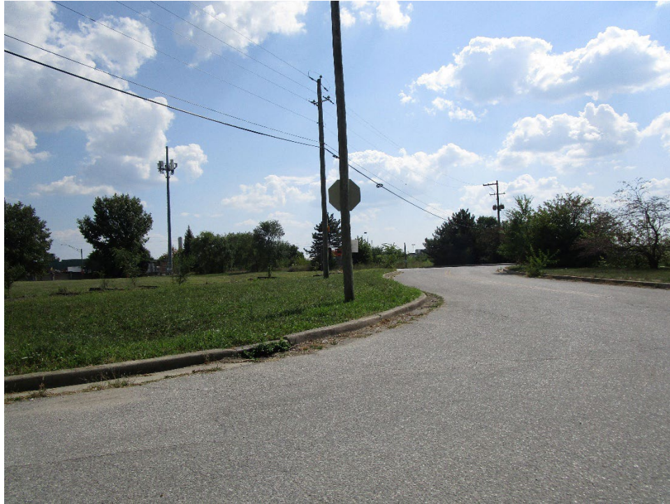
View of site looking west across Minnesota Way