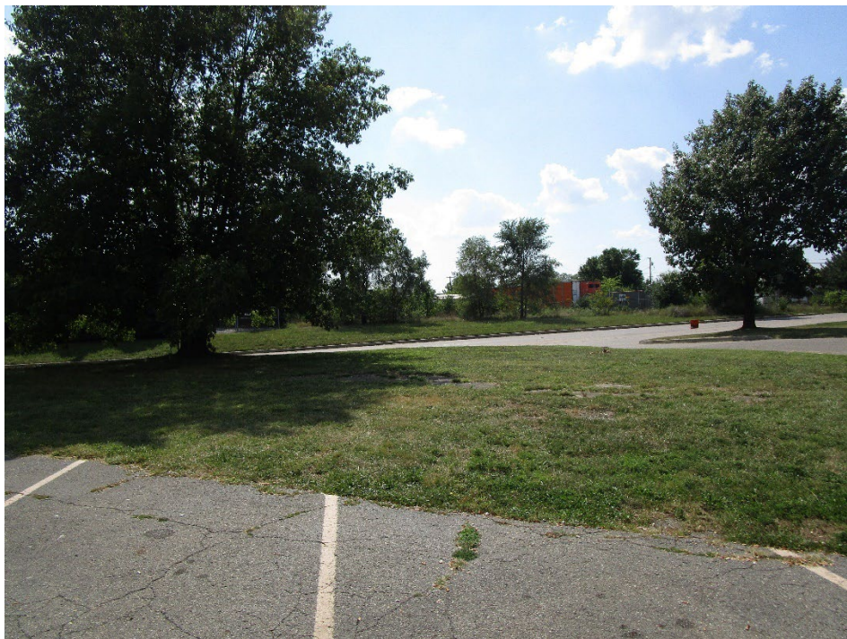
View from site looking west across Minnesota Way