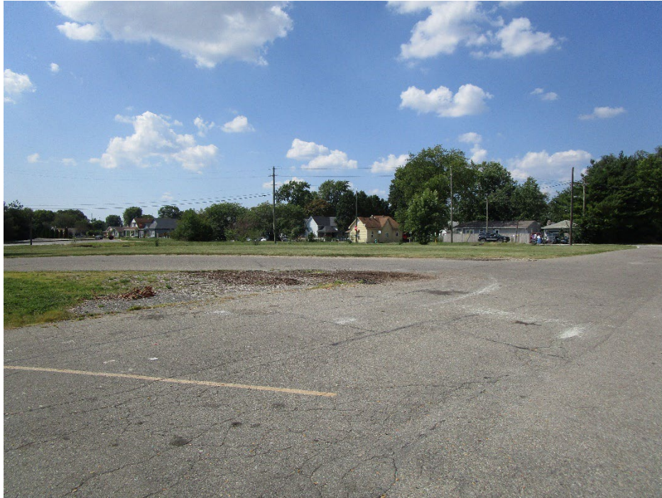
View from site looking northwest across Reisner Street