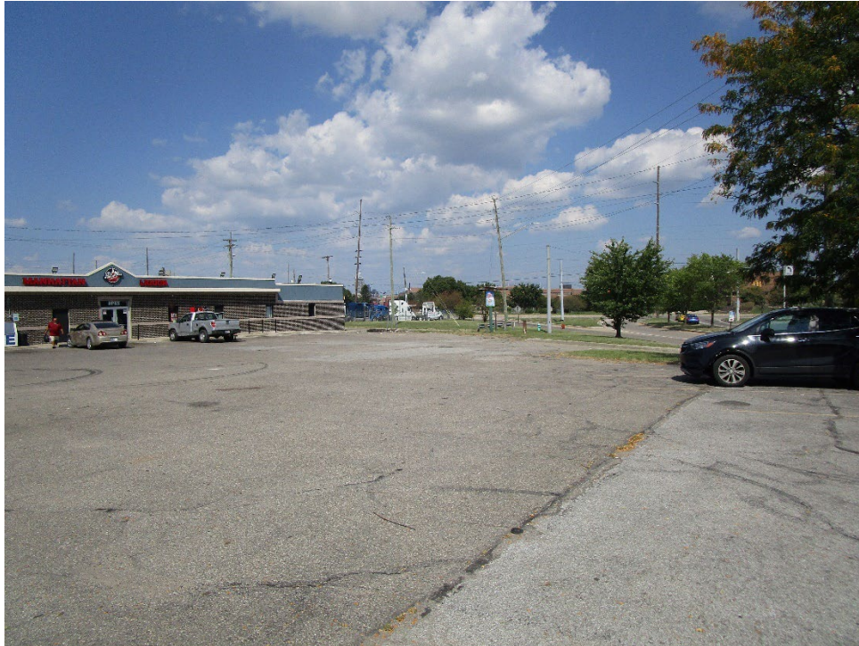
View of site looking northeast