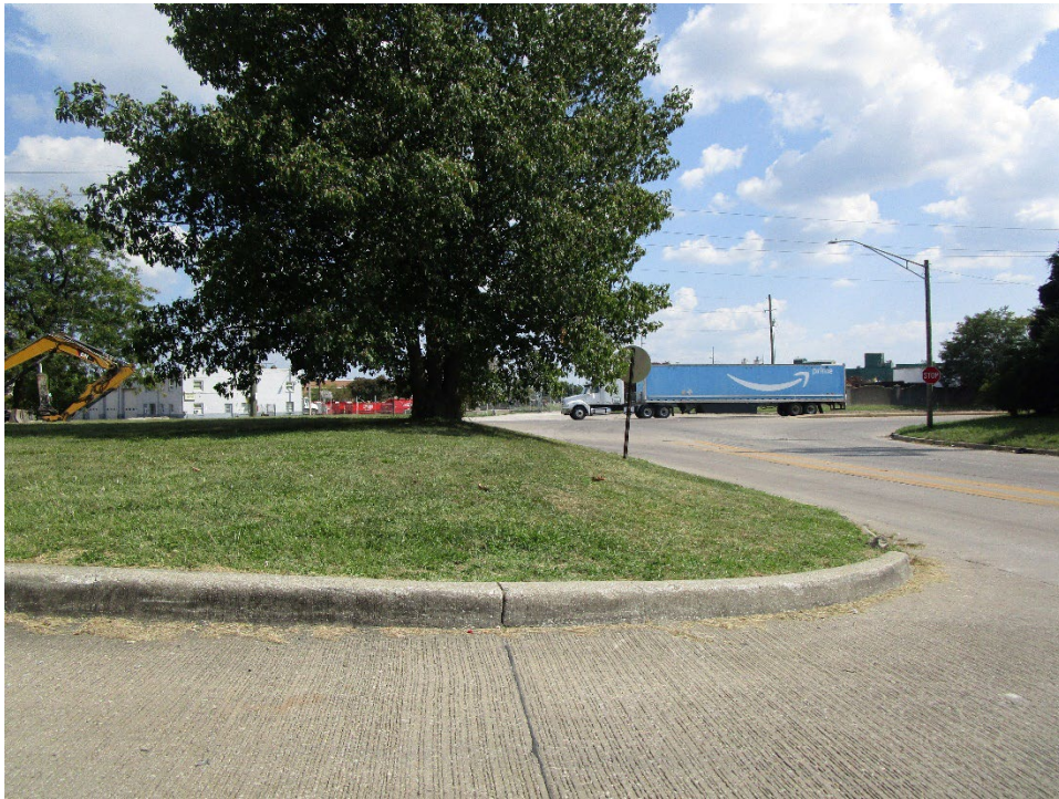
View of site looking east across Minnesota Way