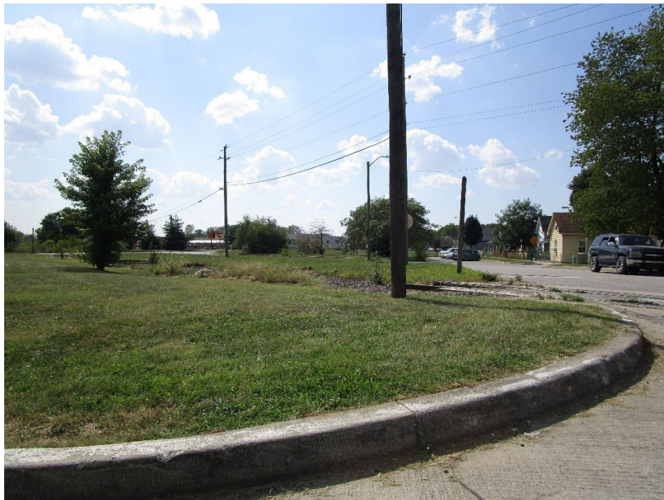
View looking west along West Minnesota Street