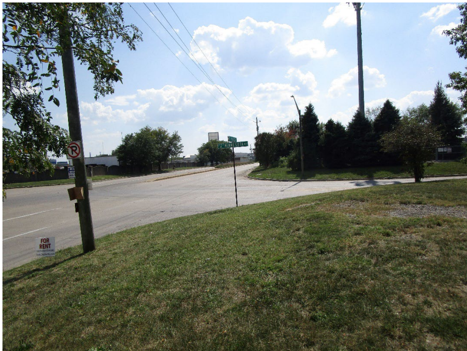
View looking south along Kentucky Avenue