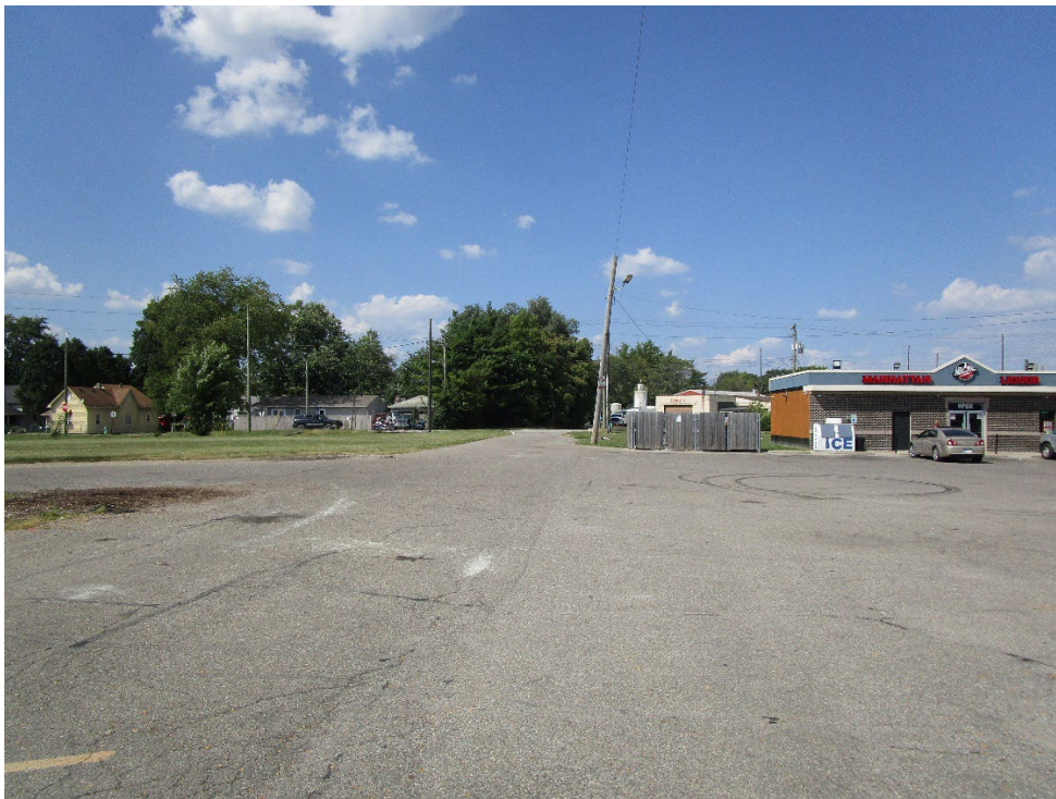
View of site looking north