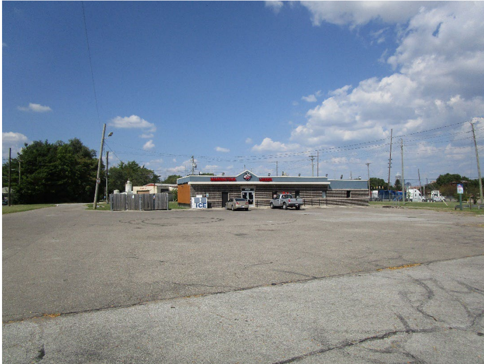
View of site looking north