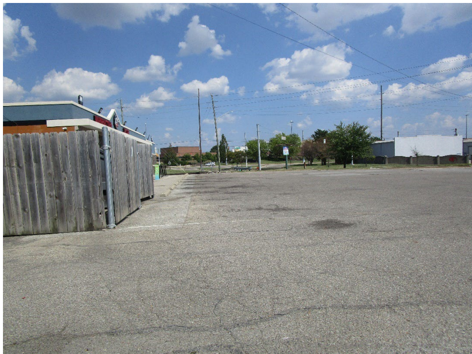
View of site looking east