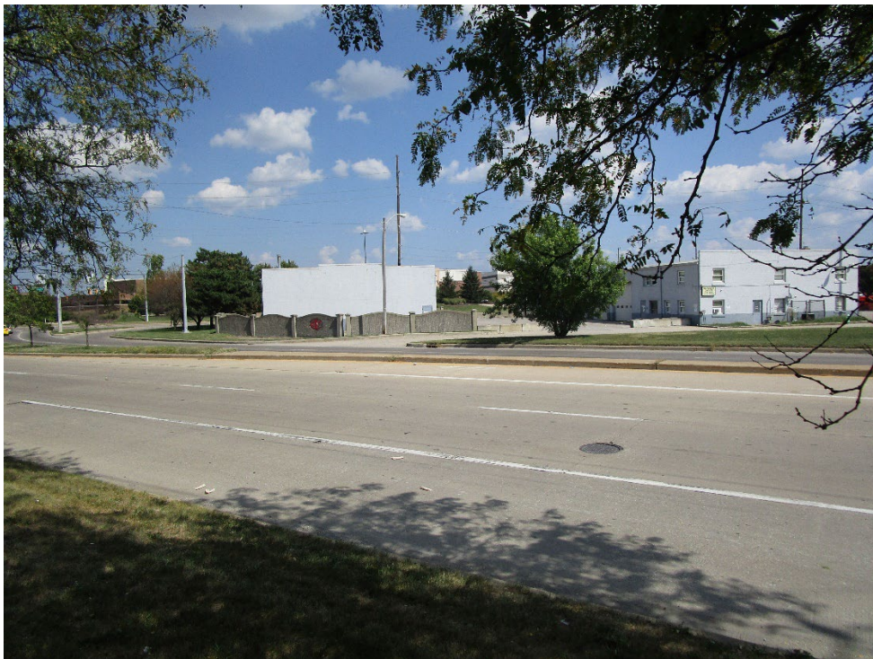
View from site looking southeast across Kentucky Avenue