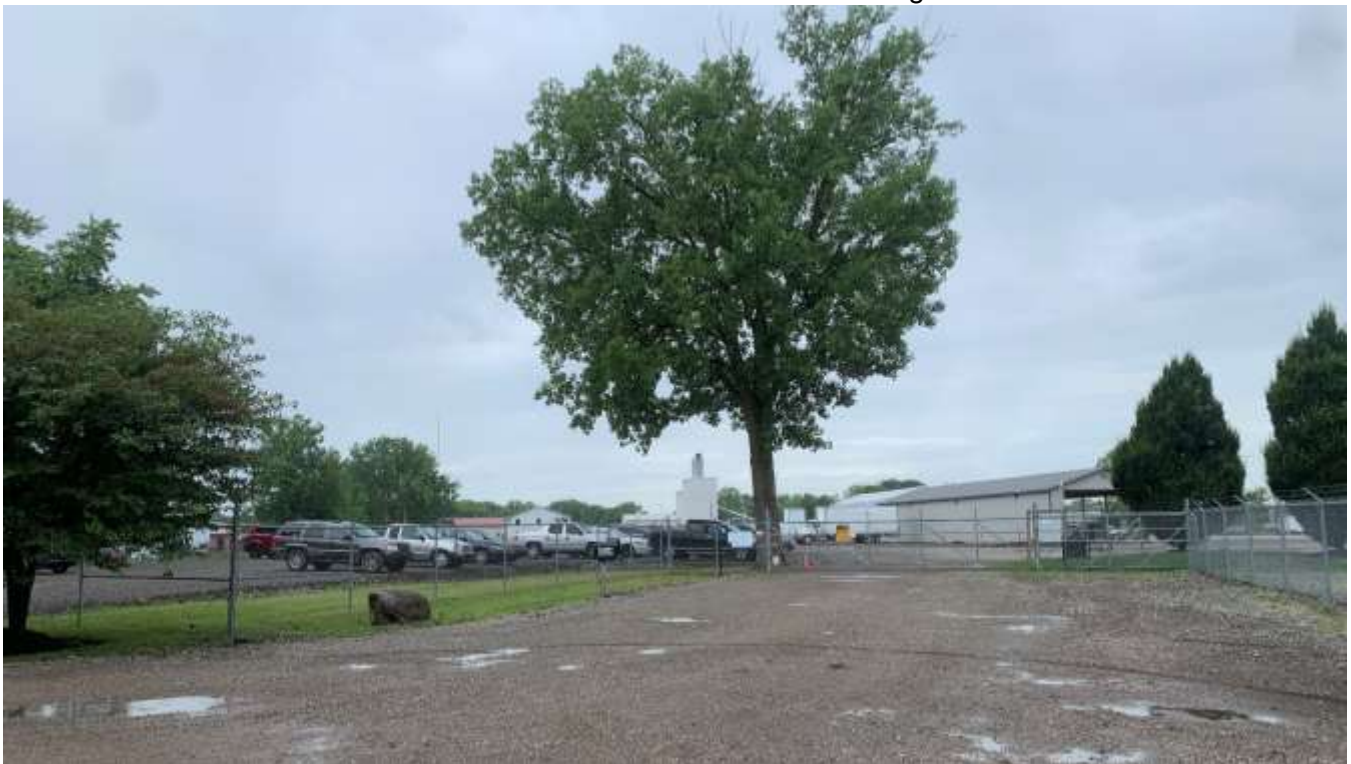
Photo of the concrete contractor business to the west.