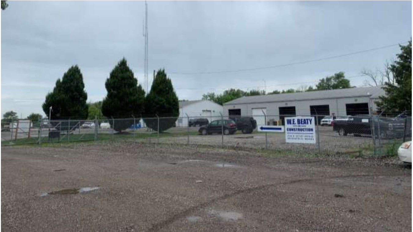
Photo of the concrete contractor business looking northwest.