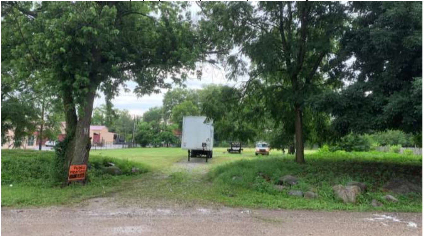
Photo of the subject site looking east.