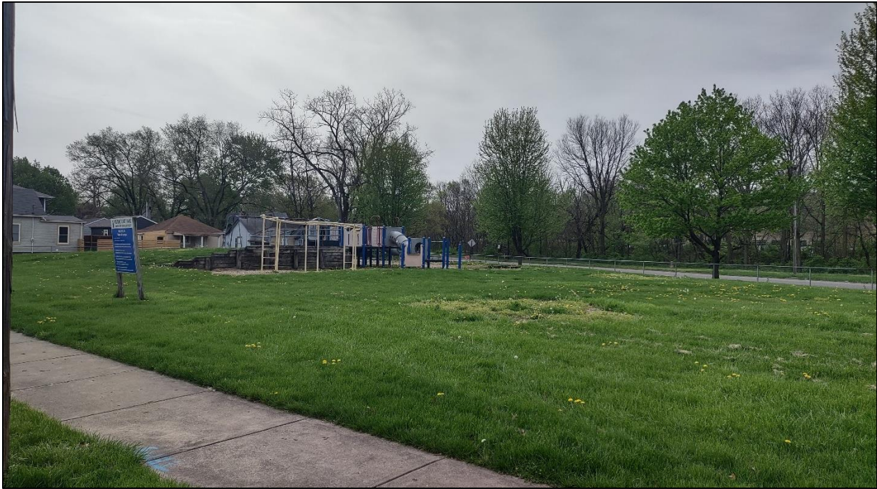
View of the site from Orange St looking southeast