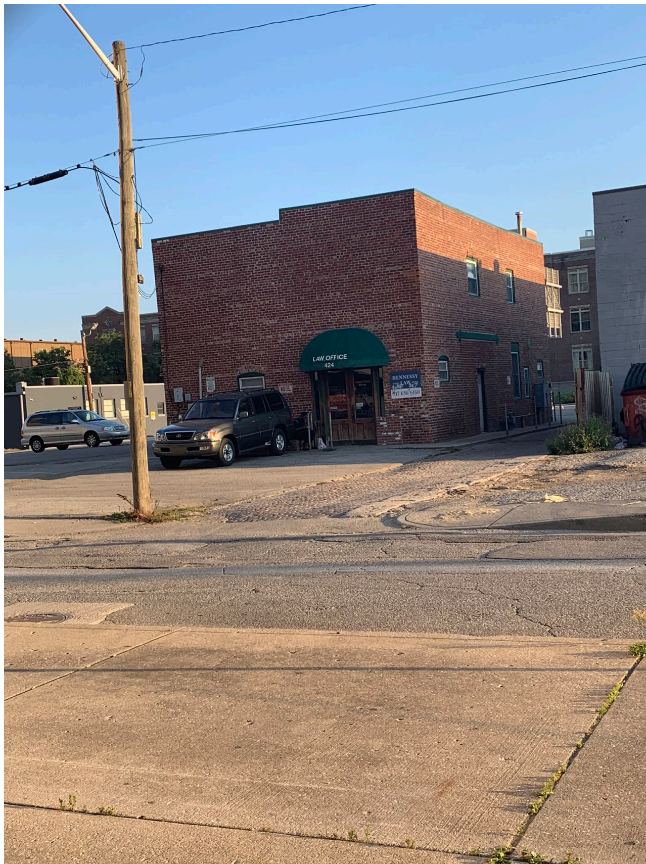
View of existing structure at 419 East Ohio Street and the proposed subject alley 2022-CZN-848 / 2022-CVC-848 / 2022-CVR-848