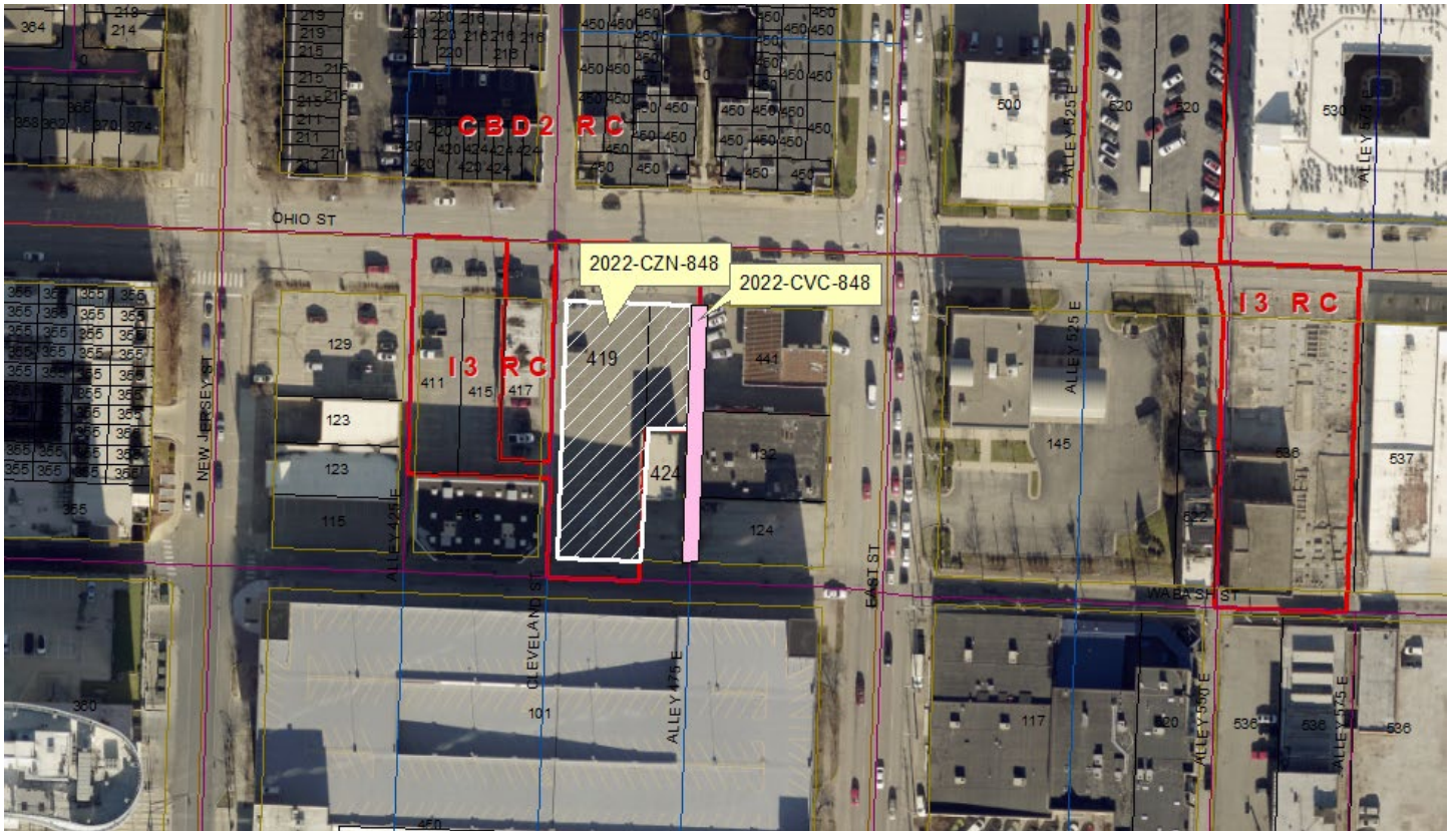
Zoning and aerial maps of the site and surrounding area 2022-CZN-848 / 2022-CVC-848 / 2022-CVR-848