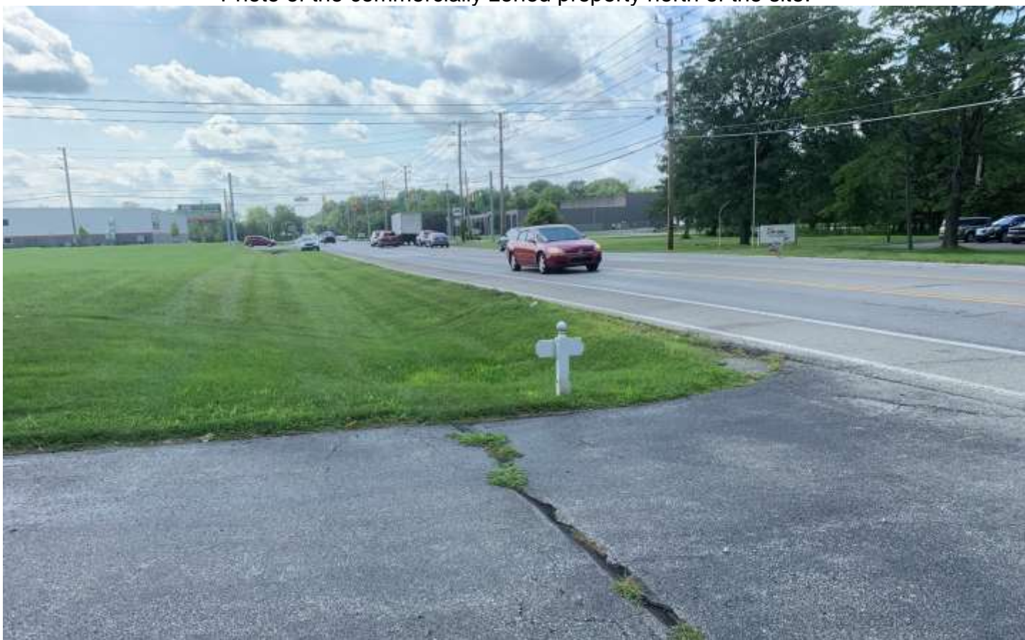
Photo of the street frontage looking west on 71 st Street.