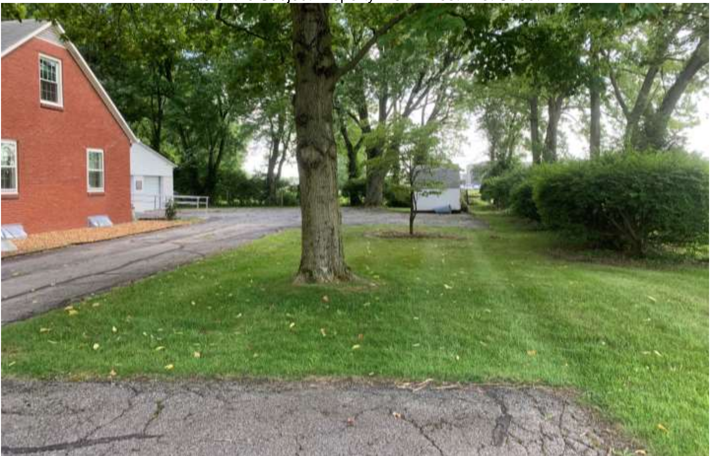
Photo of the western property boundary of the site.