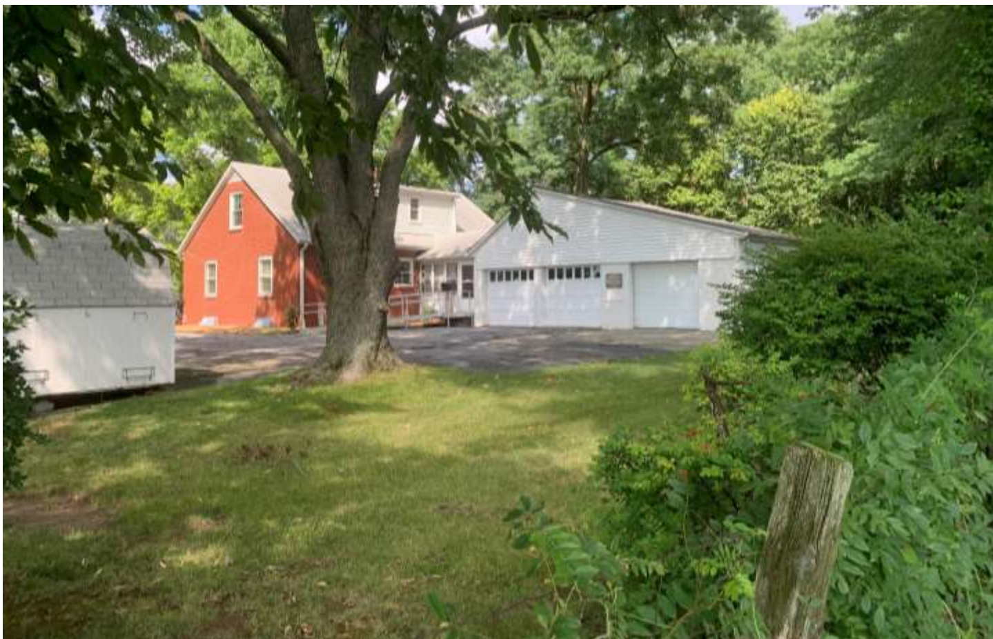
Photo of the existing buildings on site.