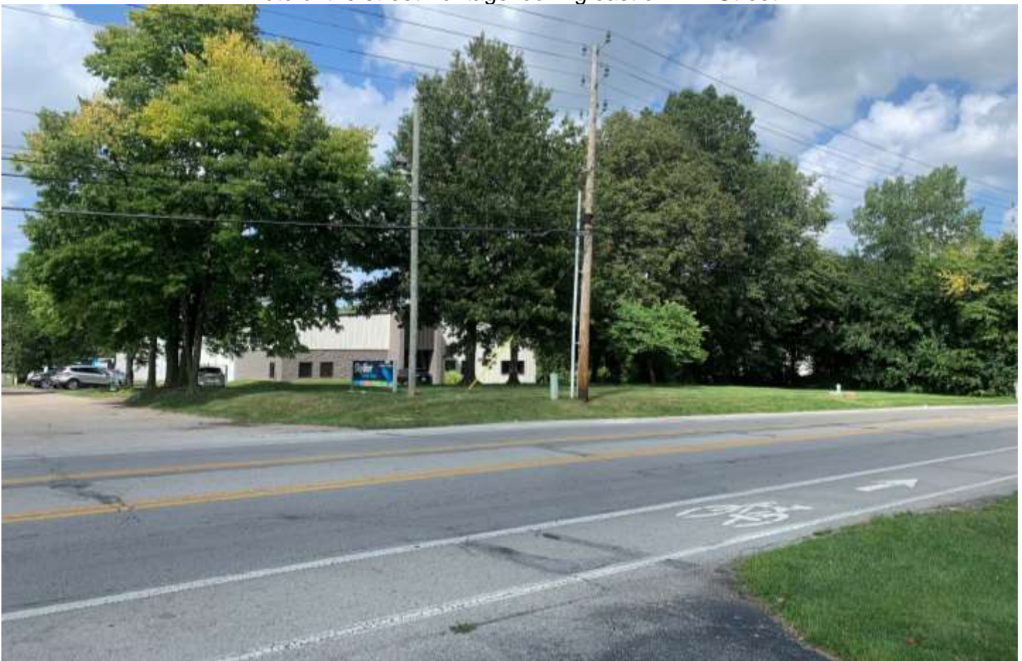
Photo of the industrially zoned property north of the site.