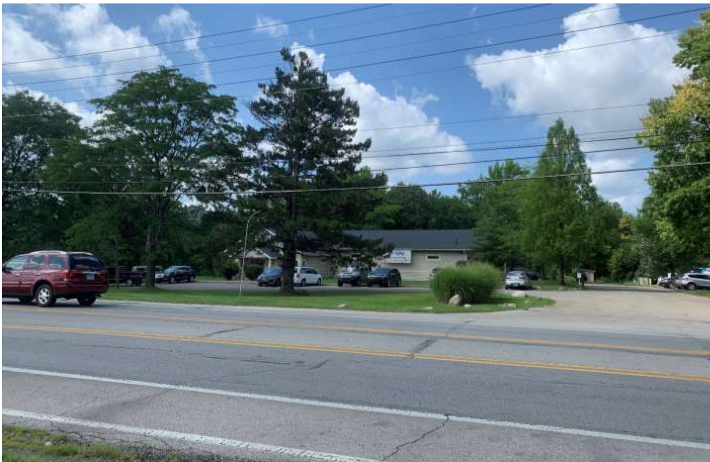
Photo of the commercially zoned property north of the site.