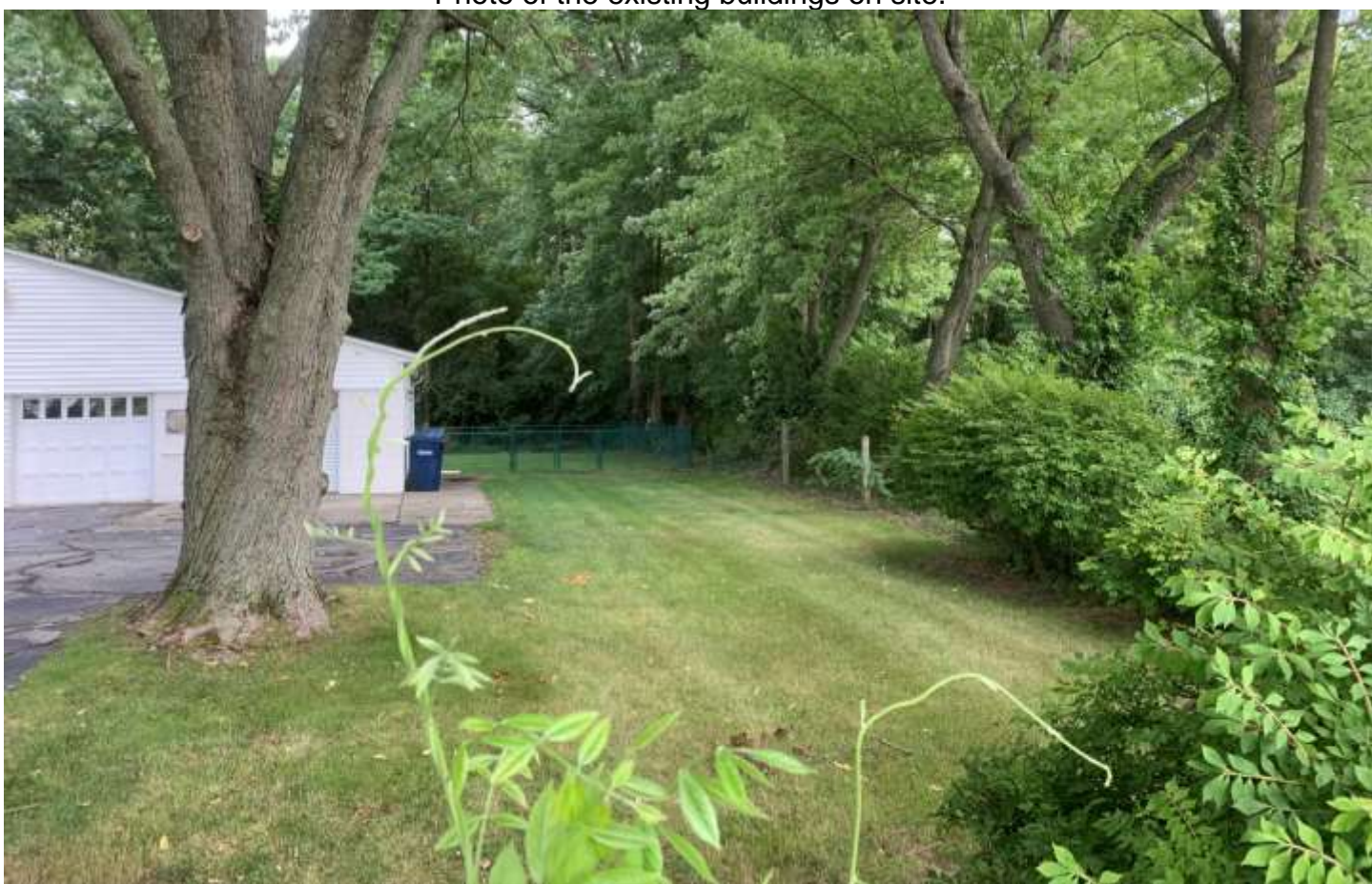
Photo of the southern property boundary.