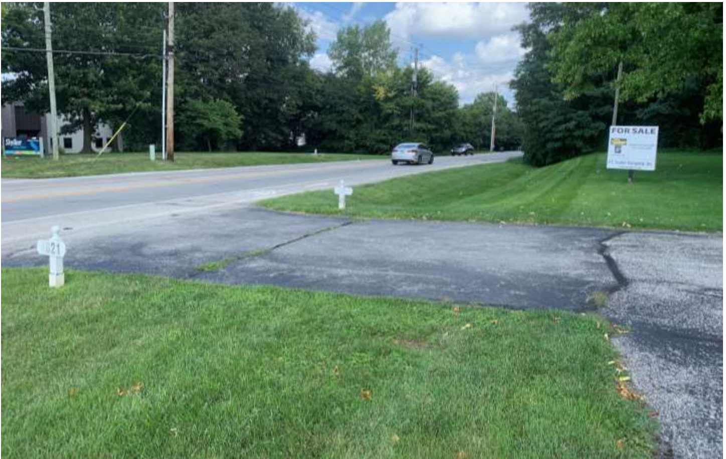
Photo of the street frontage looking east on 71 st Street.