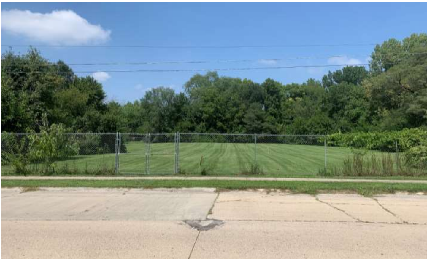
Photo of the undeveloped southwest portion of the subject site included in the rezone request.