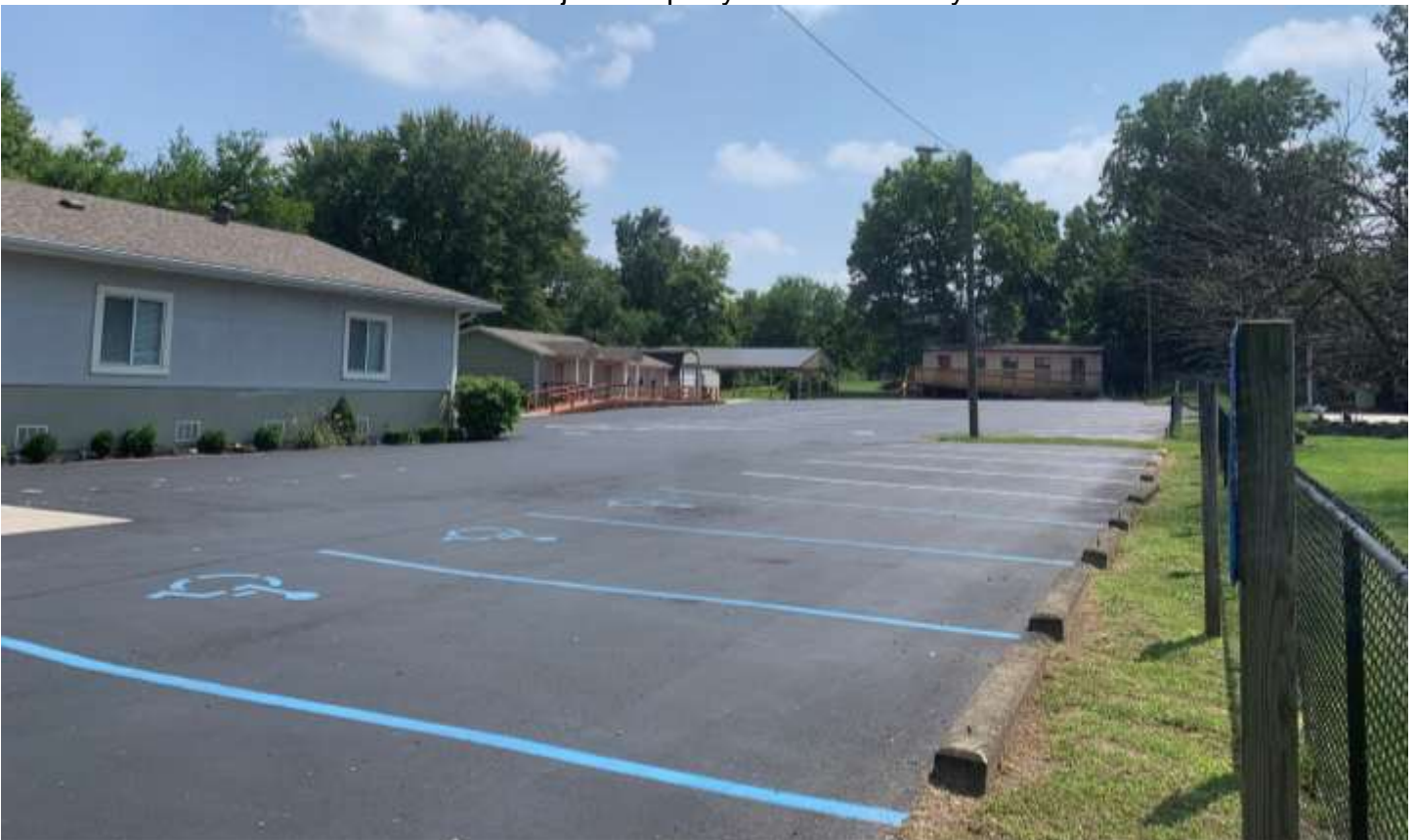
View of the church parking lot looking south at the portion of the site not included in the request.