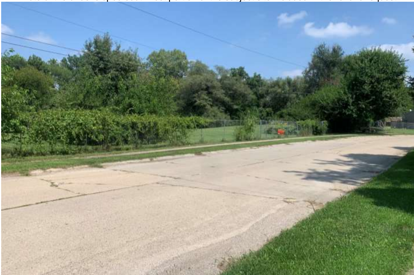
View of the entire street frontage along Merts Drive in the rezone request.