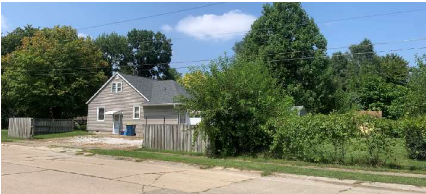
Photo of the abutting single-family dwelling west of the site.