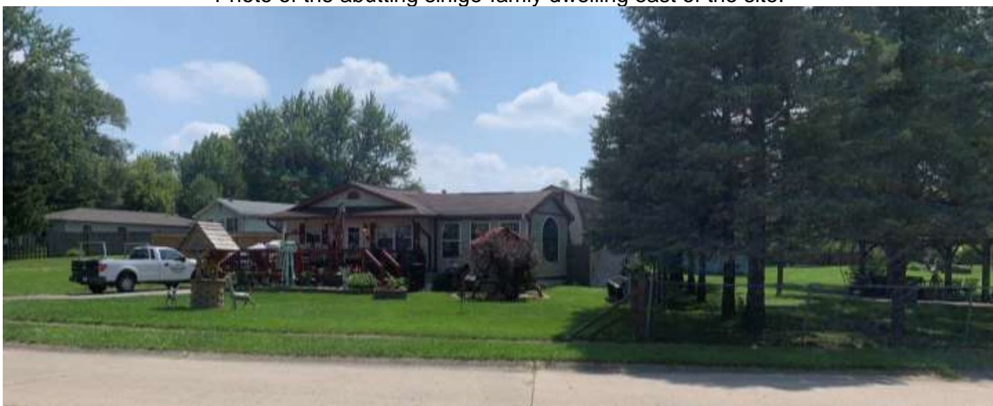
Photo of the single-family dwelling south of the site across Merts Drive.