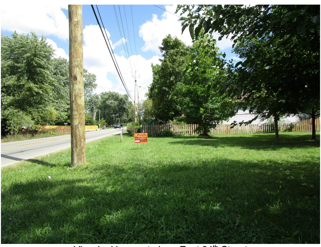
View looking east along East 34<sup>th</sup> Street