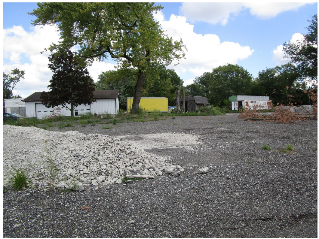
View looking east