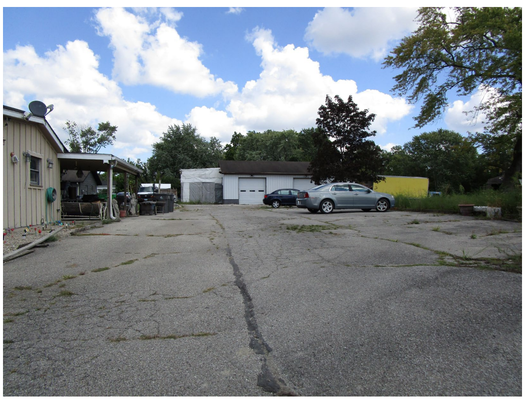
View looking east