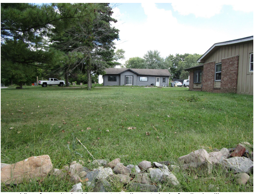
View from site looking east at adjacent single-family dwellings