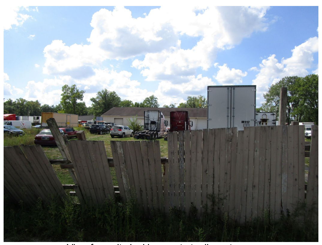
View from site looking west at adjacent uses