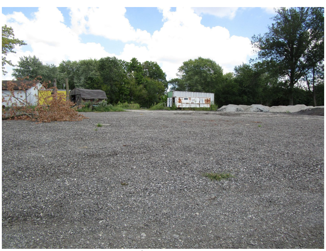
View of site looking east