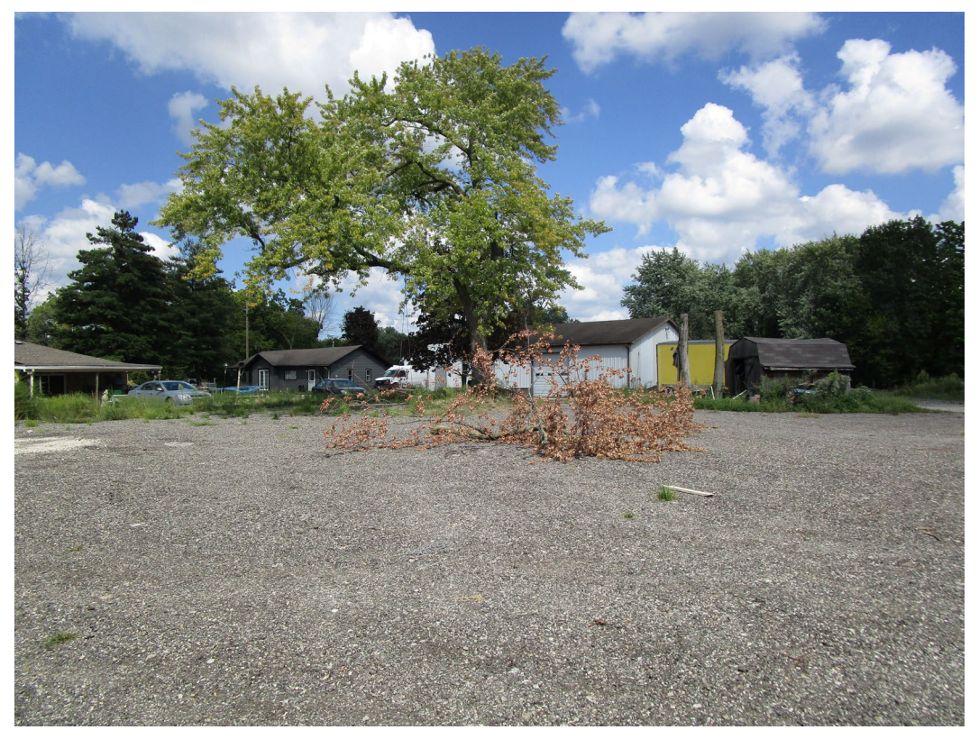
View of site looking northeast