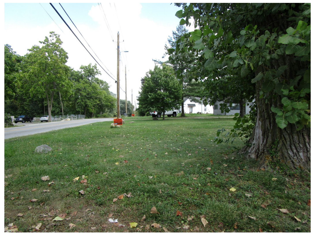
View looking east along East 34th Street