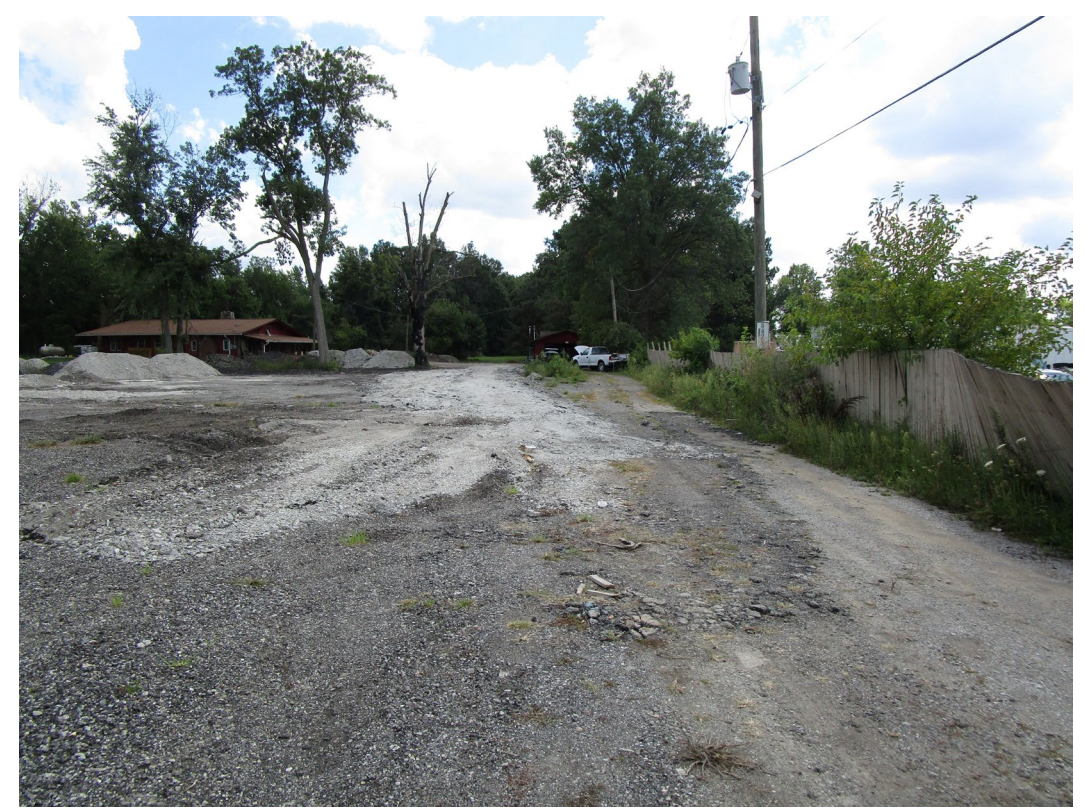
View of site looking south