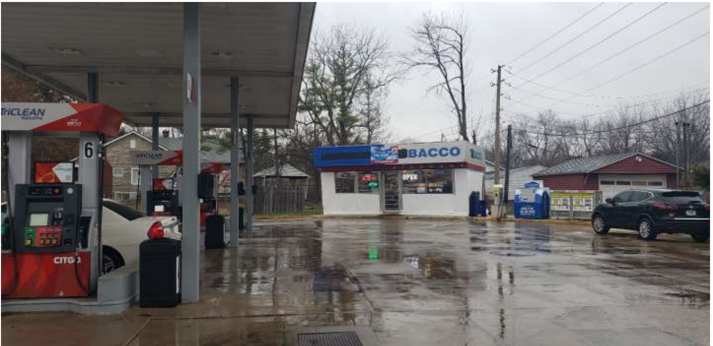
Photo of the existing fueling station and convenience store.