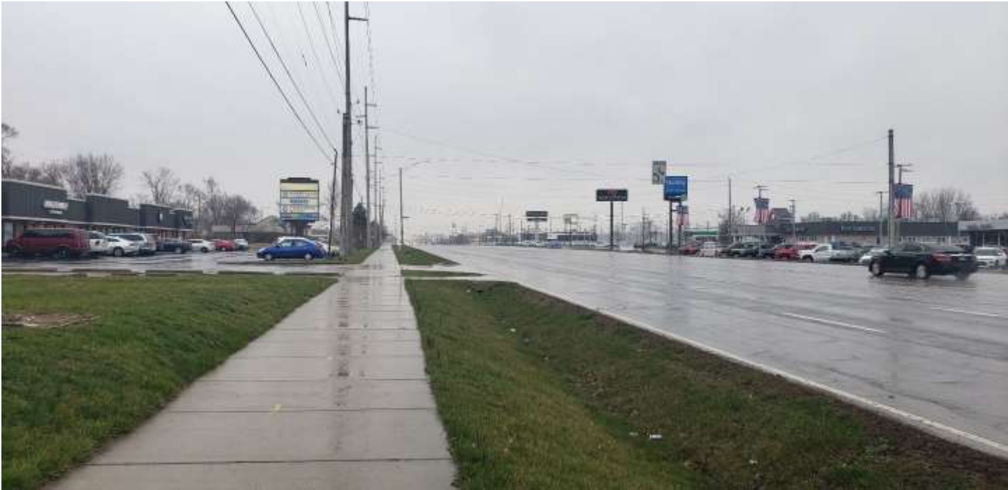
Photo of existing freestanding signs looking south along Shadeland Avenue.