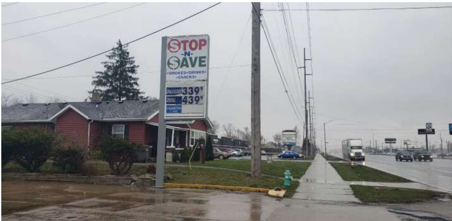
West view of the existing pole sign