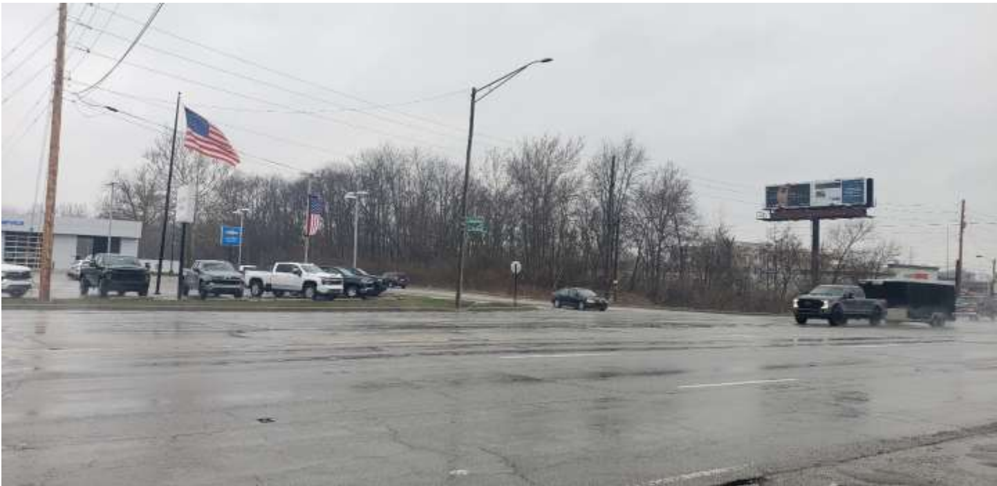
Photo of existing freestanding signs west of the subject site.