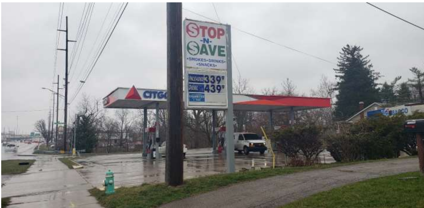
North view of the existing pole sign.