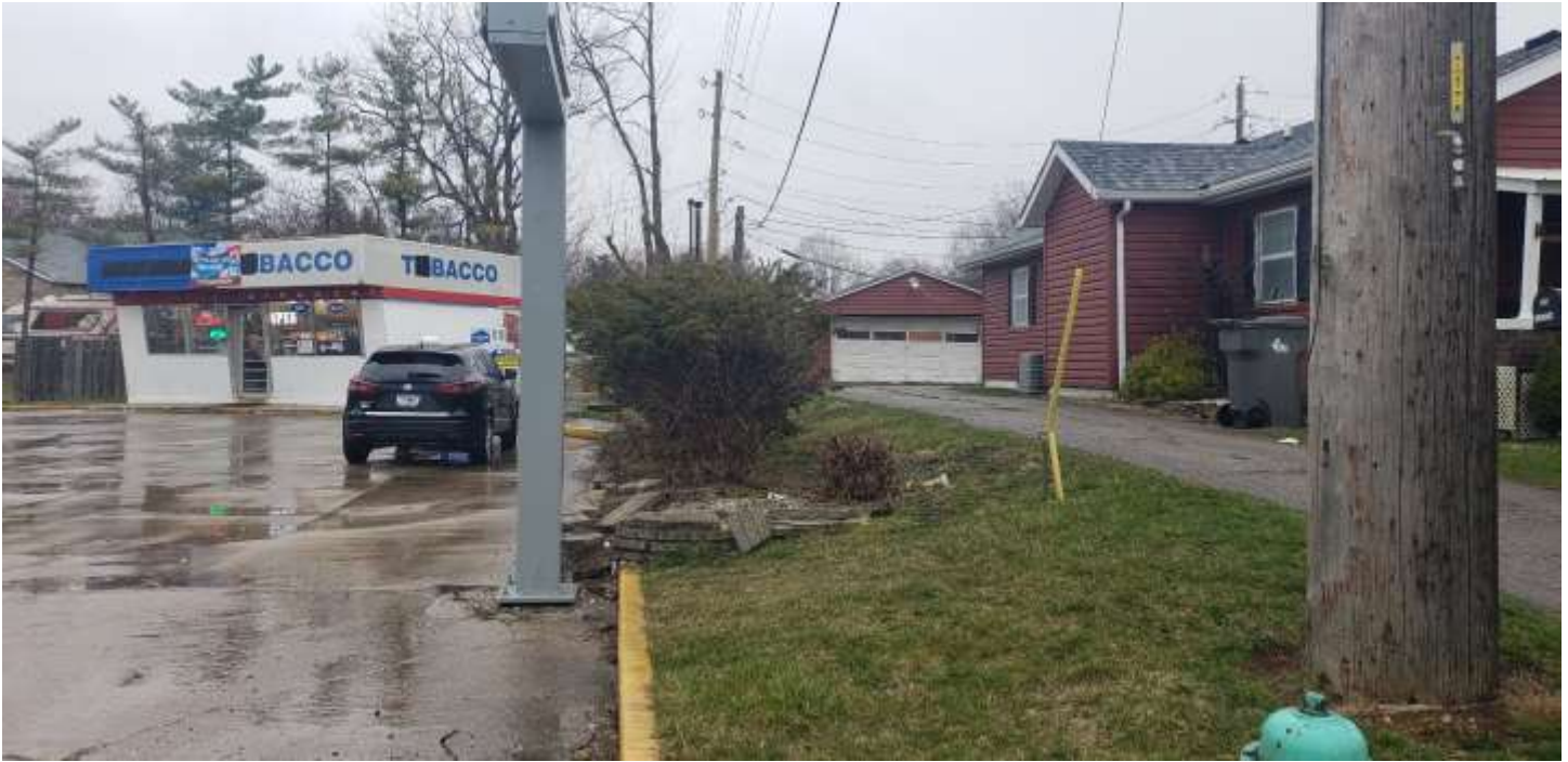
Photo of the ten-foot separation from the single-family dwelling to the south.