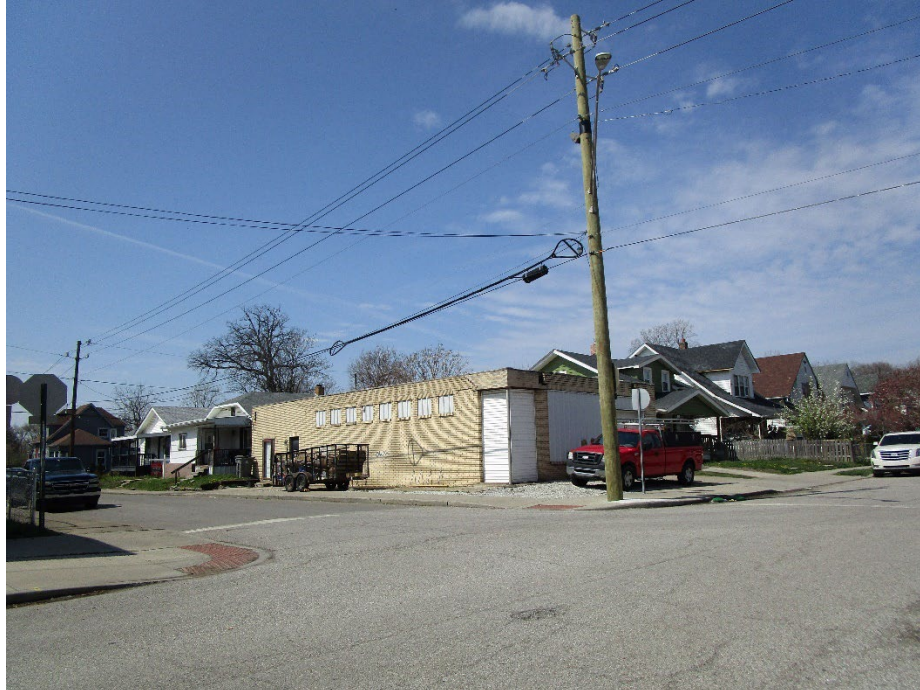
View looking northwest across intersection on North Olney Street and Nowland Avenue