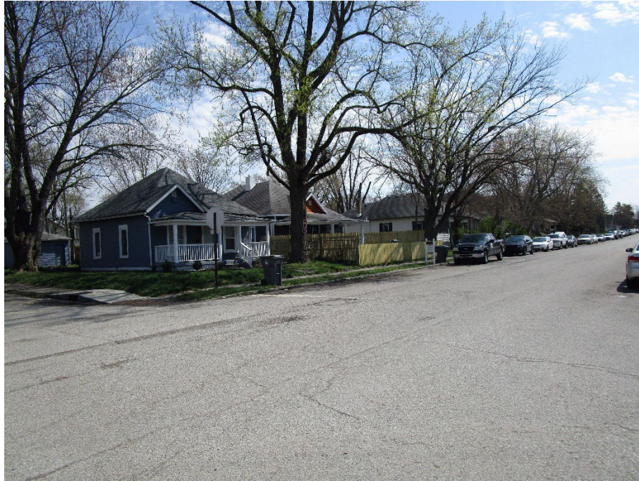
View looking southeast across intersection on North Olney Street and Nowland Avenue