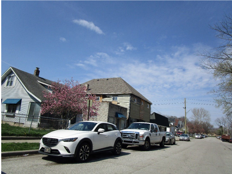
View of site looking northwest across North Olney Street