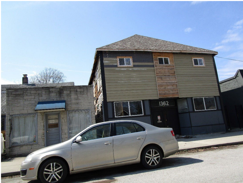
View of site looking west across North Olney Street