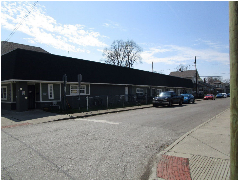
View of site looking southwest across Nowland Avenue