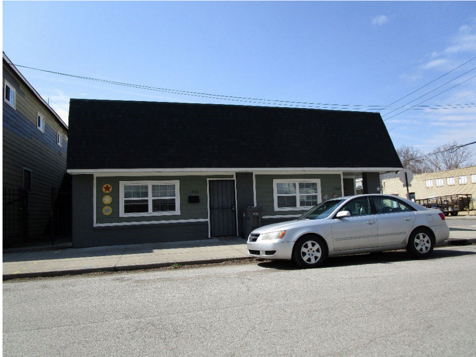
View of site looking west across North Olney Street