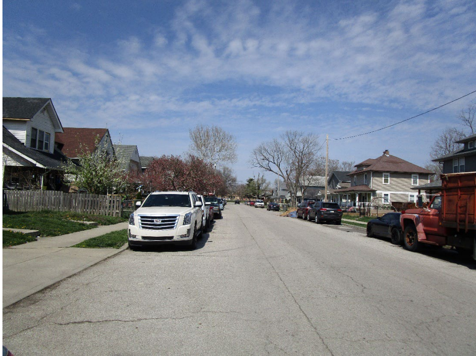
View looking north along North Olney Street