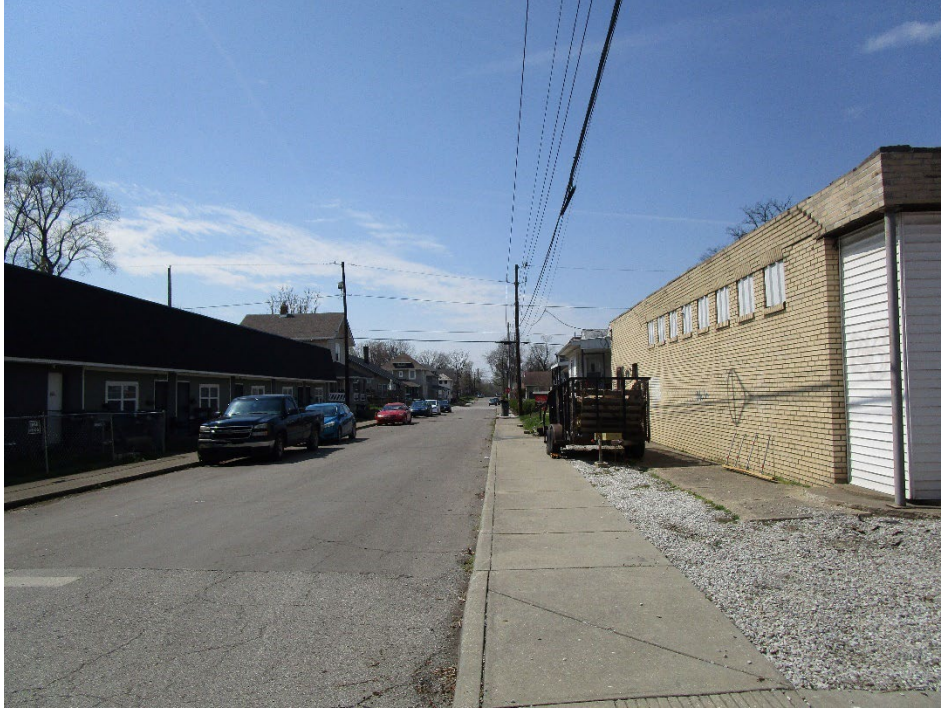
View looking west along Nowland Avenue