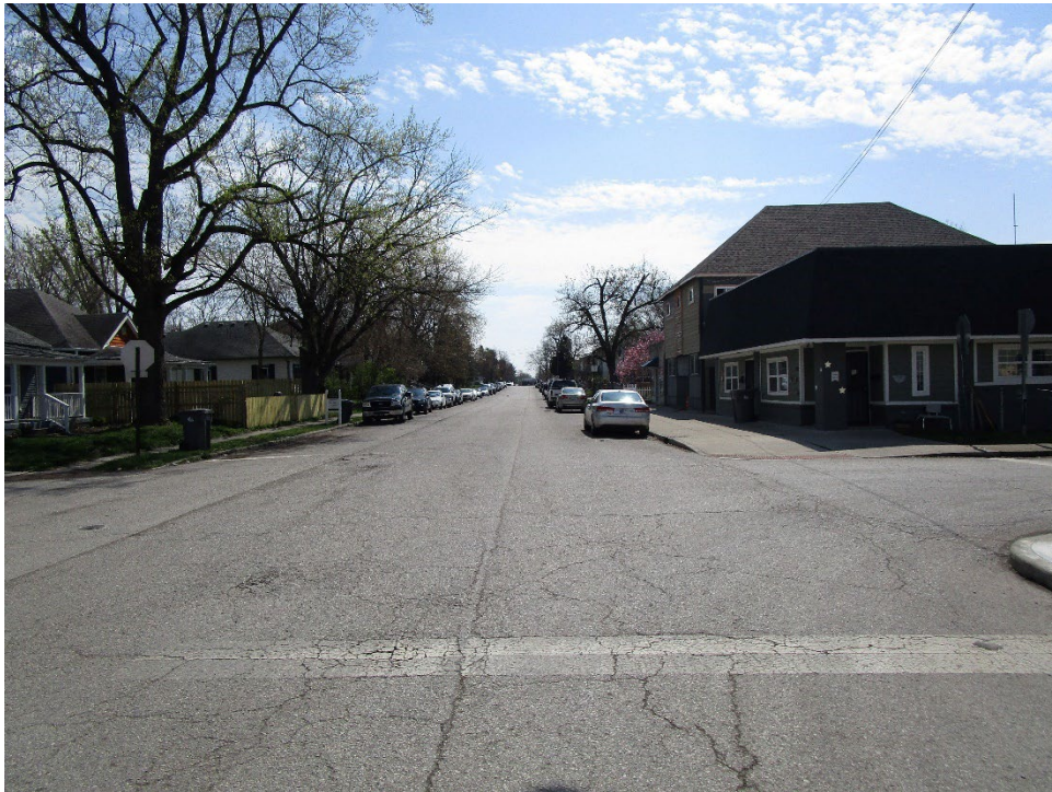
View looking south along North Olney Street