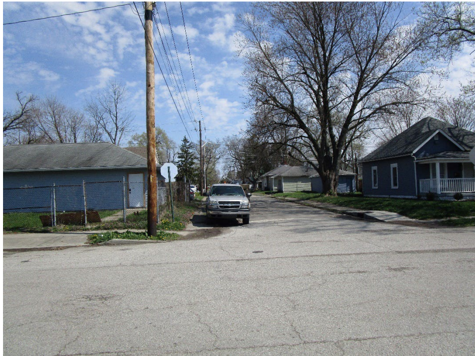
View looking east along Nowland Avenue