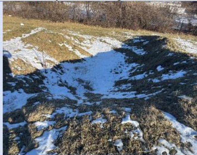
Subject property Vacant