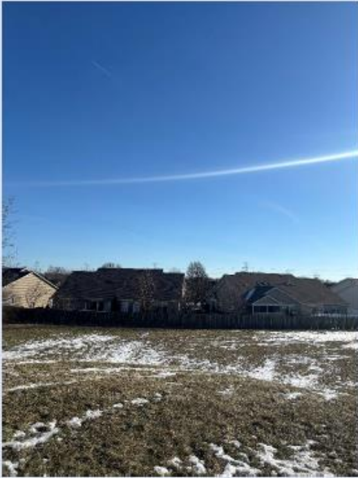
On Subject Site looking at Villas Sub