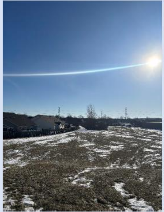
On Subject Site looking at Villas Sub