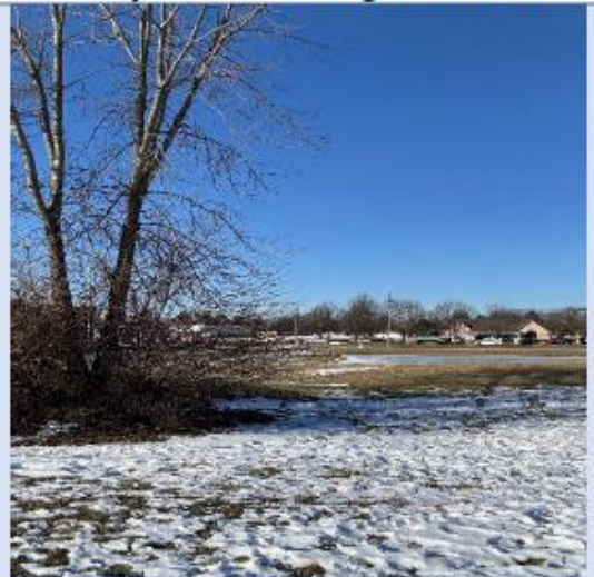
Looking towards commercial property