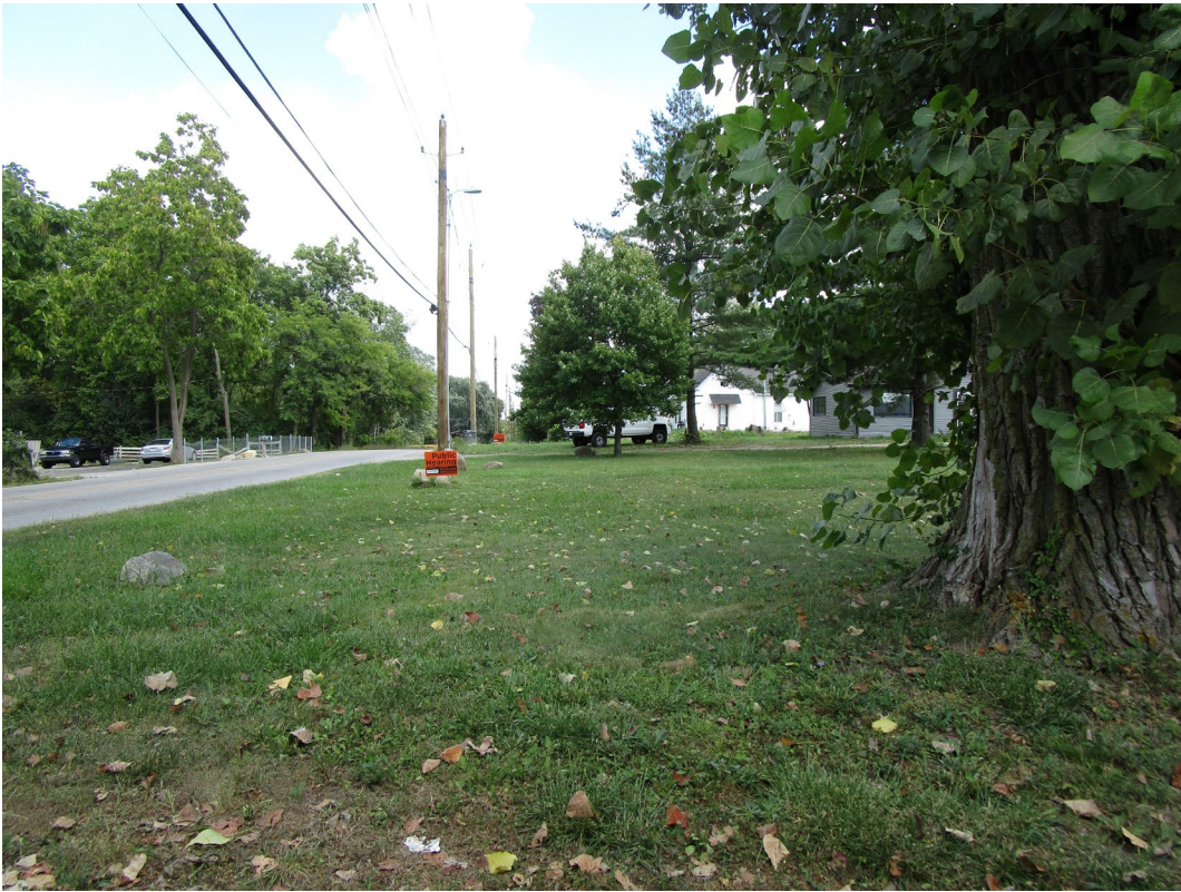
View looking east along East 34 th Street