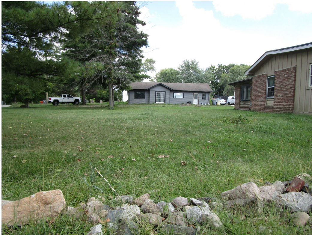
View from site looking east at adjacent single-family dwellings