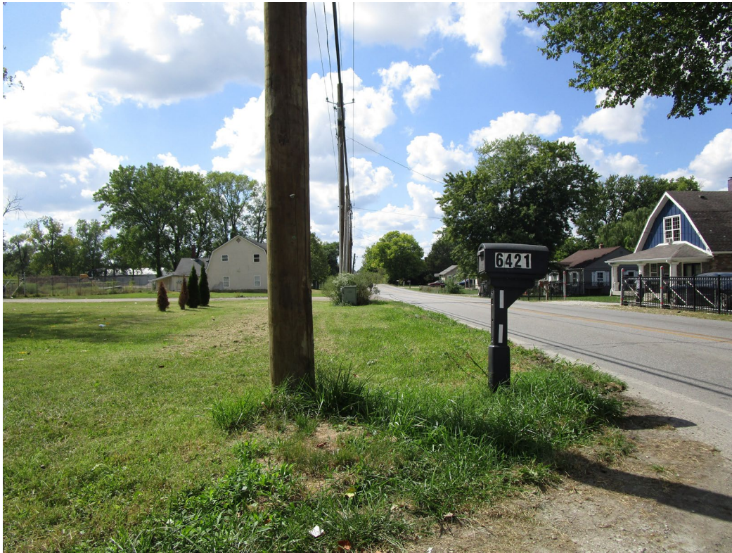
View looking west along East 34 th Street