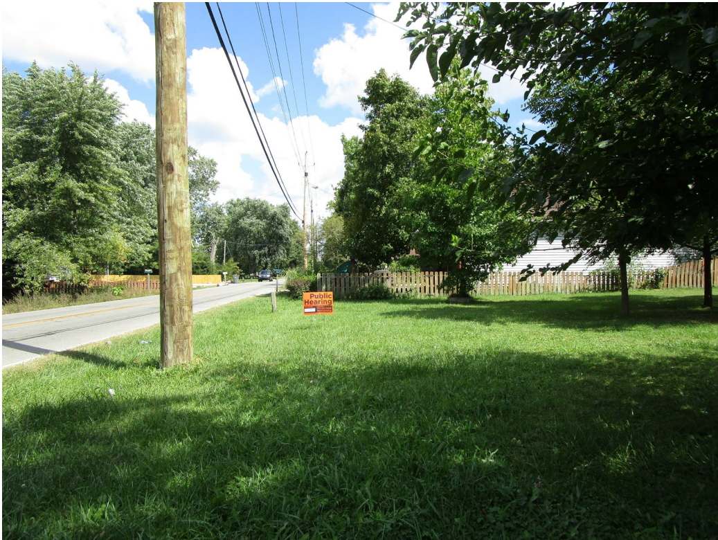
View looking east along East 34 th Street