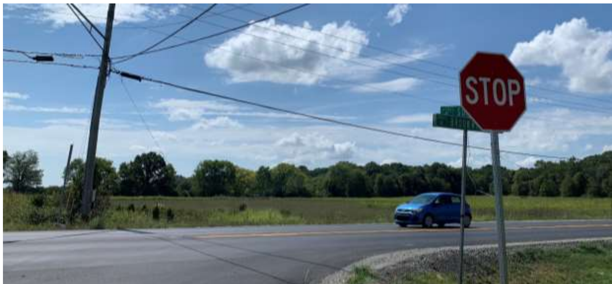
Subject site viewed from intersection of Brookville Road and Sorrel Street, looking south