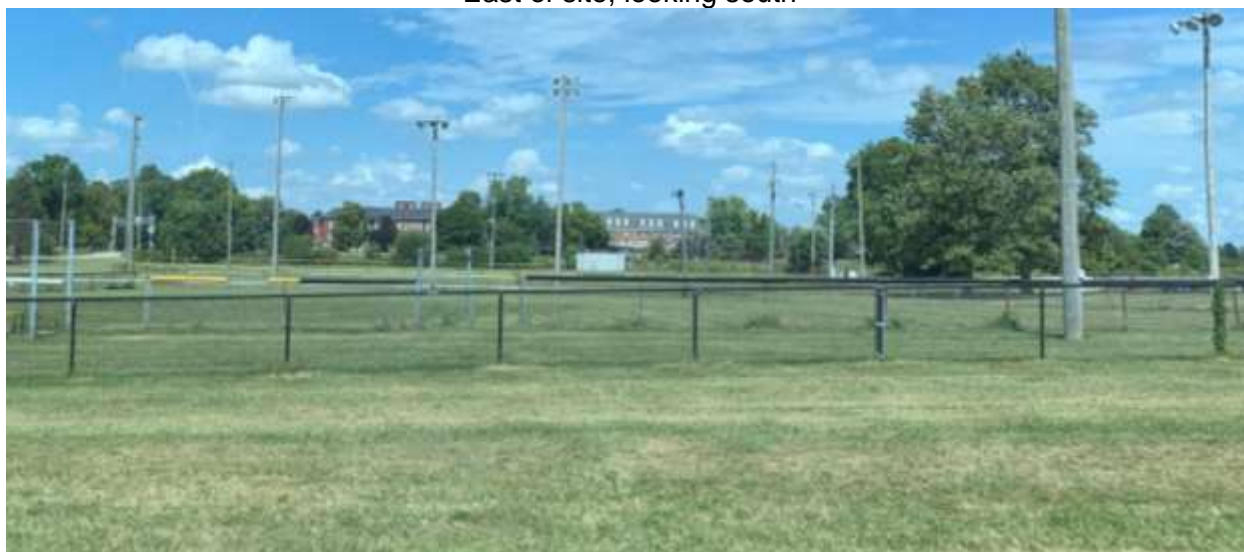
North of site- baseball fields and community center