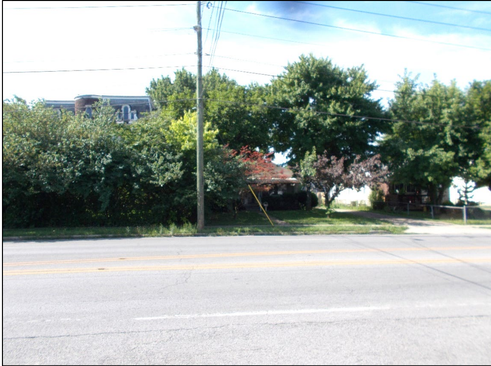
Looking south across English Avenue from the site.