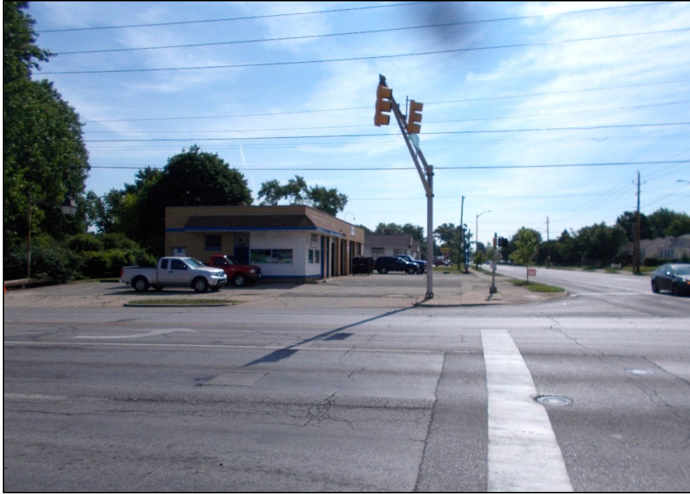
Looking east across Emerson Avenue at the neighbors to the east.