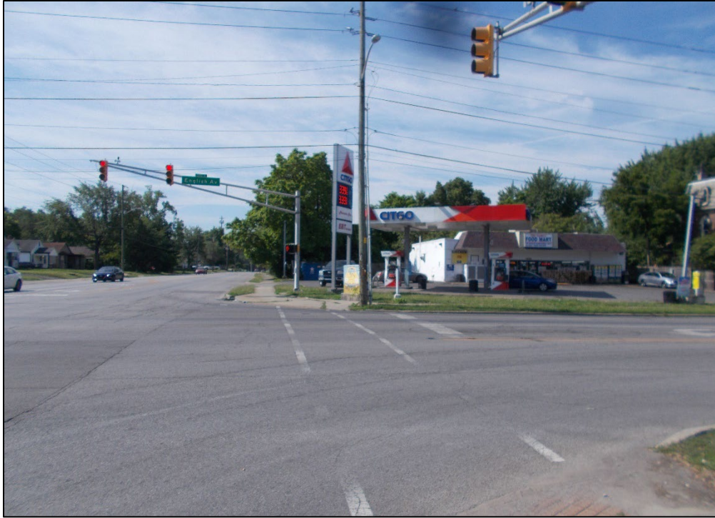
Looking south along Emerson Avenue from the subject site.