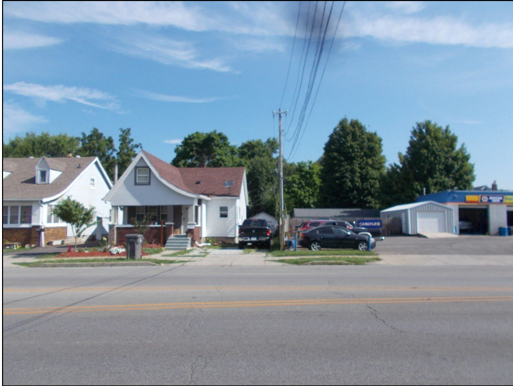
Looking north across English Avenue at the site and the neighbors to the west.