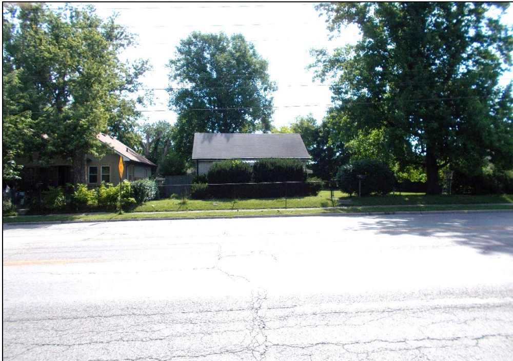
Looking east across Emerson Avenue at the neighbor to the east.