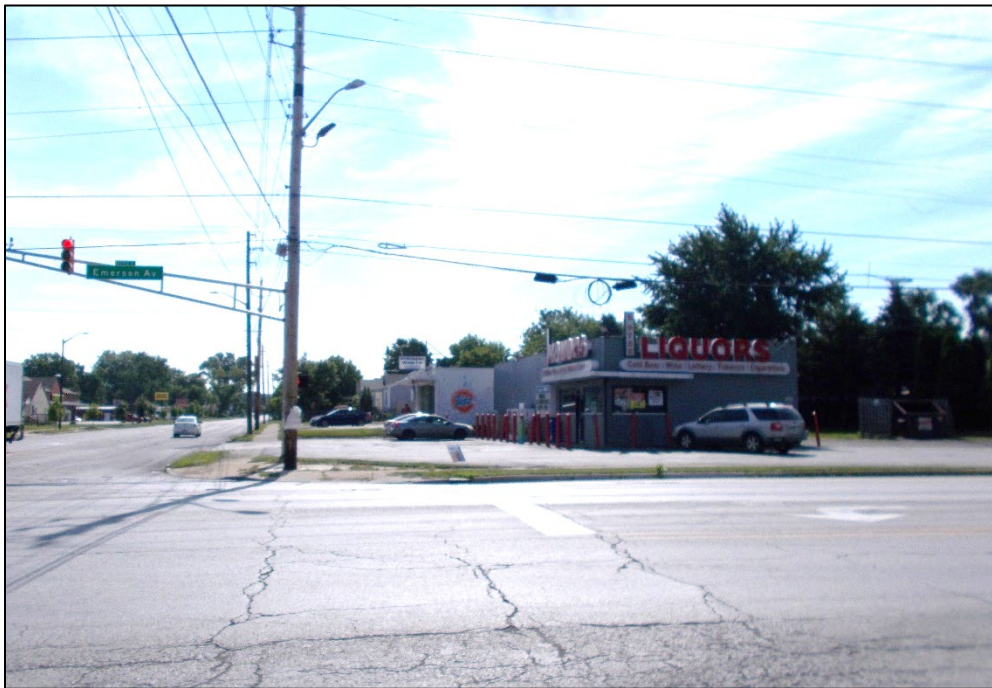
Looking east across Emerson Avenue at the neighbors to the southeast.