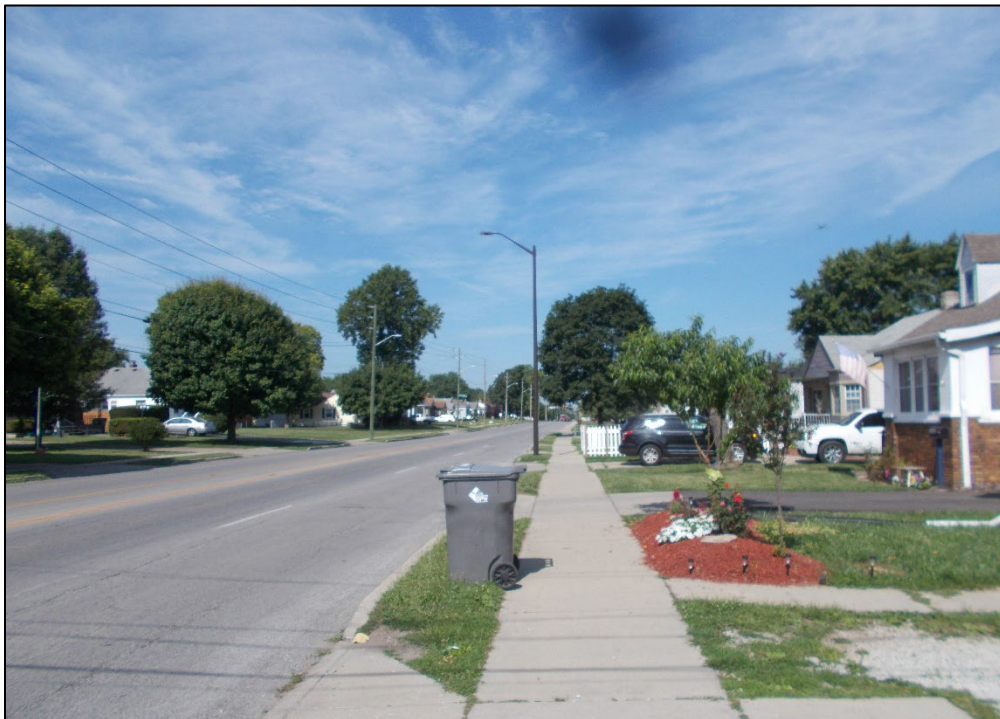
Looking west English Avenue.