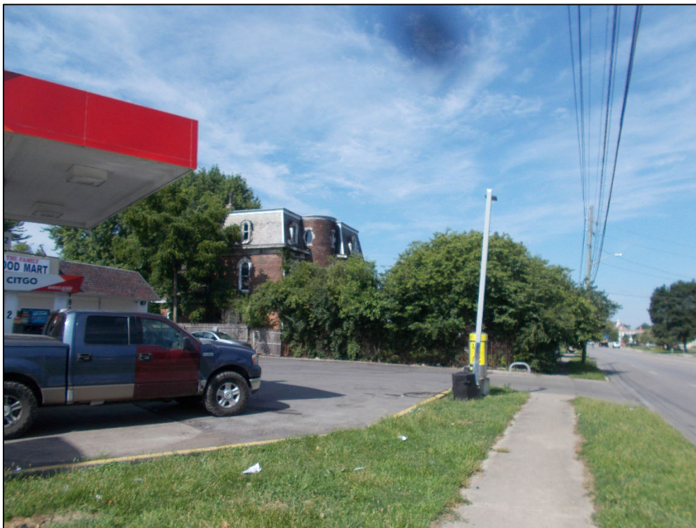
Looking west along English Avenue at the neighbors to the south.