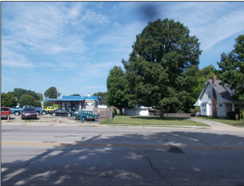
Looking west across Emerson Avenue at the site and the neighbor to the north.