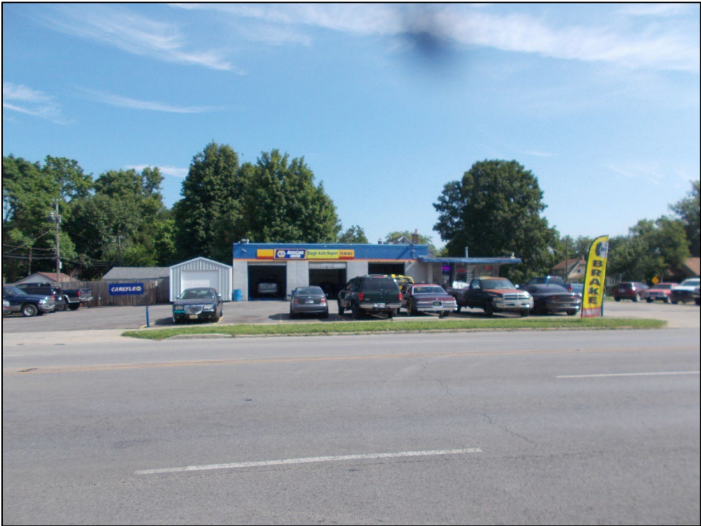
Looking north across English Avenue at the site.