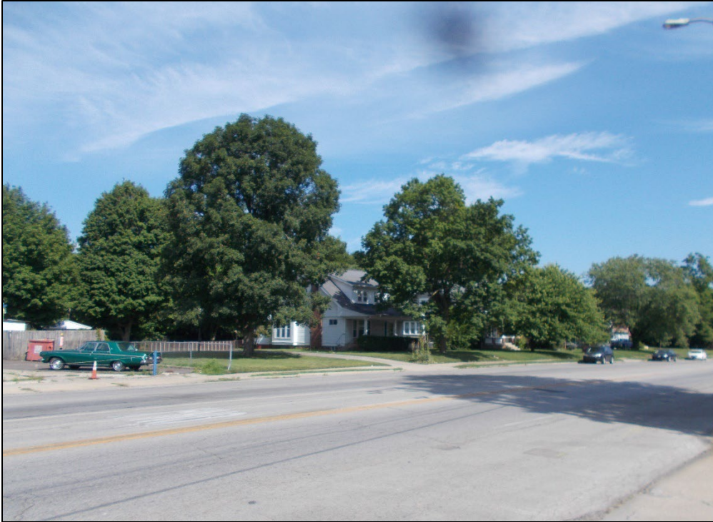
Looking northwest across Emerson Avenue at the neighbors to the north.