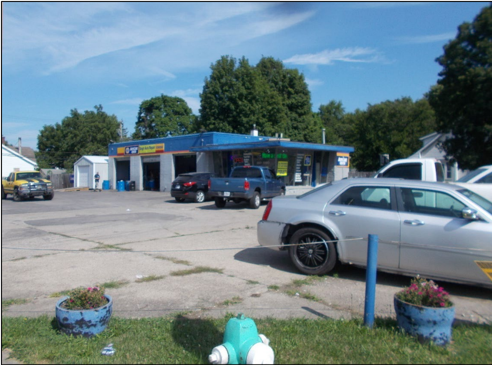
Looking northwest at the subject site from the intersection of Emerson & English avenues.