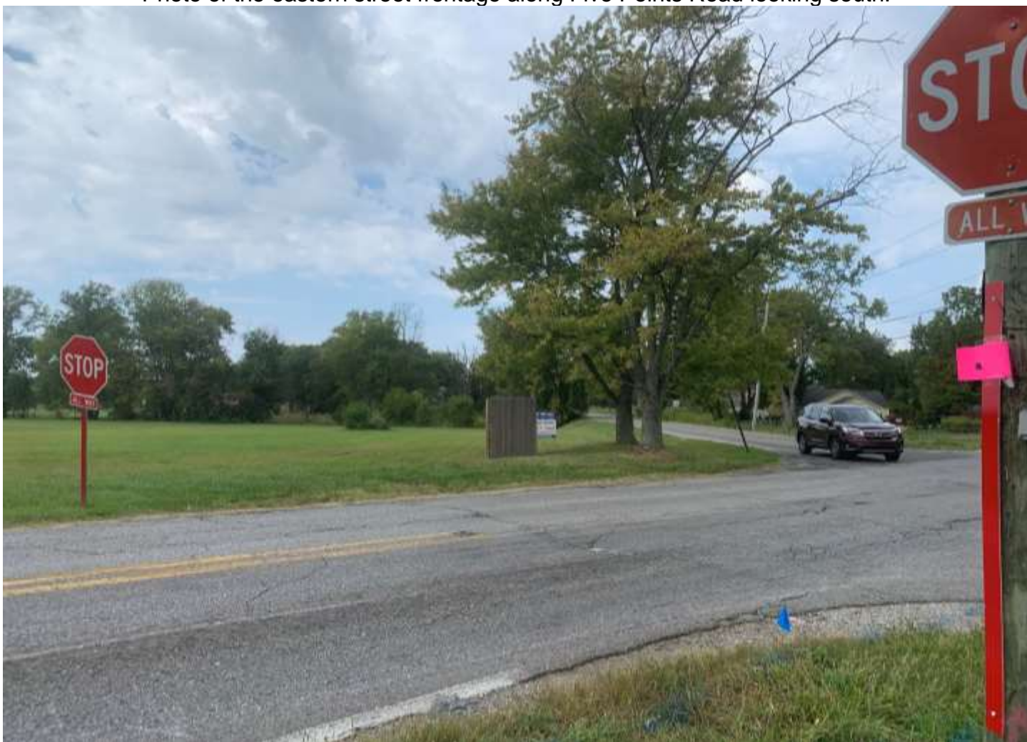
Photo of the subject site at the intersection.