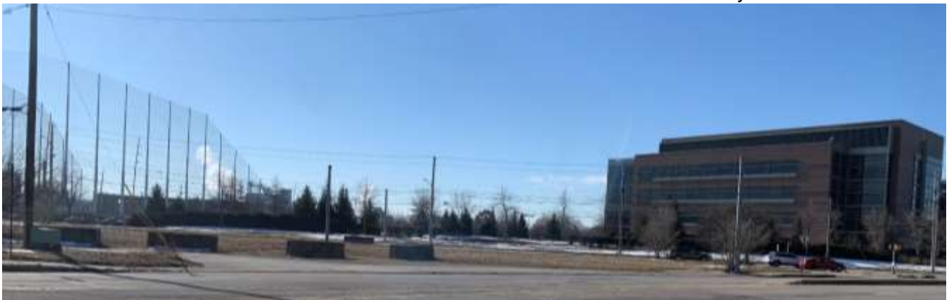
Photo of the undeveloped lot southeast of the site.