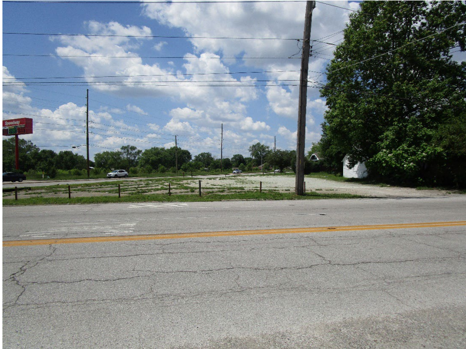
View from site looking west across South Arlington Avenue