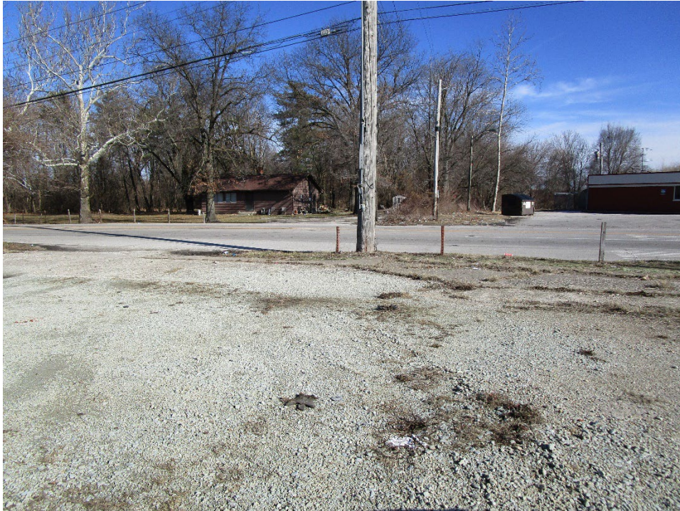
View of site looking northeast across South Arlington Avenue