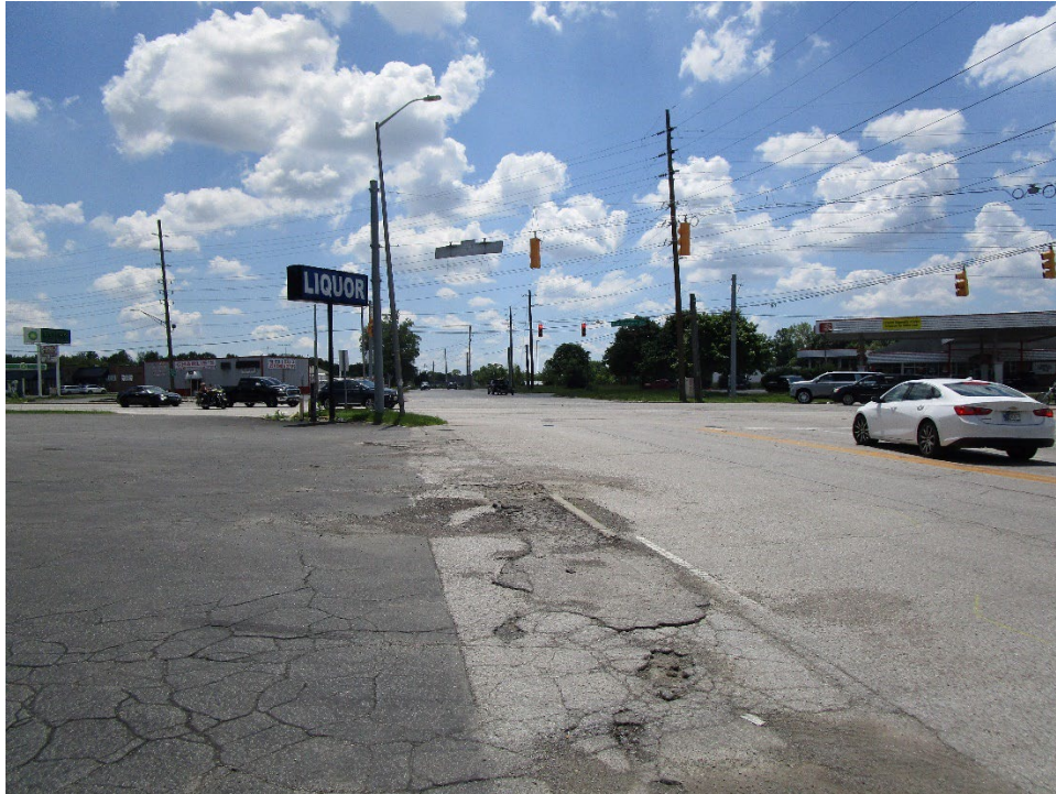
View looking south along South Arlington Avenue