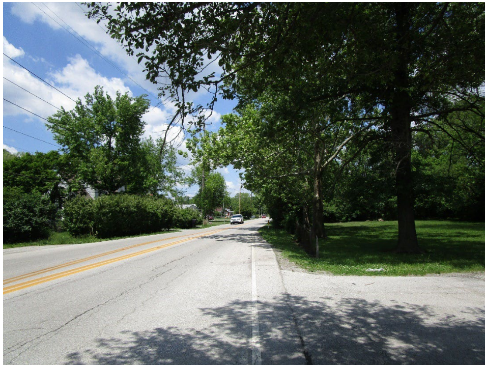
View looking north along South Arlington Avenue