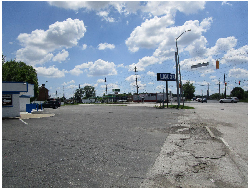
View from site looking south at adjacent property