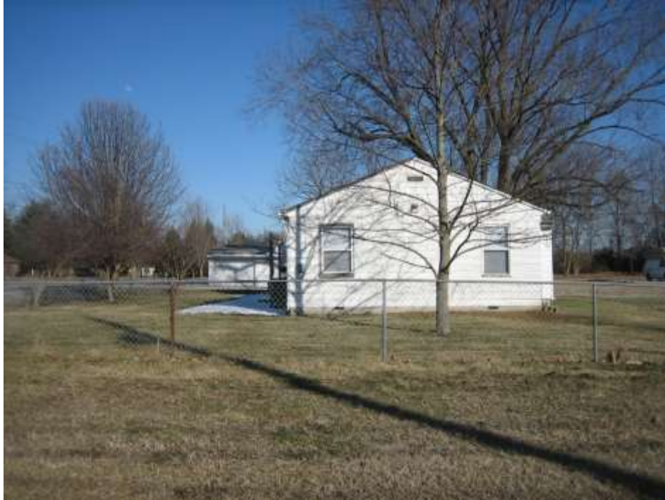
Photo of the Subject Property existign single-family dwelling, looking east