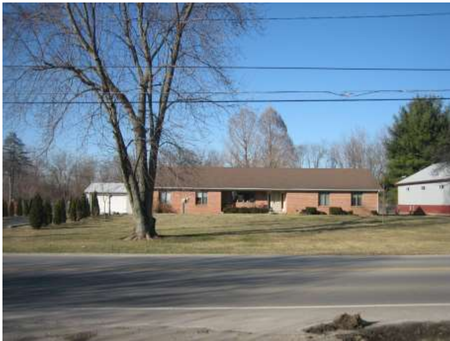
Photo of adjacent single-family dwelling to the north.