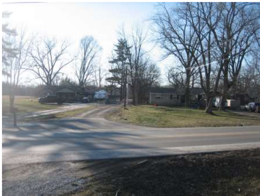
Photo of adjacent single-family dwelling to the west.