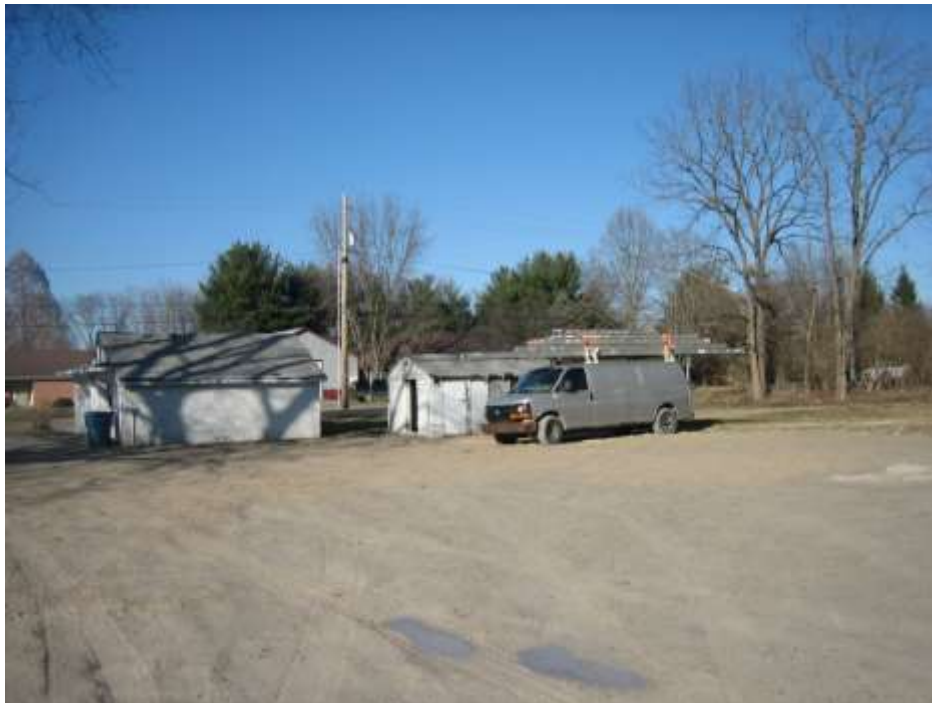
Photo of the existing garage and proposed parking for truck vehicles on gravel. Looking northeast.