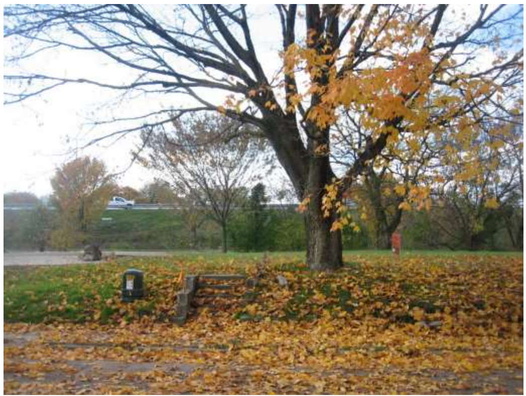
Undeveloped subject site, looking west.