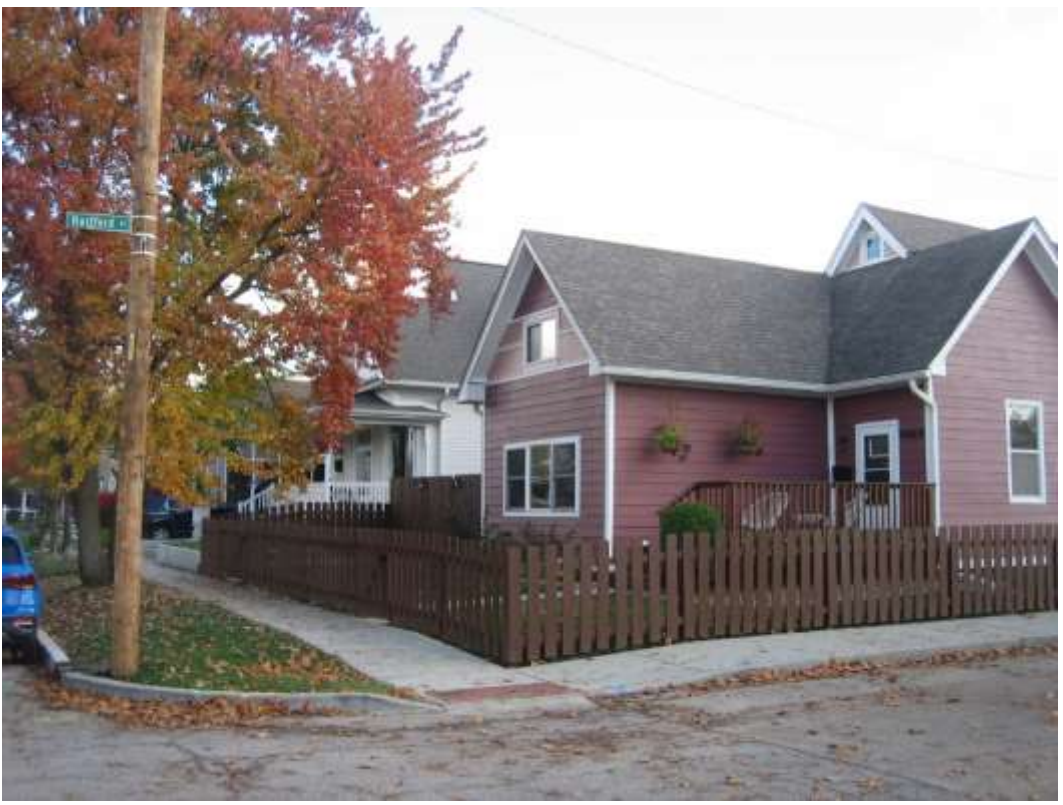
Adjacent single-family dwelling to the east of subject site.