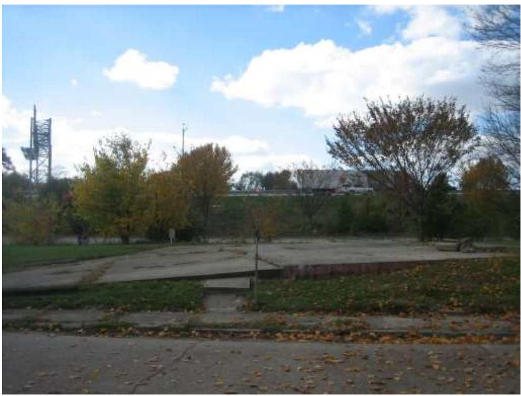
Adjacent undeveloped lot to the south of subject site, looking west.