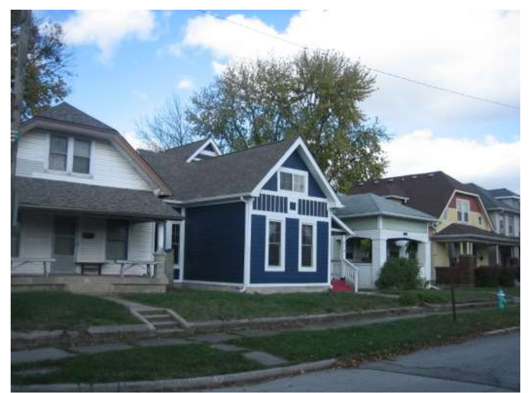
Adjacent single-family dwellings to the north of subject site, looking northeast.