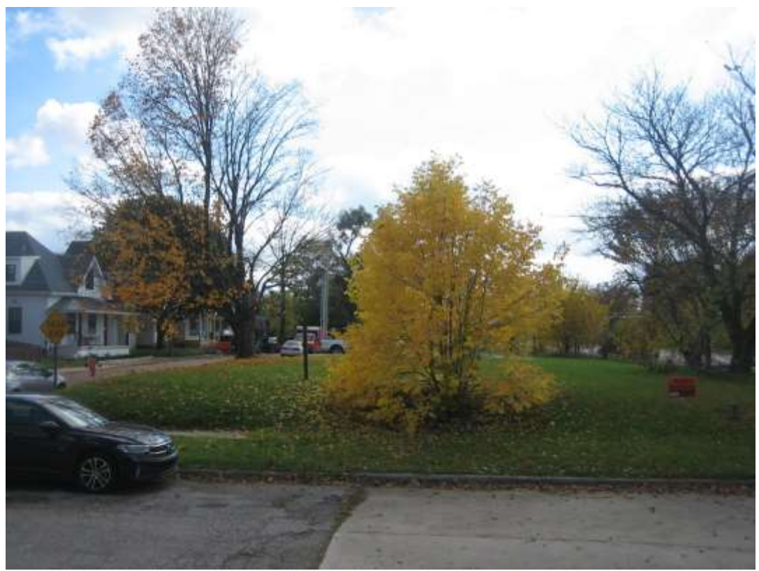
Undeveloped subject site, looking south.