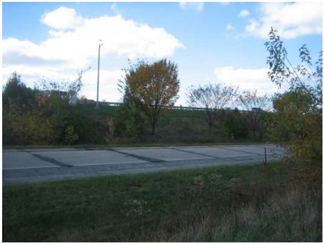
Interstate I-65 northbound exit ramp to the west of subject site.