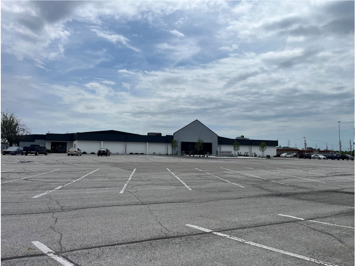
Photo 2: View of the bowling alley that currently occupies where Lot 1 will be