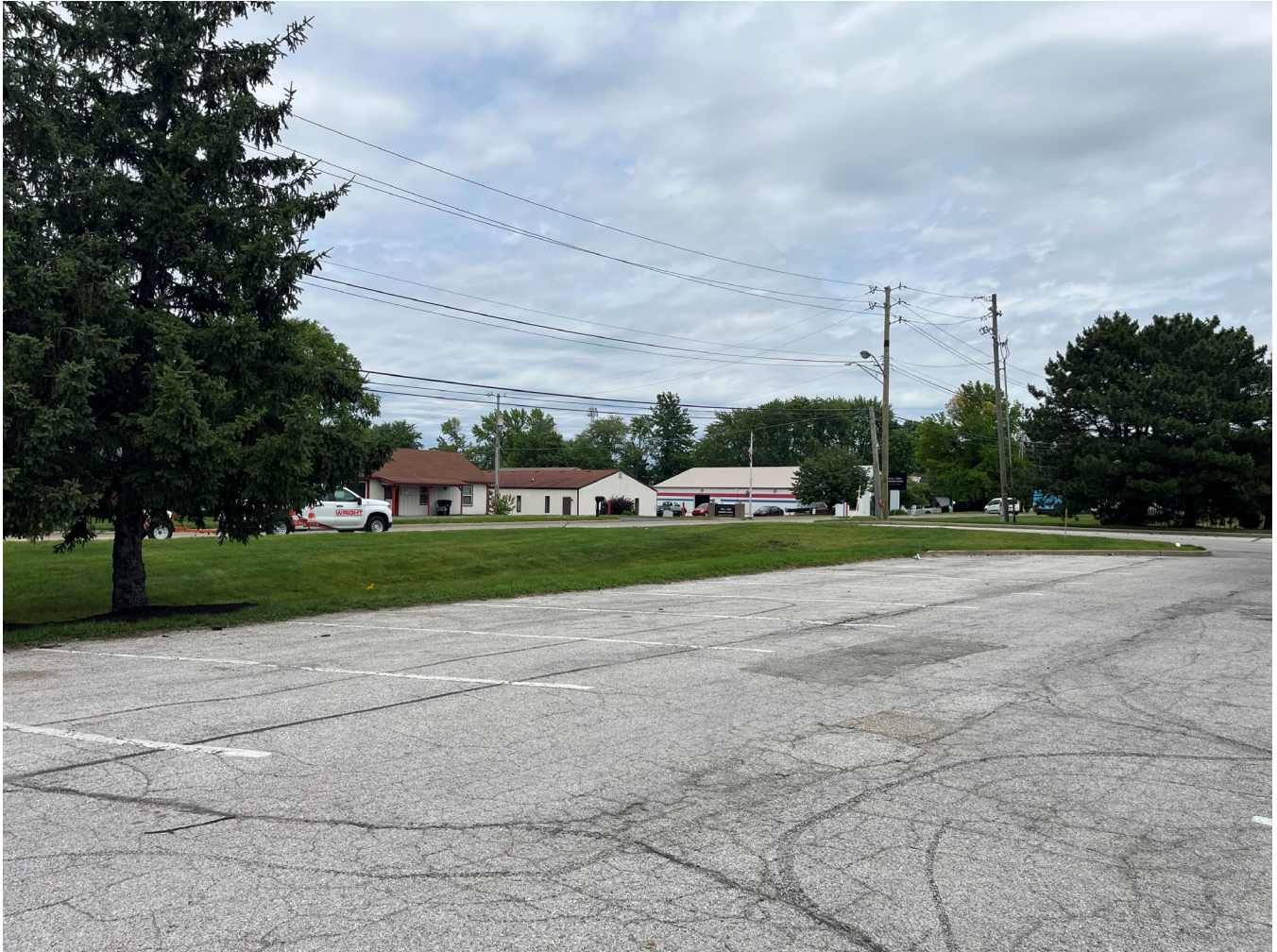
Photo 4: Surrounding properties across Elmwood Street looking east