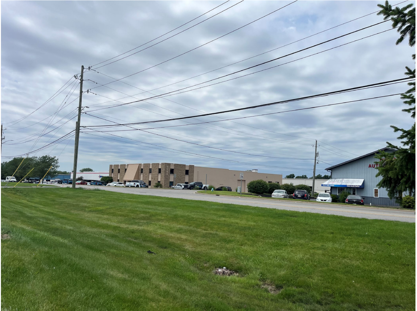
Photo 3: Surrounding properties across Elmwood Street looking west