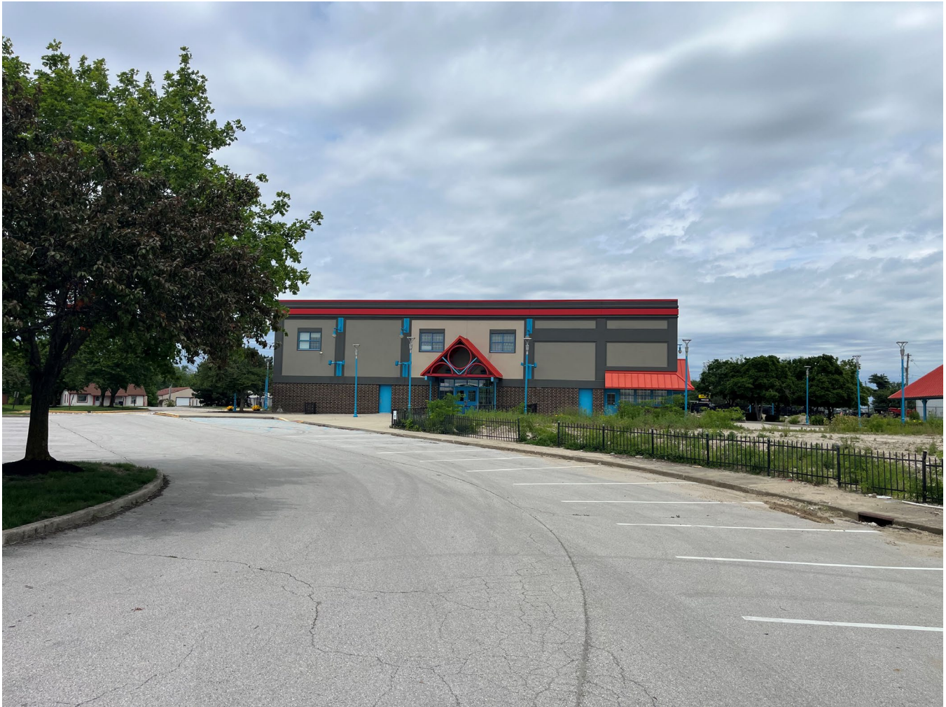
Photo 1: View of indoor theme park that currently occupies where Lot 2 will be