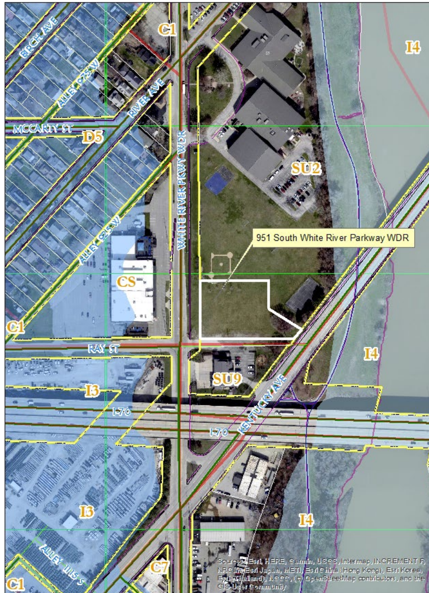
951 South White River Parkway WDR