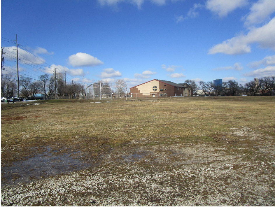
View from site looking north