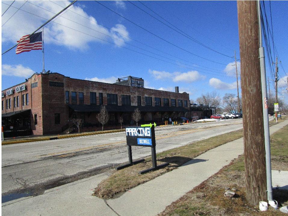
View from site looking northwest across South White River Parkway West Drive