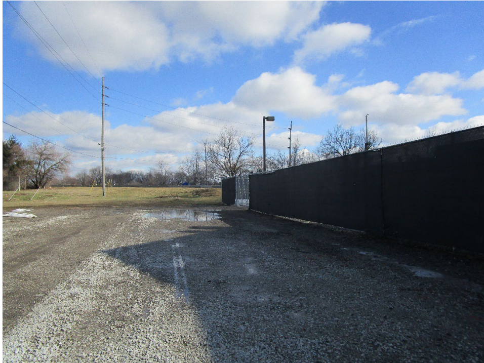
View from site looking east