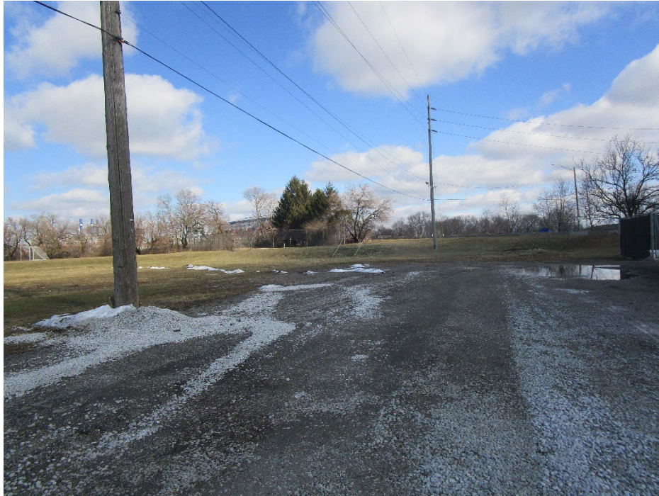
View from site looking east