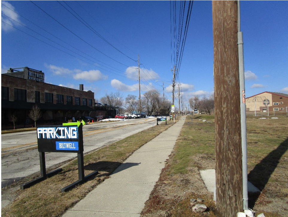
View looking north along South White River Parkway West Drive