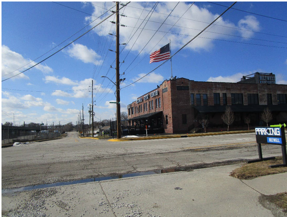
View from site looking west across South White River Parkway West Drive