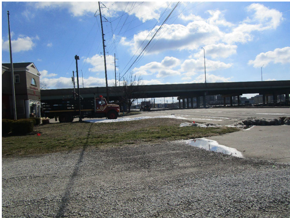
View looking south along South White River Parkway West Drive