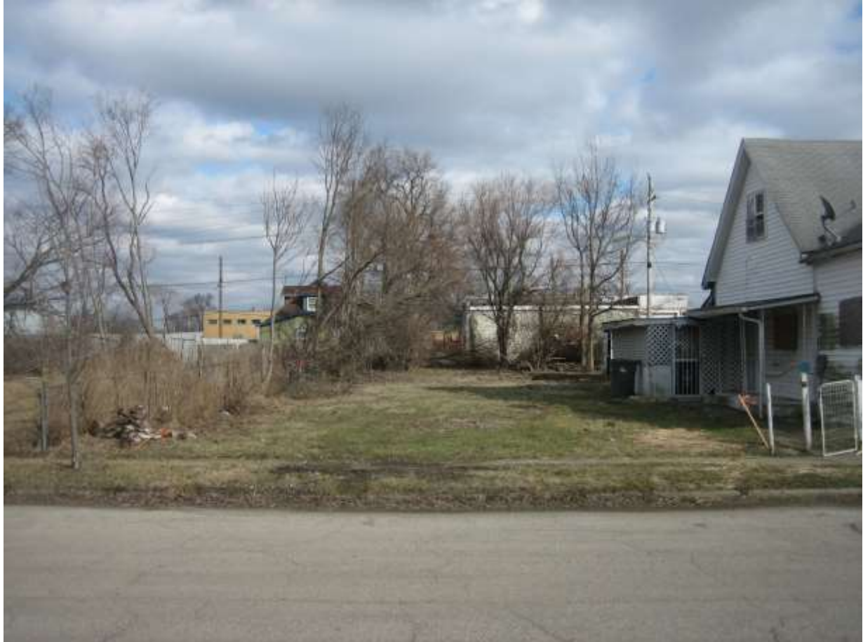
Photo of subject site, looking east from Columbia Avenue.