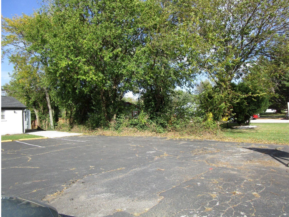
View of site looking northeast