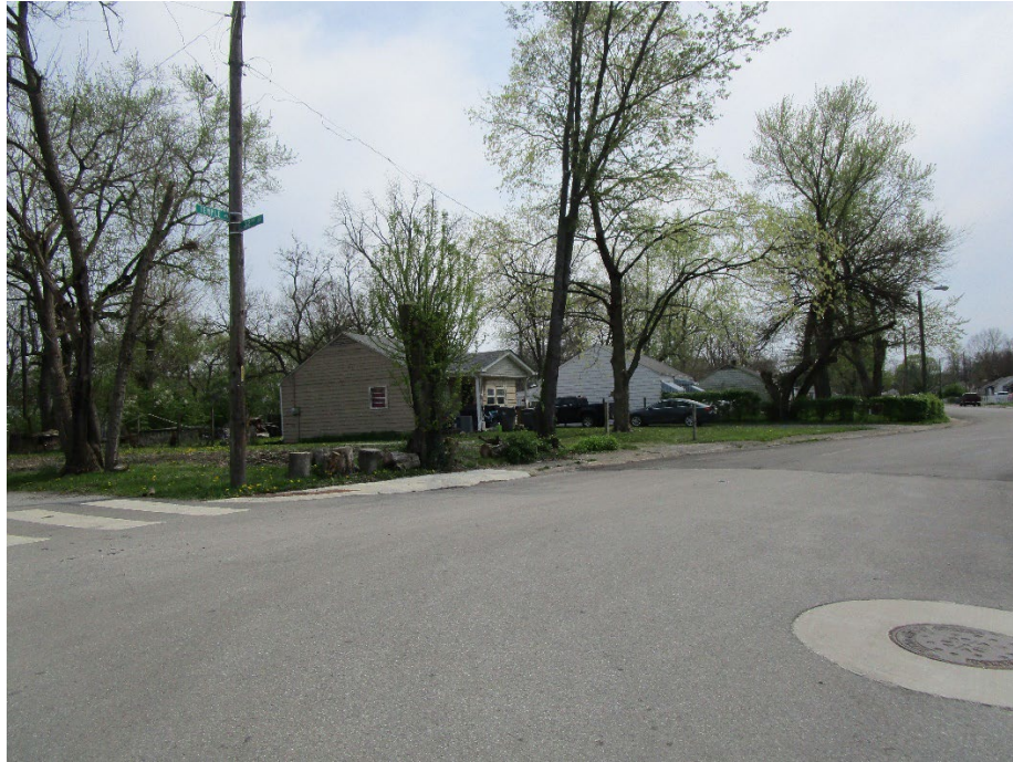
View of neighborhood looking southeast across North Temple Avenue