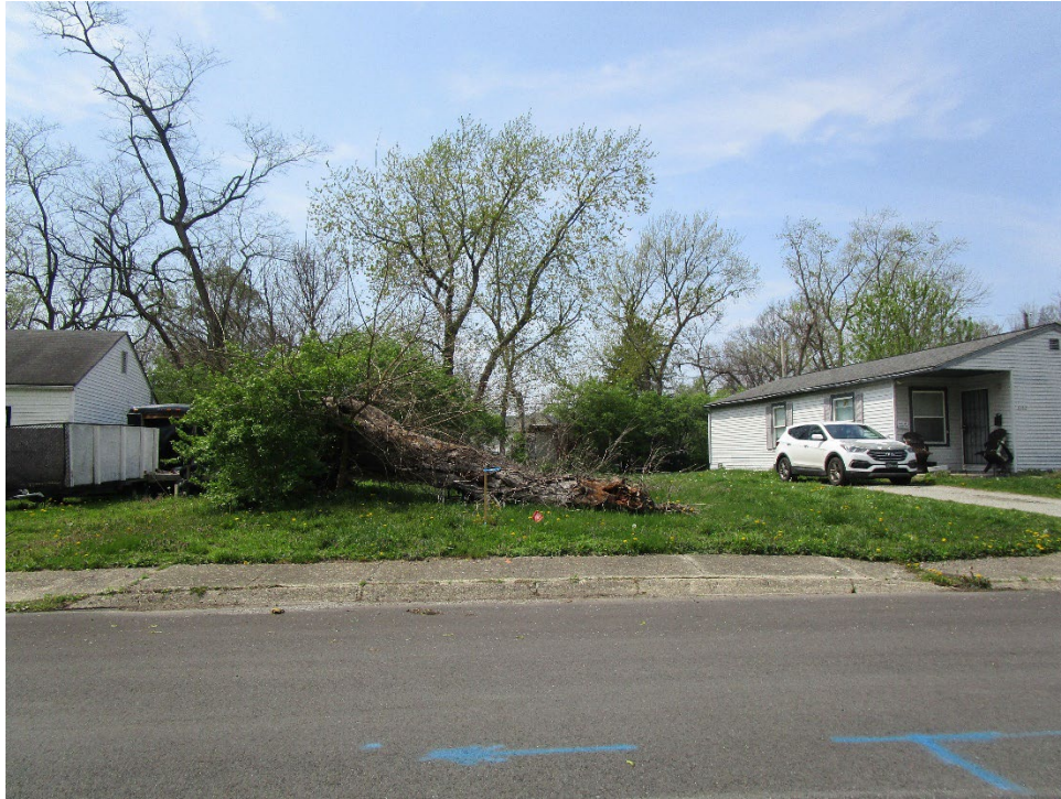
View of site looking west across North Temple Avenue