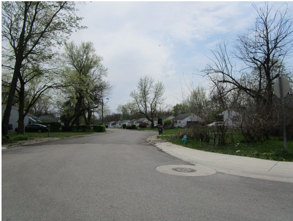
View looking south along North Temple Avenue