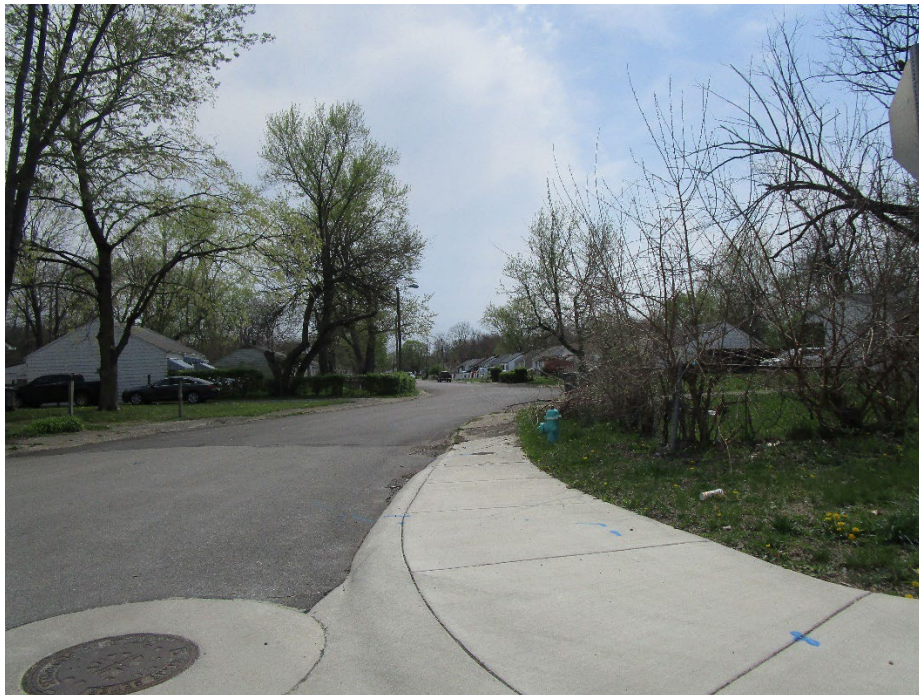
View looking south along North Temple Avenue