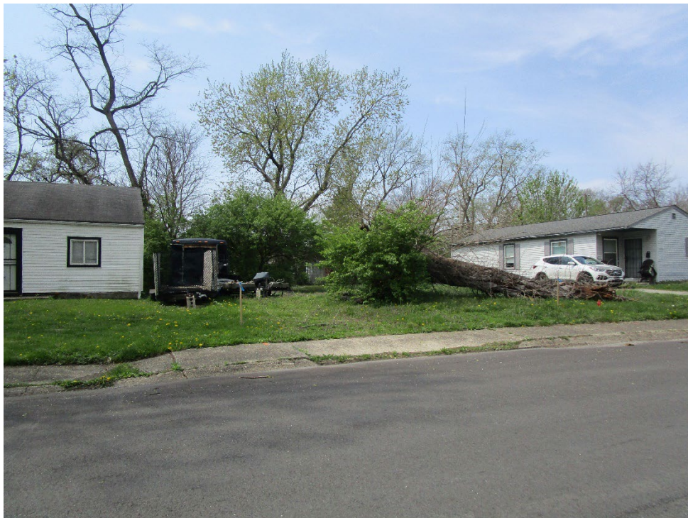
View of site looking northwest across North Temple Avenue