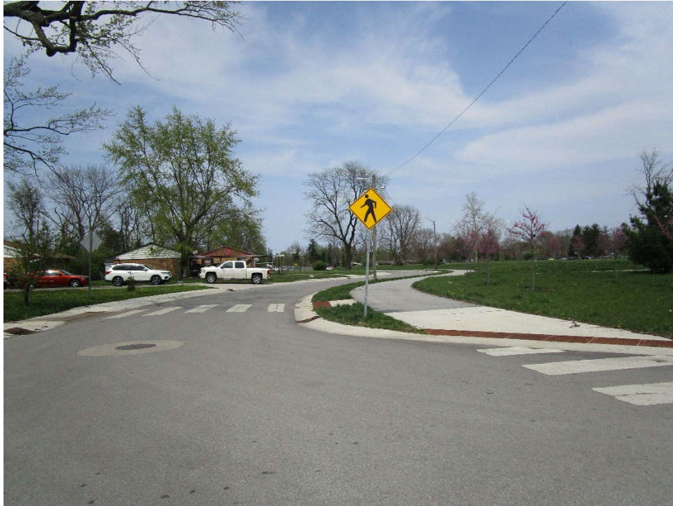
View looking north along North Temple Avenue