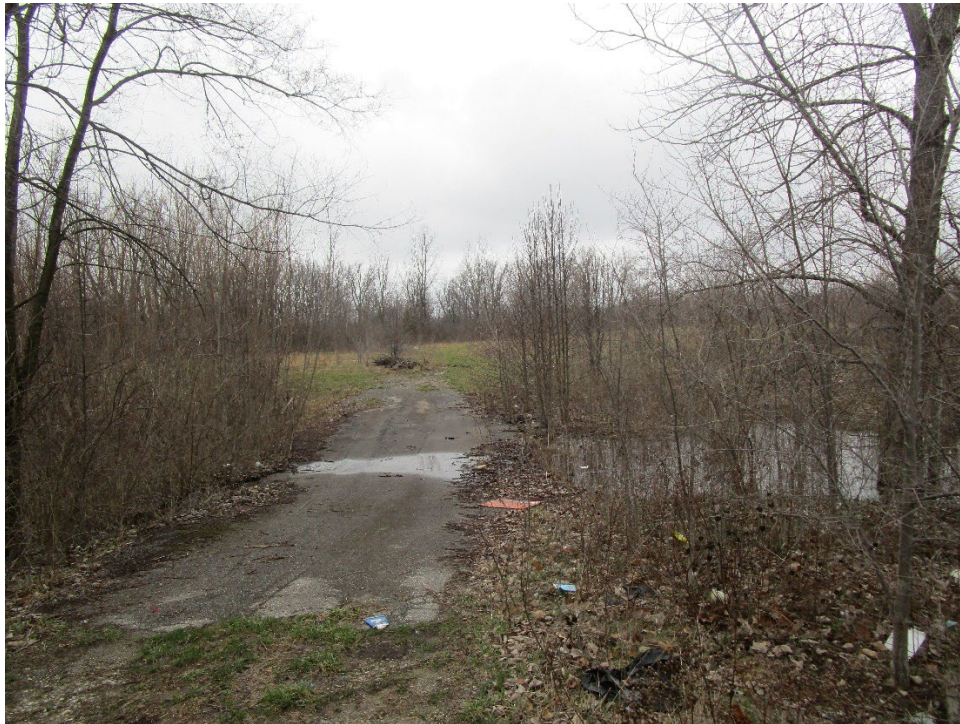
View of site looking north