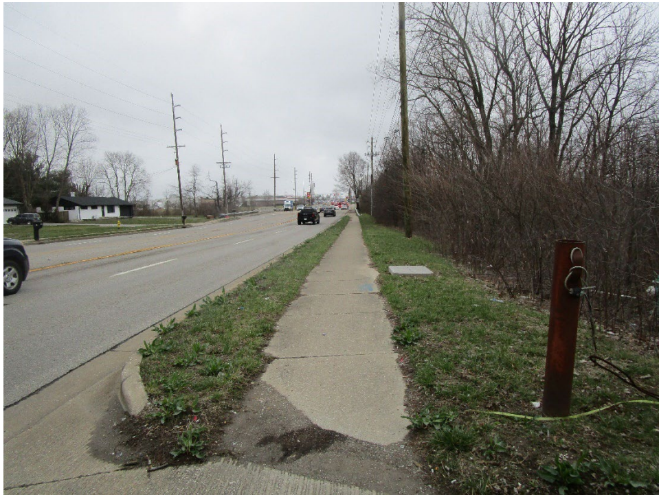
View looking west along East County Line Road