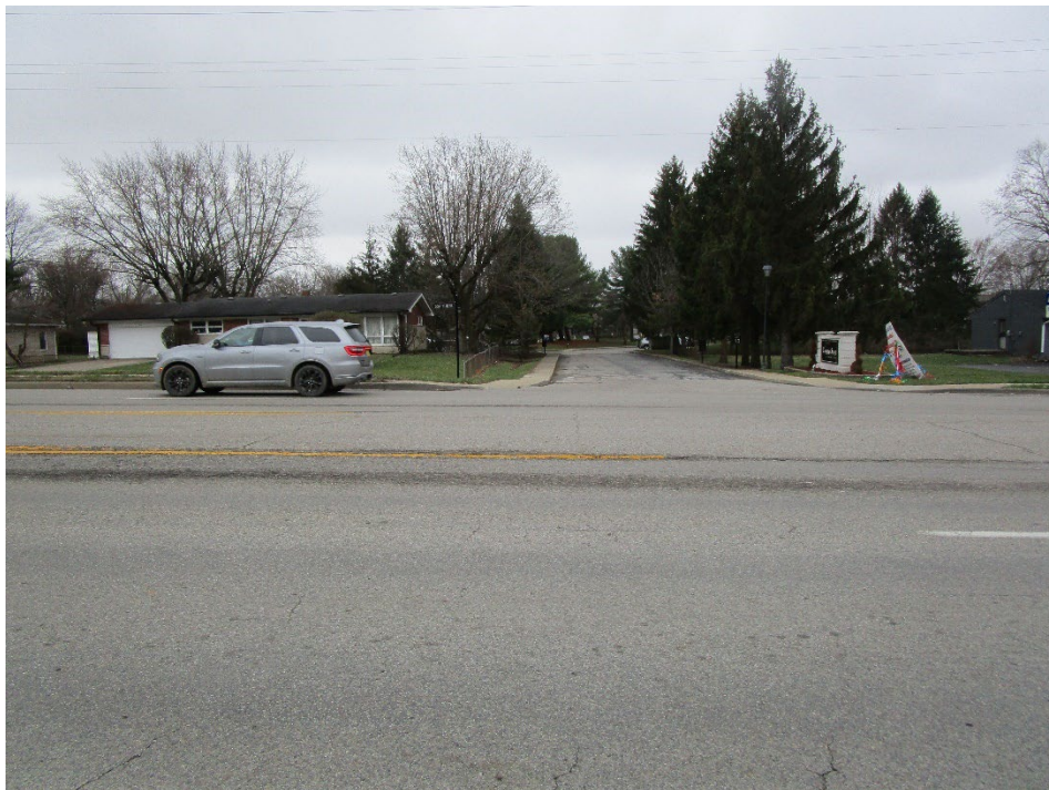
View looking south across East County Line Road