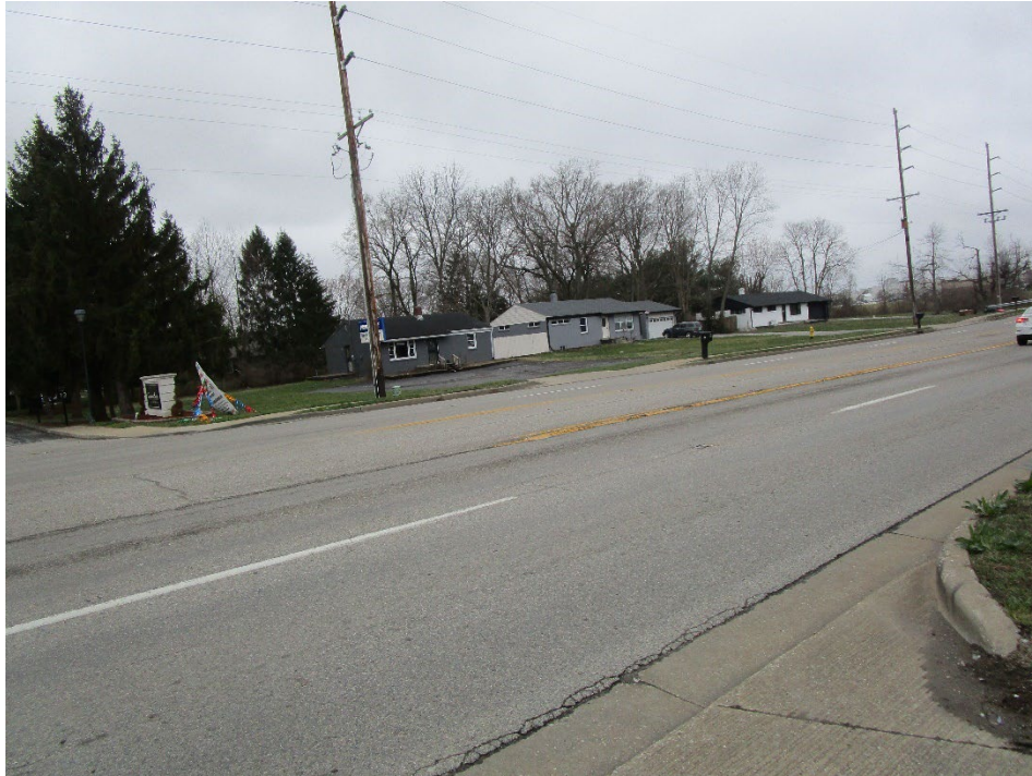
View from site looking southwest across East County Line Road