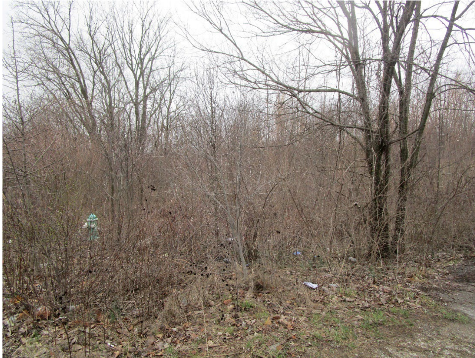
View of site looking northwest