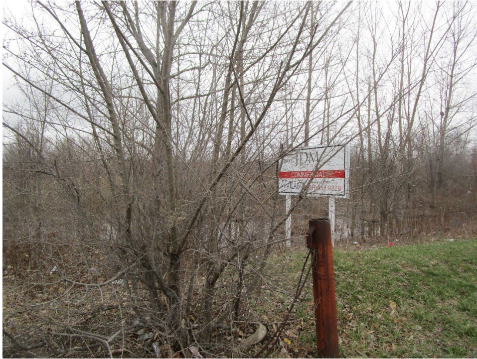
View of site looking north