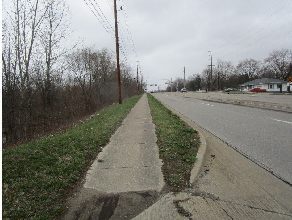
View looking east along East County Line Road