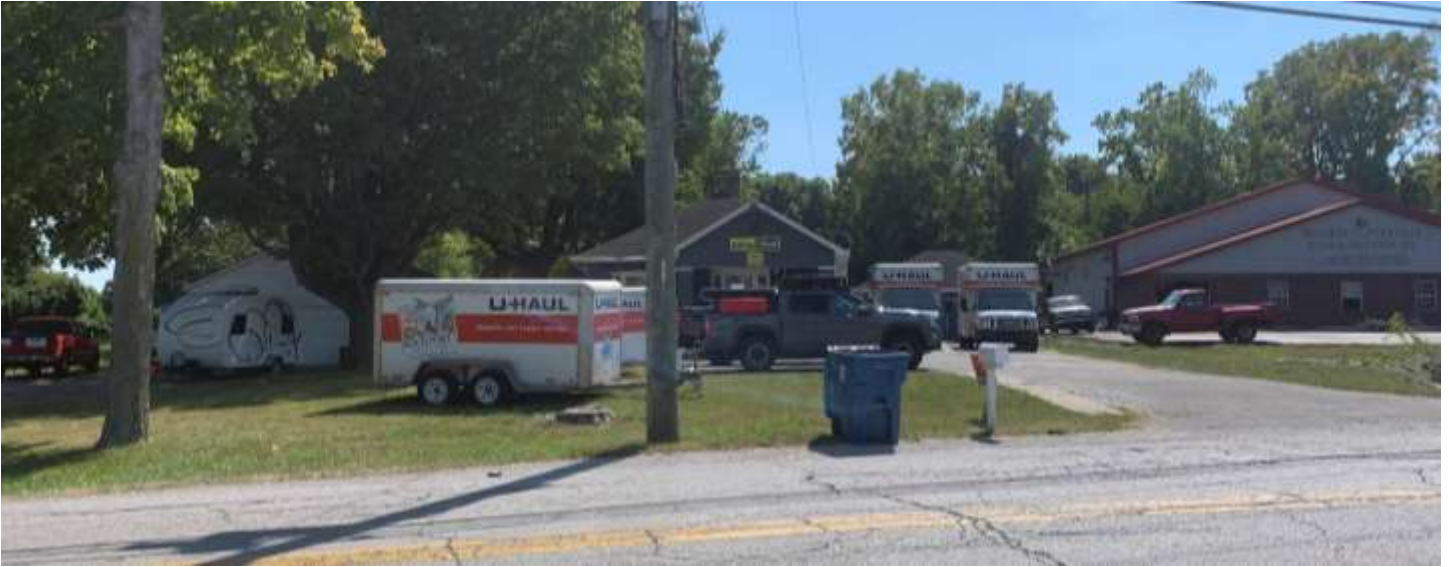
Photo looking south across Thompson Road at 6345 West Thompson Road.