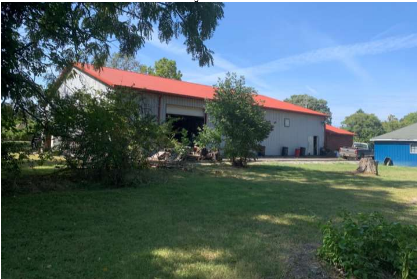
Photo looking west towards the adjacent property.