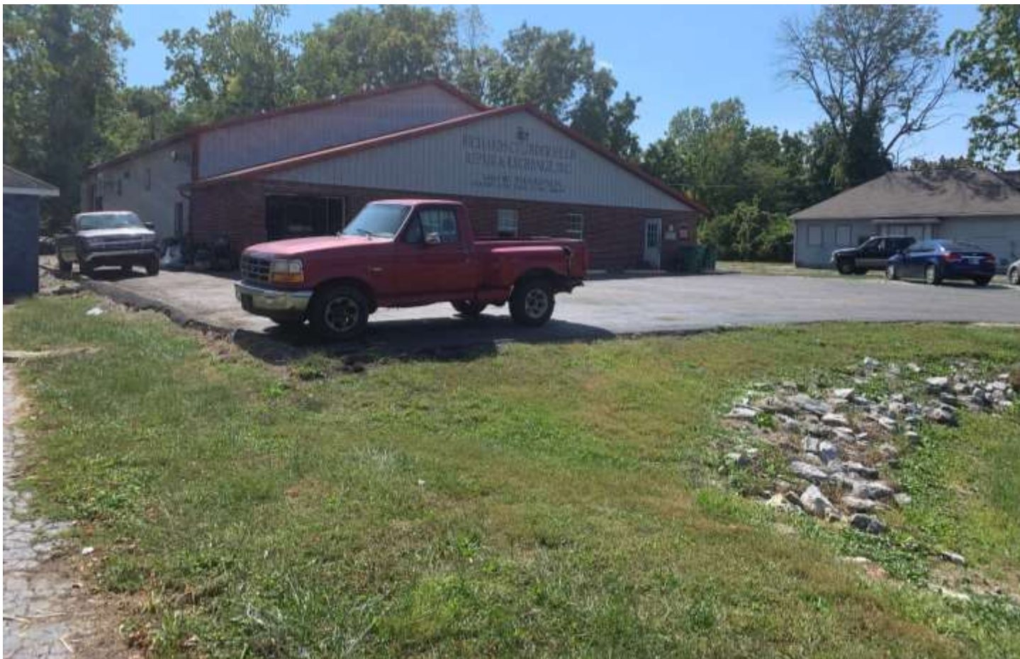
Photo of the commercial property west of the site.