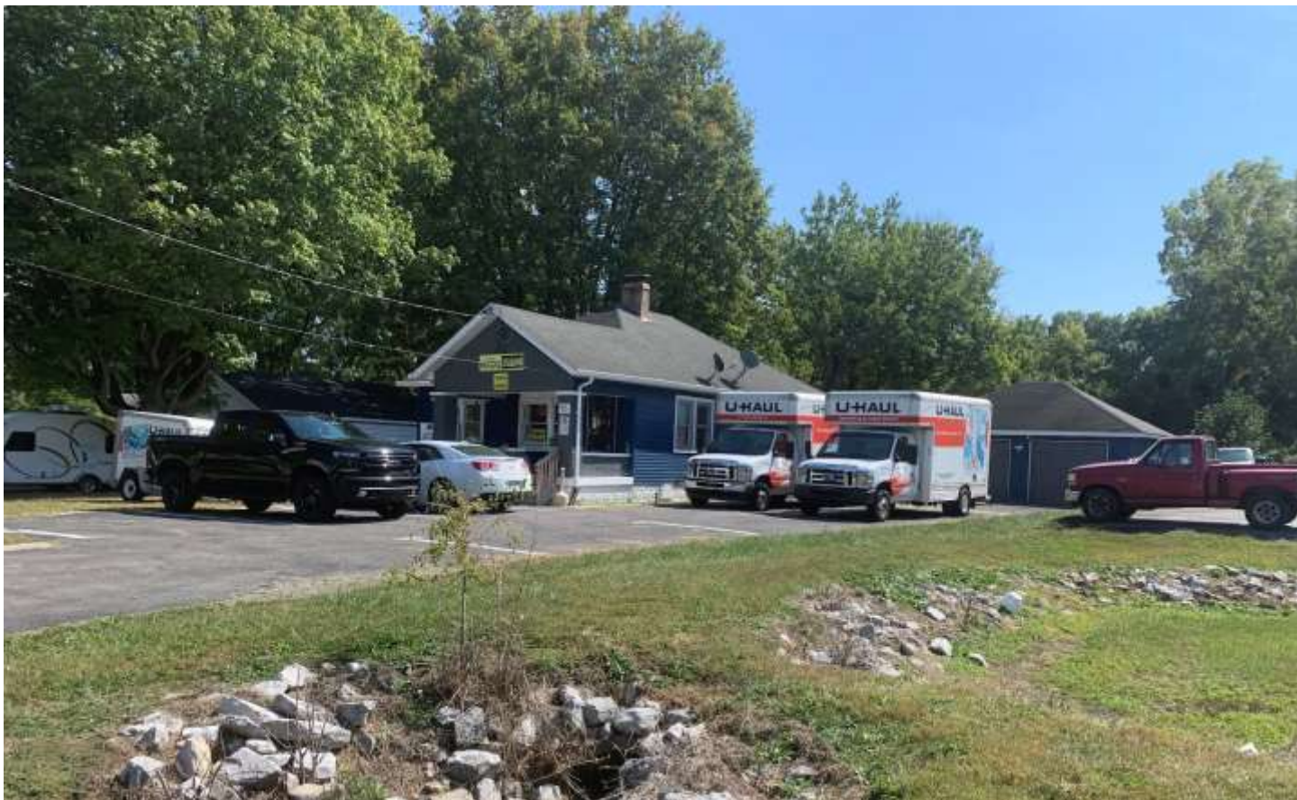
Photo of the outdoor storage of commercial vehicles on site.