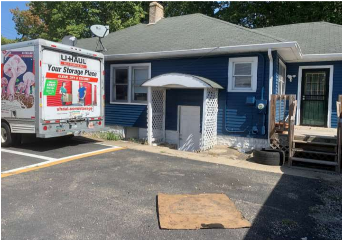
Photo of the western office façade.