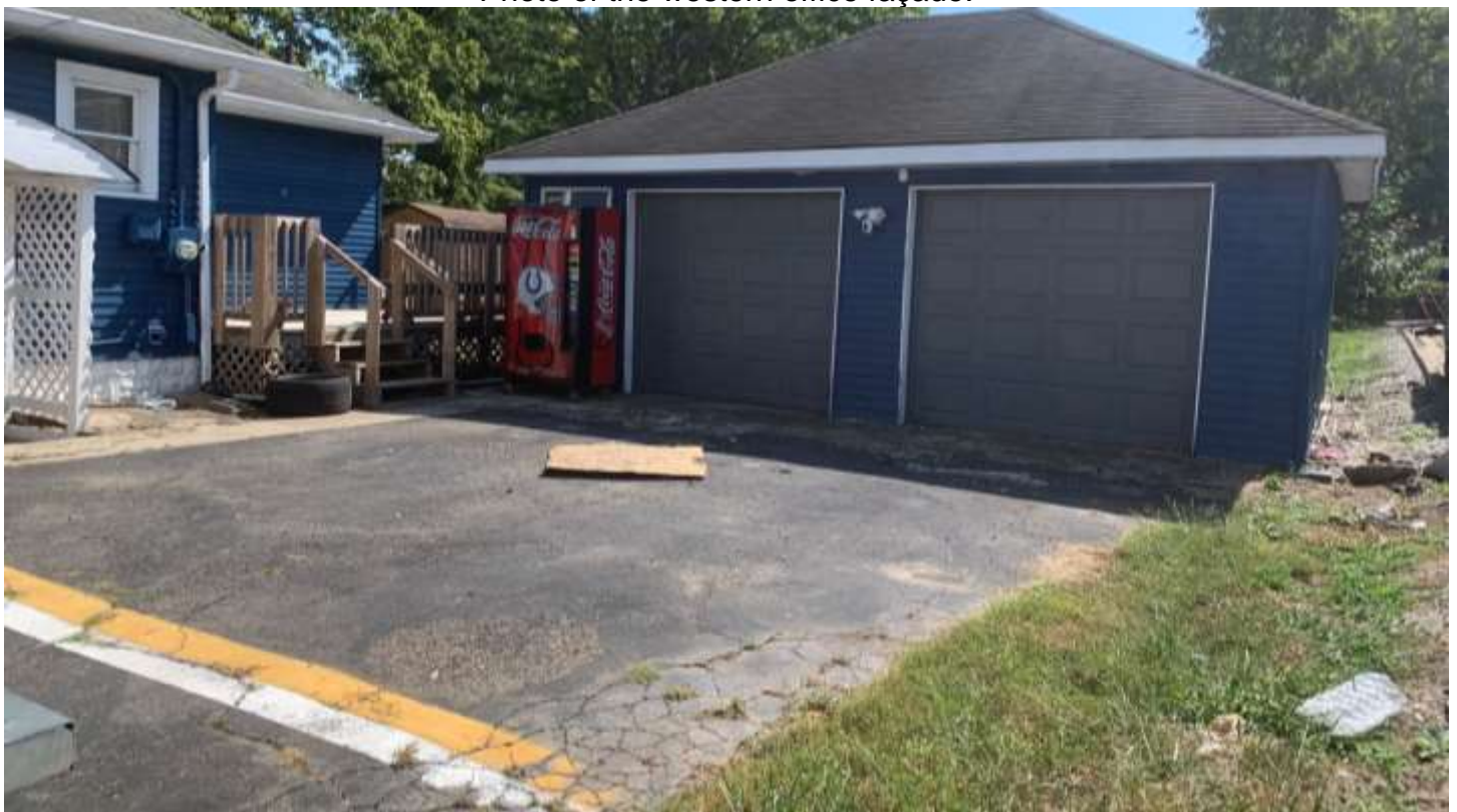
Photo of the existing garage on site.