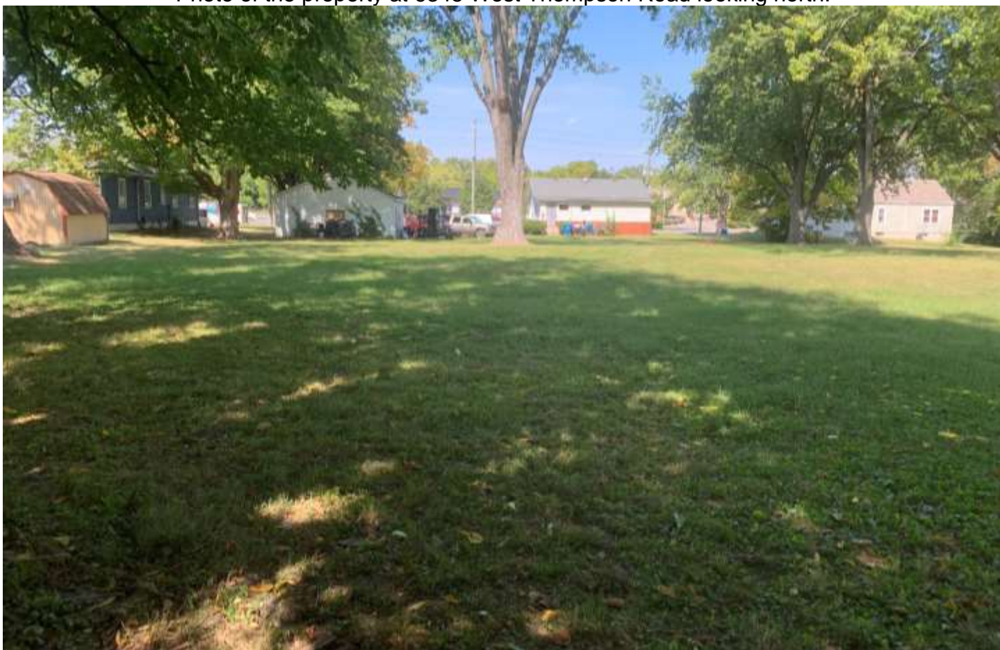
Photo of the property at 6333 West Thompson Road looking north.