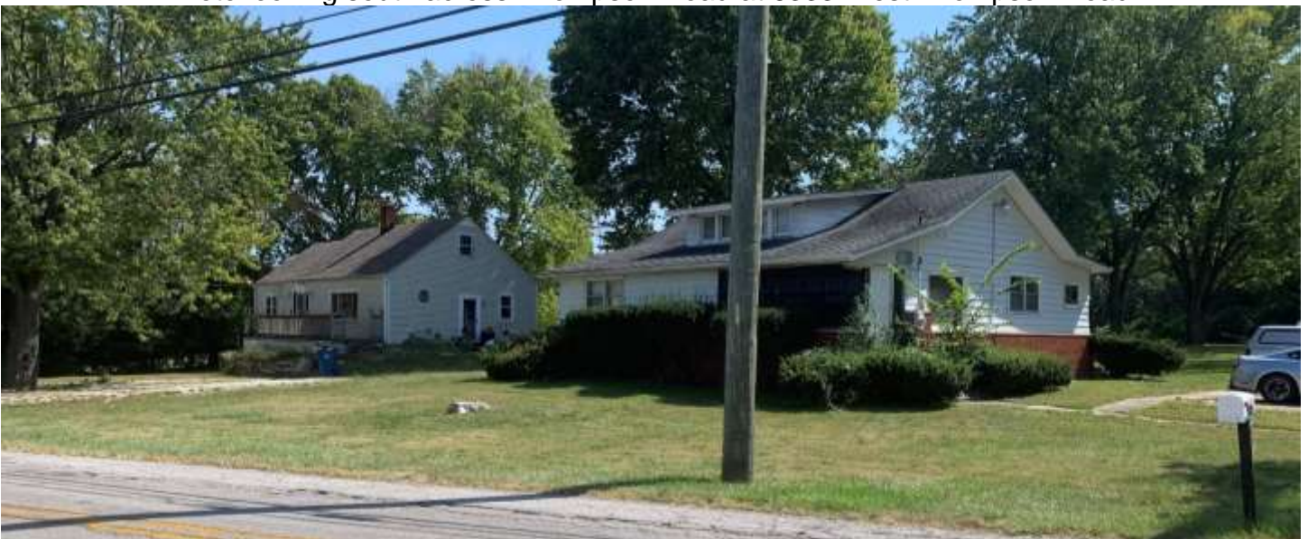
Photo looking south across Thompson Road to subject site and adjacent single-family dwelling east.