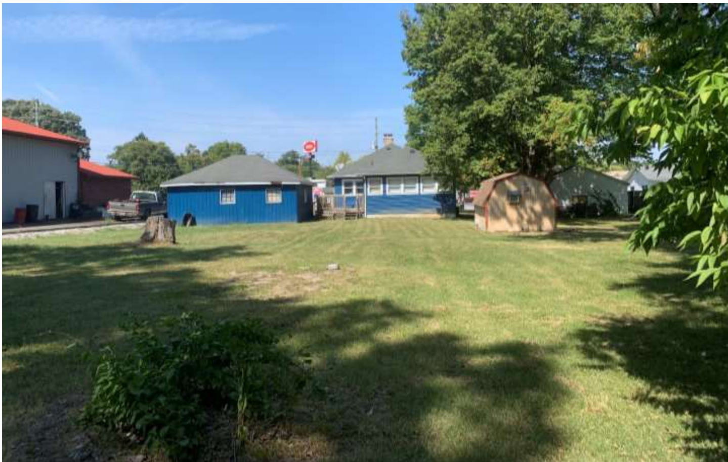
Photo of the property at 6345 West Thompson Road looking north.