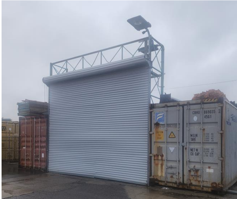
Photo 5: Overhead Garage Door along Southern Elevation (submitted by applicant)