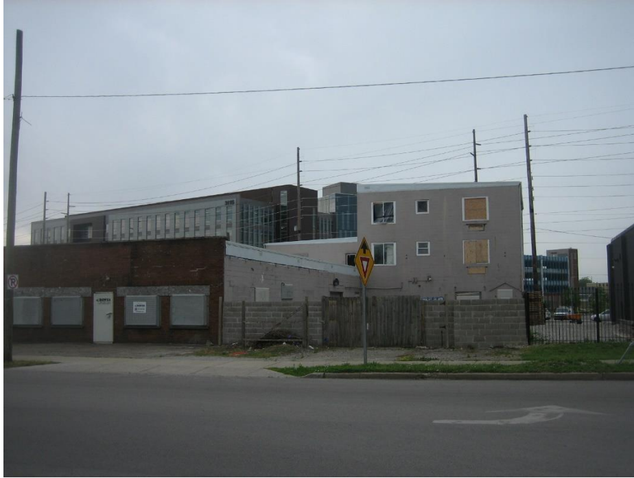
Subject site, looking South from English Avenue.