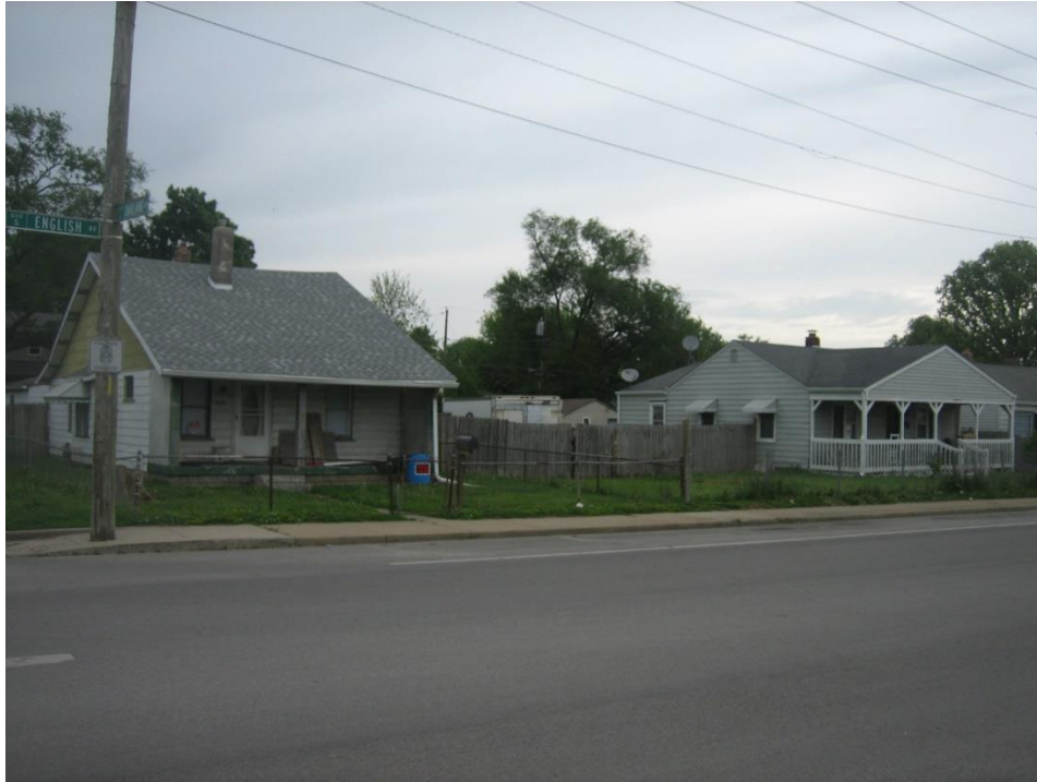
Adjacent residential property on English to the north.