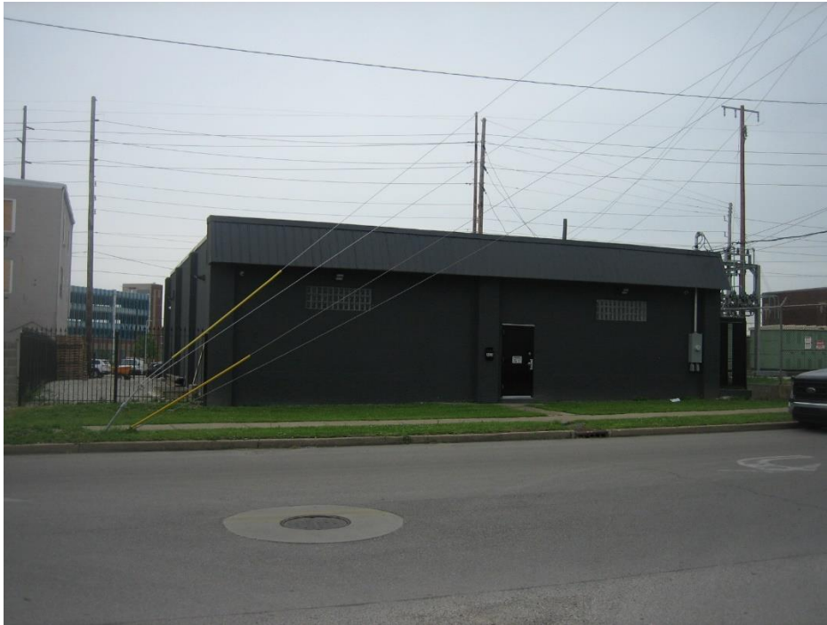
Adjacent commercial use to the west of subject site, zoned D-5, looking south.