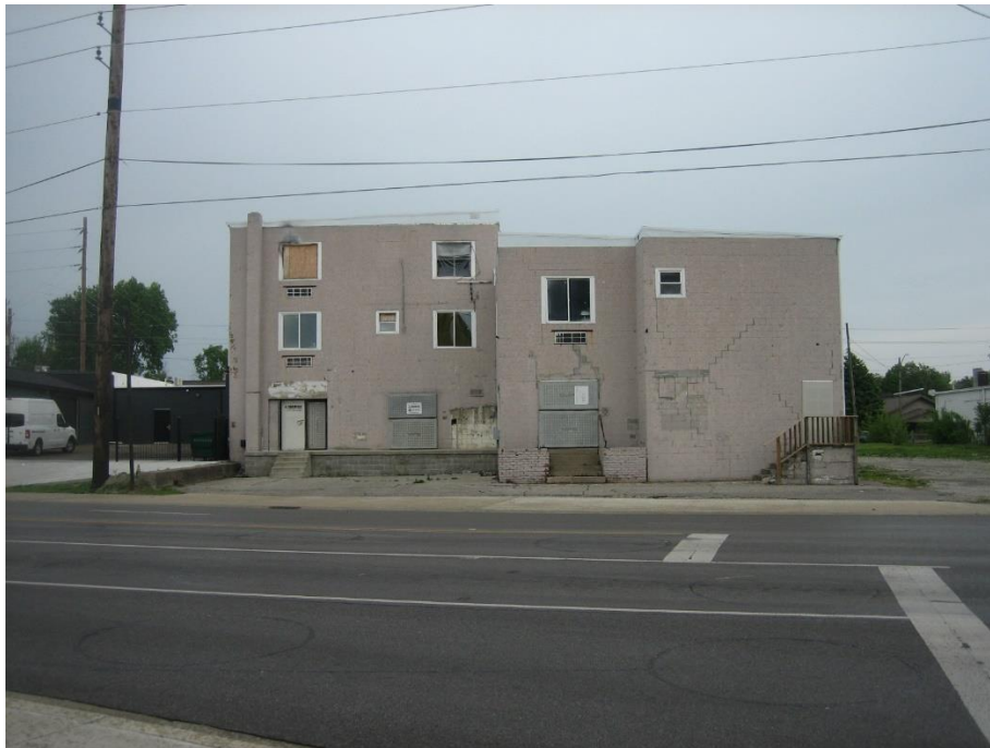
Subject site looking north from Southeastern Avenue.