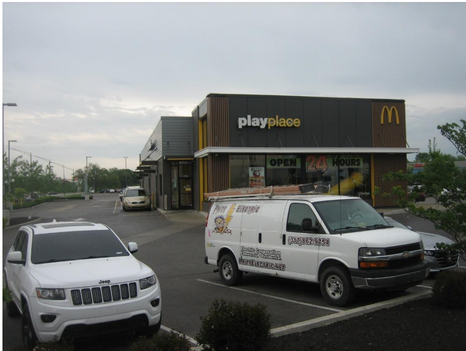
Adjacent commercial use to the south.