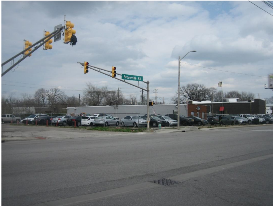
Automobile sales use to the east of site, looking northeast.