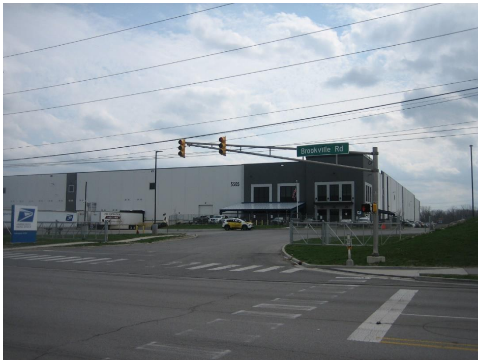
Light industrial warehouse distribution center to the south.