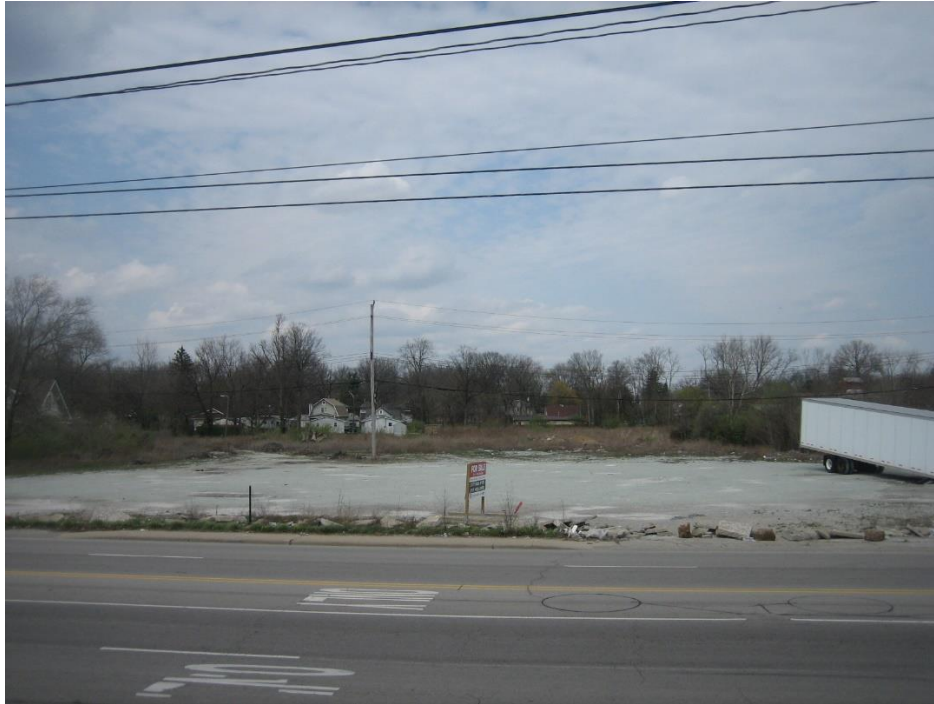
Subject site, looking north