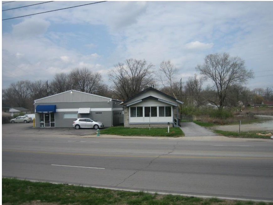
Single family dwelling and neighborhood commercial to the west of subject site, looking north.