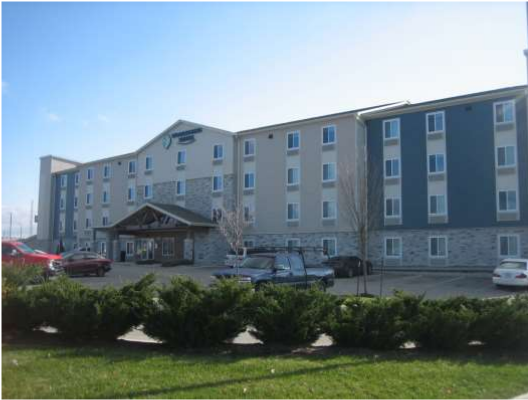
Adjacent community commercial hotel use to the south of site, looking southeast.