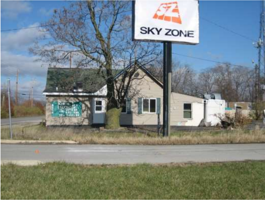
Adjacent community commercial restaurant use to the north of site.