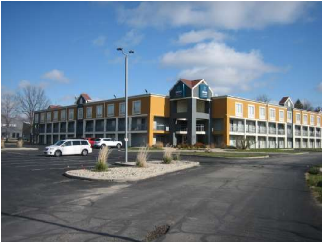
Adjacent community commercial hotel use to the east of site.