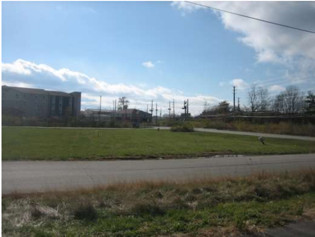
subject site looking east