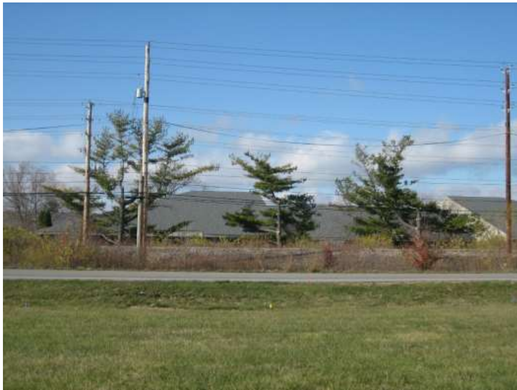
Adjacent office commercial use to the west of site