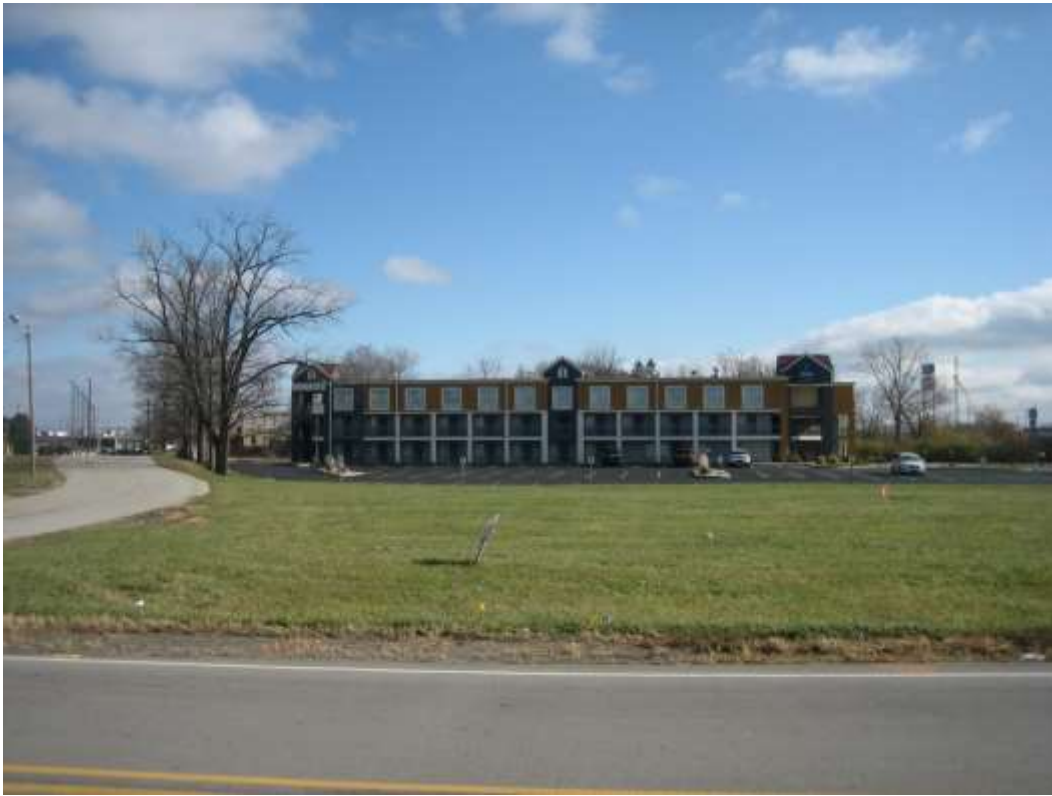
subject site looking east