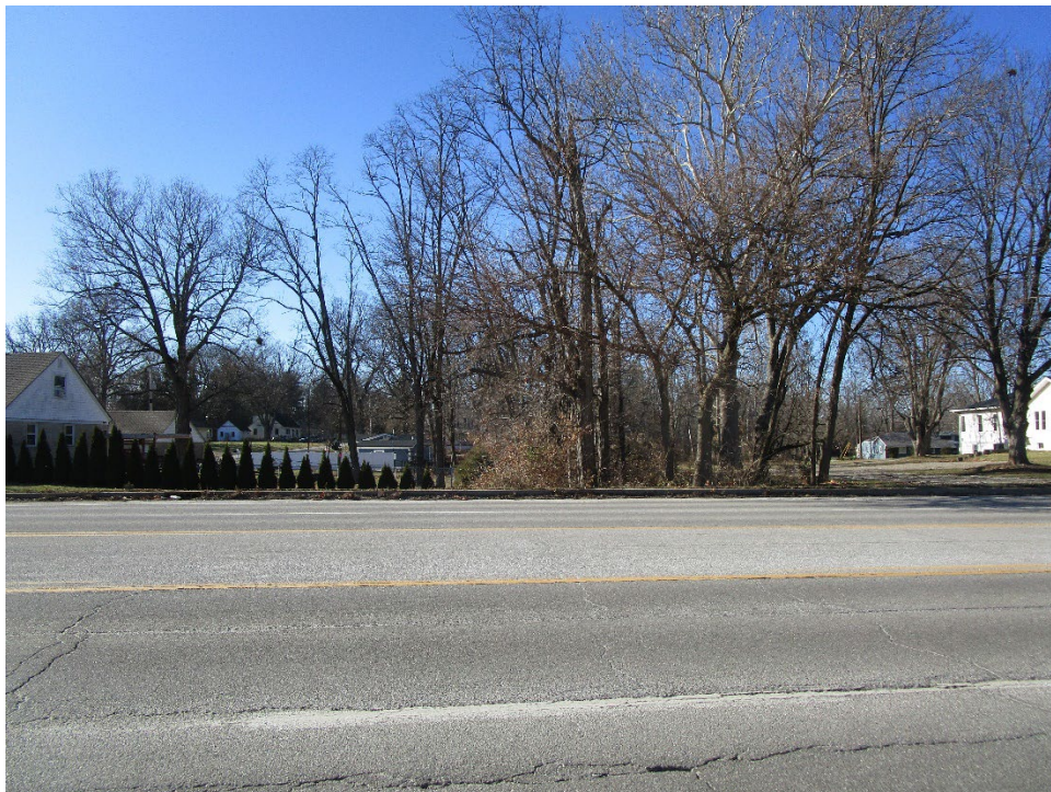
View of site looking west across Madison Avenue