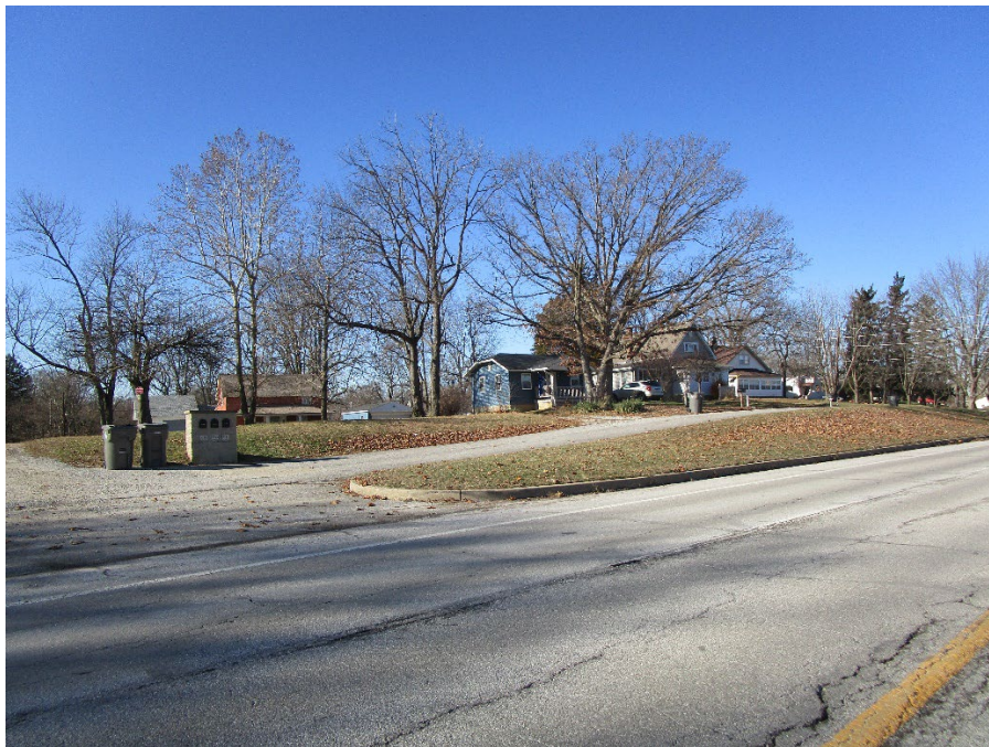
View looking northwest across Madison Avenue