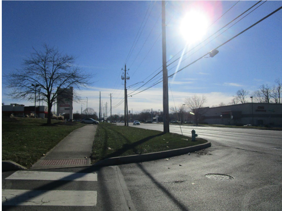
View looking south along Madison Avenue