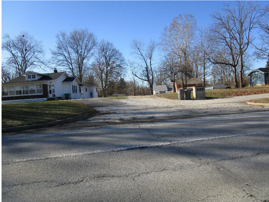
View of site looking west across Madison Avenue