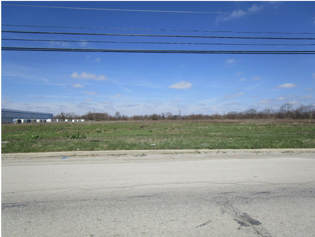
View of site looking north across West Hanna Avenue