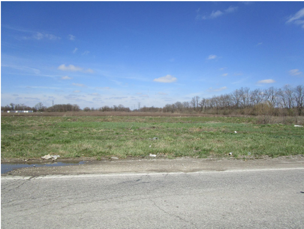
View of site looking north across West Hanna Avenue