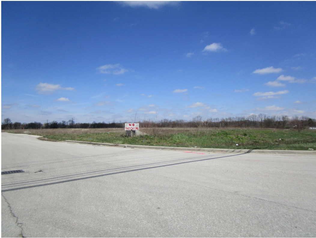
View of site looking northwest across West Hanna Avenue