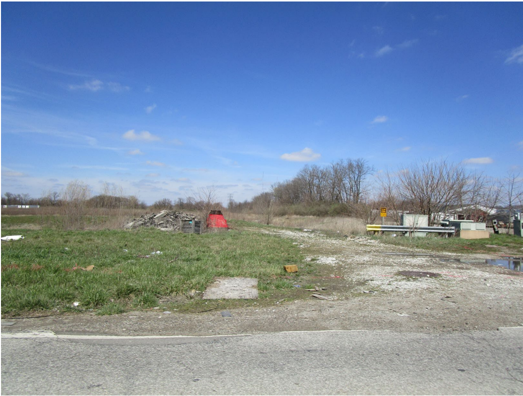
View looking east along East 19 th Street