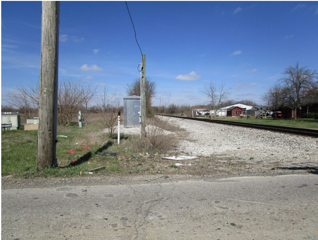
View of site and adjacent property looking north across West Hanna Avenue