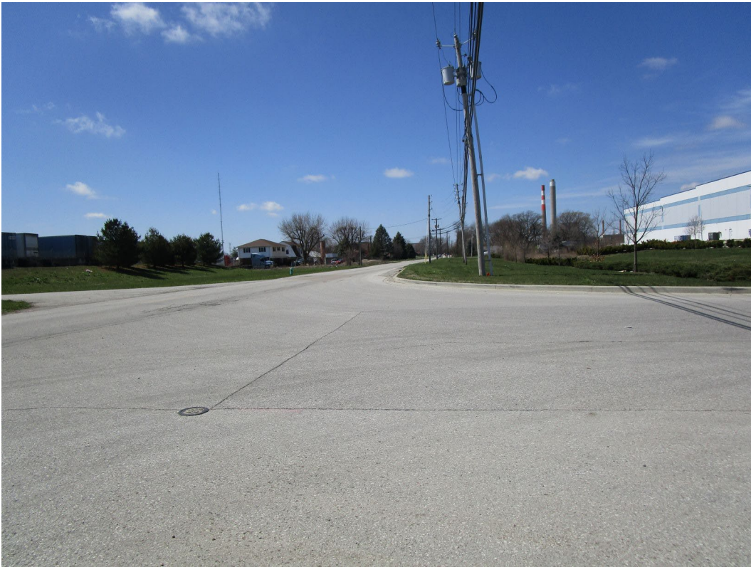
View looking west along West Hanna Avenue