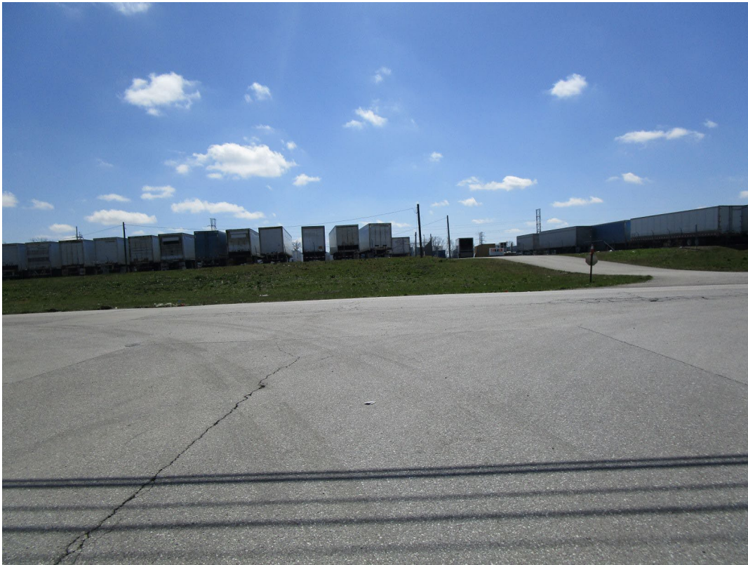
View of site looking south across Wets Hanna Avenue