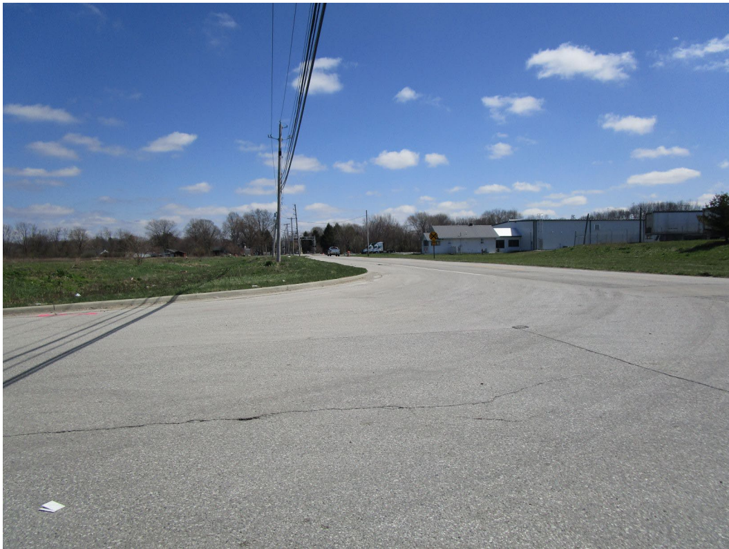
View looking east along West Hanna Avenue