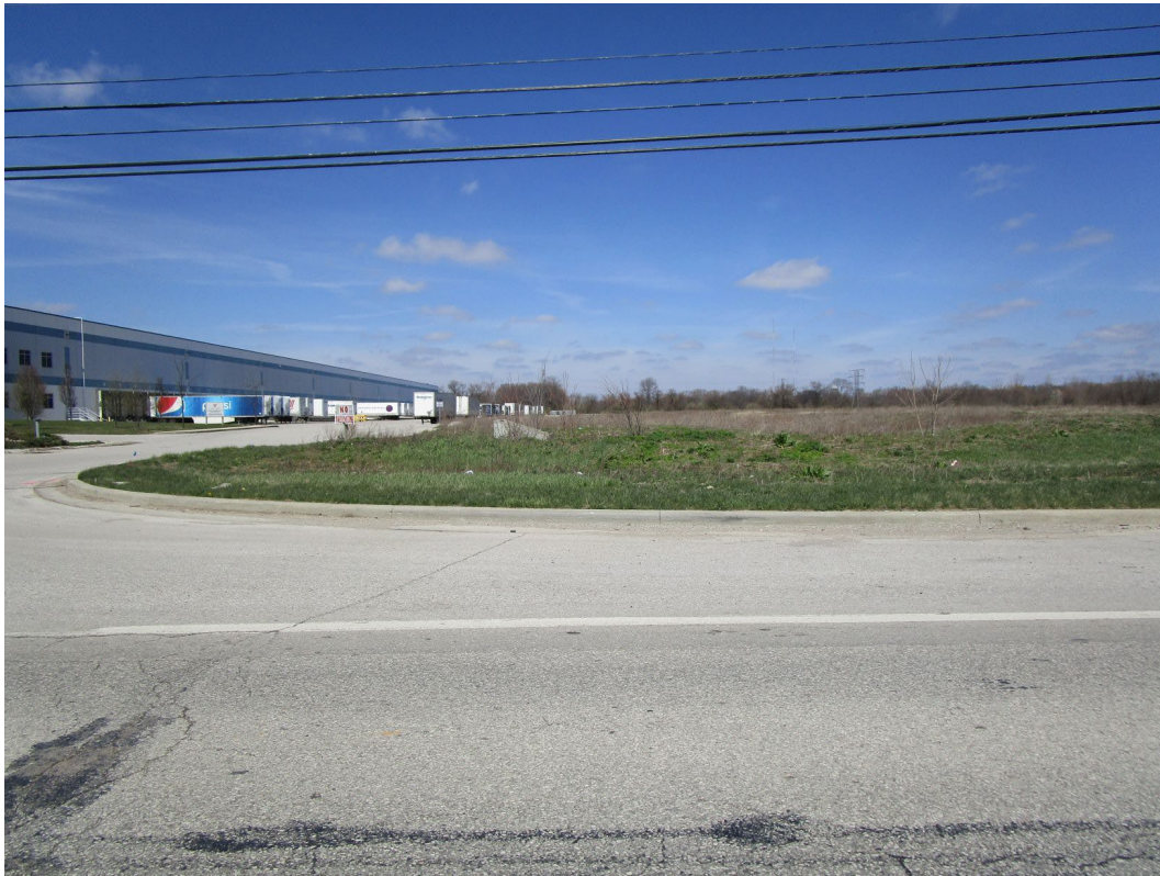
View of site looking north across West Hanna Avenue