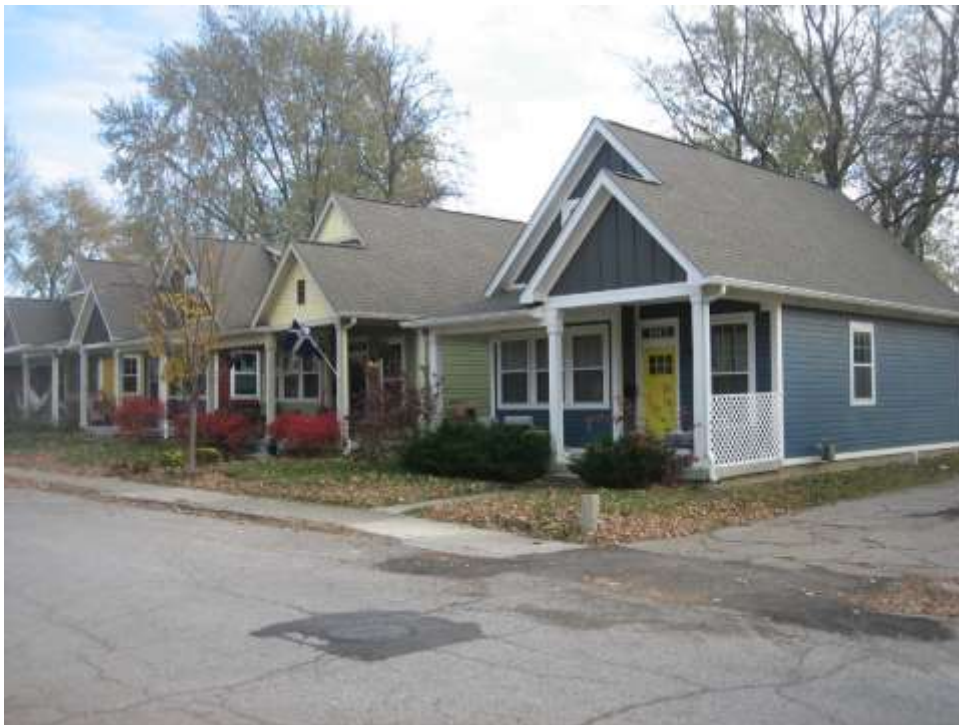
Photo 6- Adjacent multiple single-family properties to the east, looking southeast.