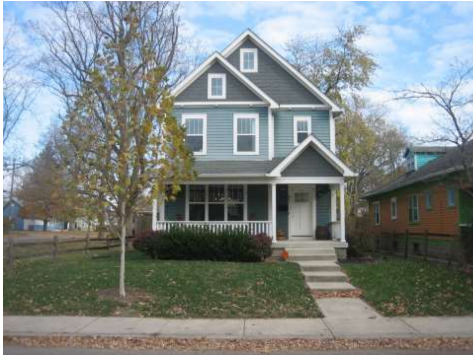
Photo 3 – Adjacent single-family property to the south, looking east.