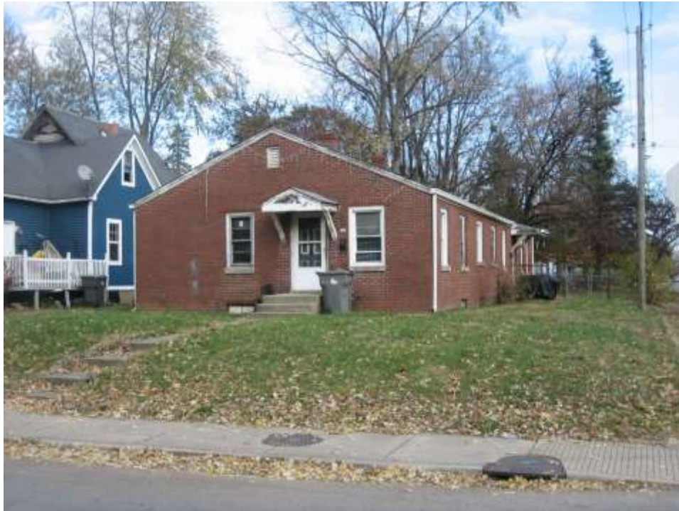
Photo 5 – Adjacent two-family property to the north, looking east.