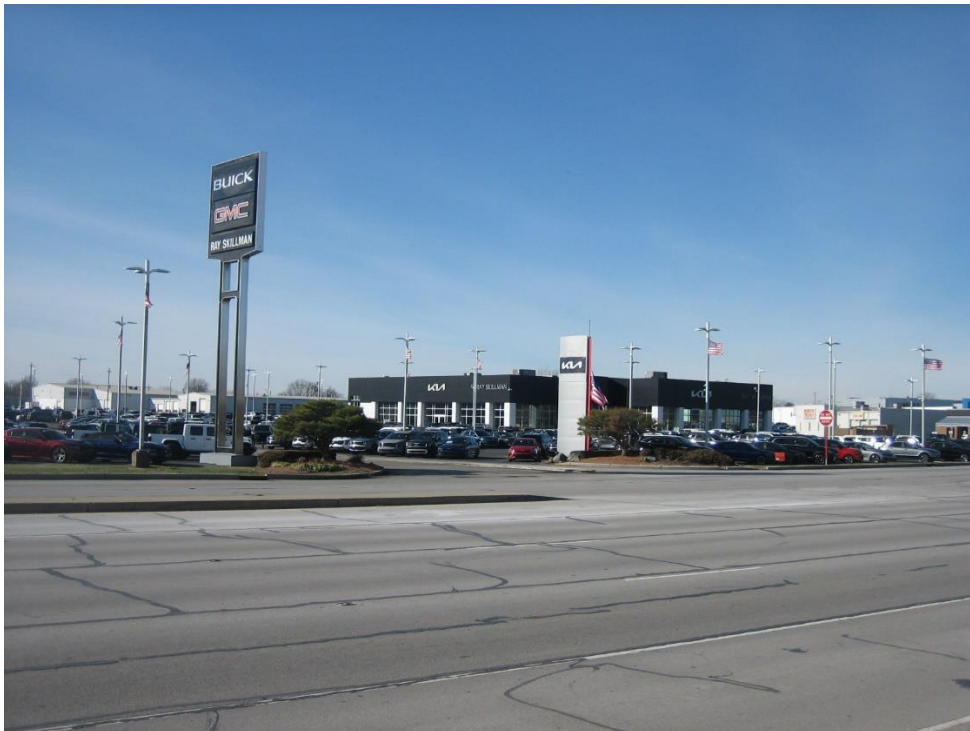
Subject site frontage showing the KIA sign to be relocated further north, looking west.