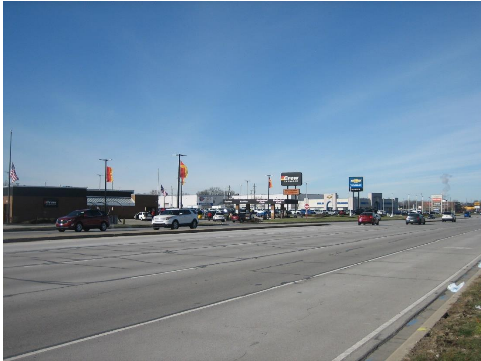
Adjacent commercial use signage to the north.