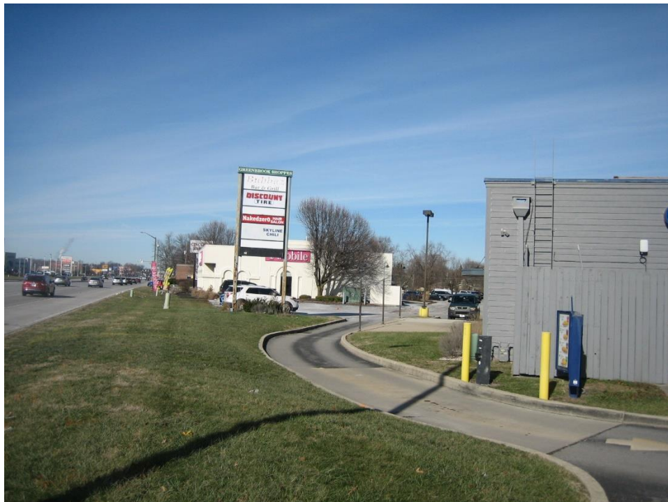
Adjacent commercial use signage to the east, looking north.