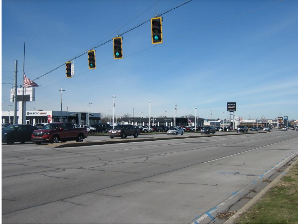
Subject site frontage showing all three existing signs, looking northwest.