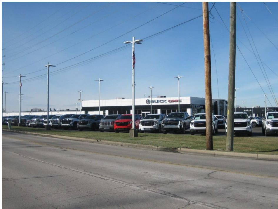
Subject site integrated center frontage on Stop 12 Road without any signage.