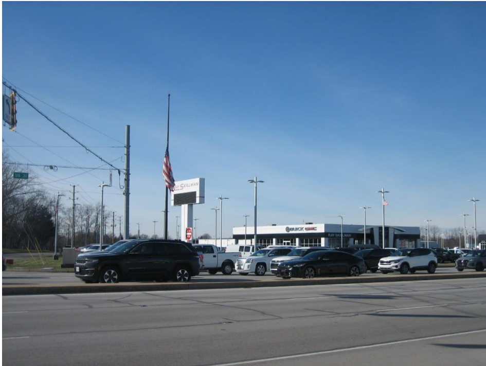
Subject site frontage showing existing pole sign with EVMS component, not specific to any franchise brand.