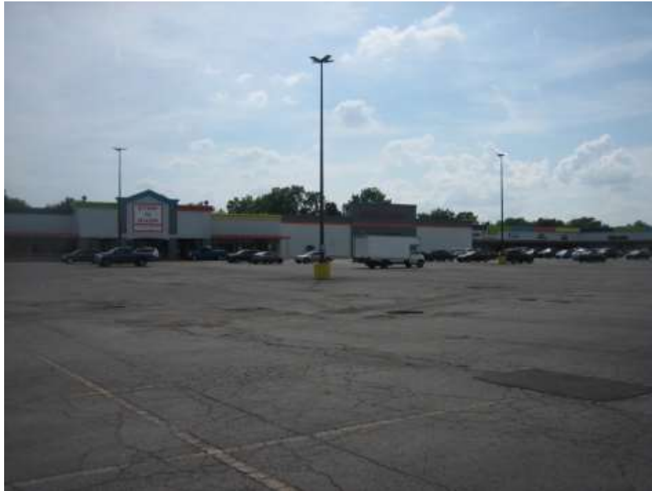
Adjacent integrated commercial development, looking west.