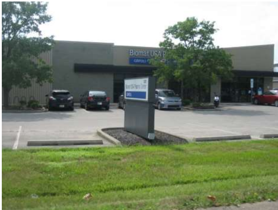
Existing outlot development to the south with one freestanding sign, looking west.