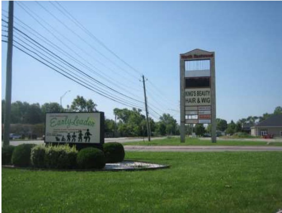
Existing frontage signs, with 100 feet and ten feet of separation from proposed sign, looking south