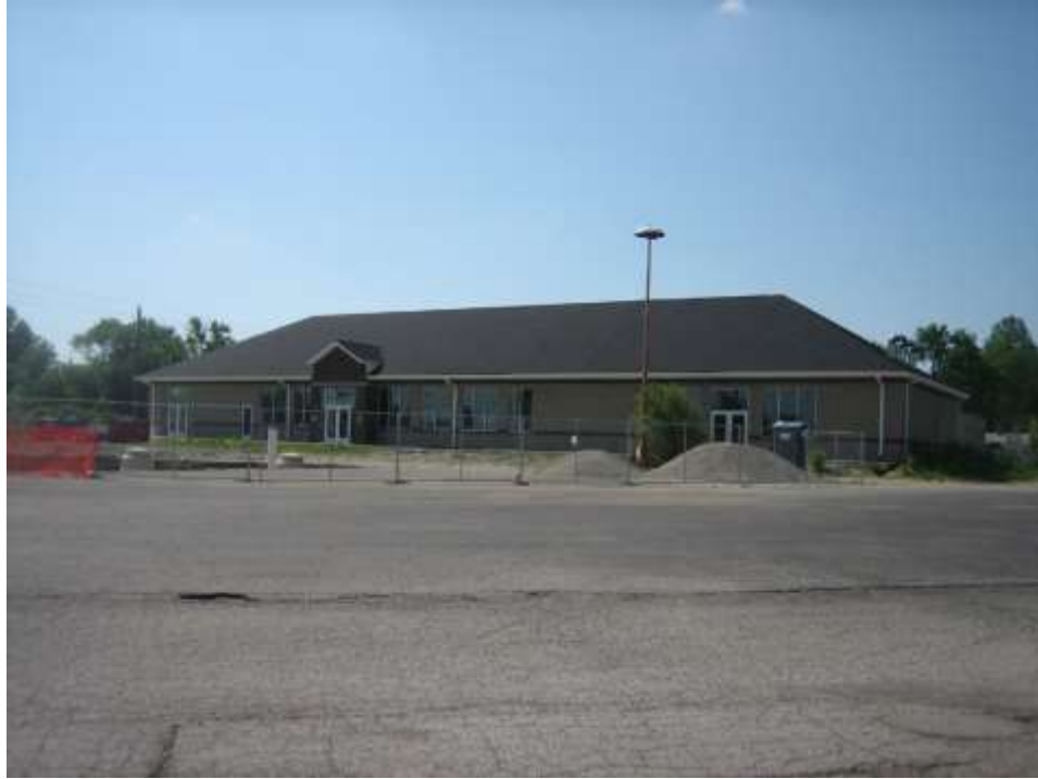
Subject site commercial gas station under construction, looking south.