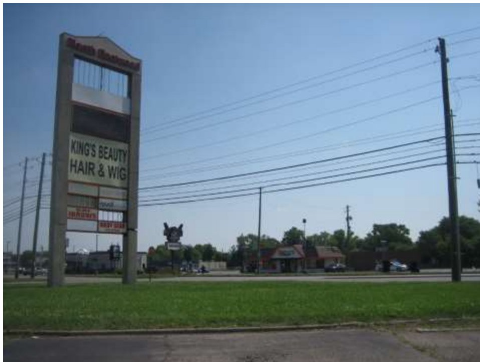
Approximate proposed sign location, five feet in front of existing center sign, looking northeast.