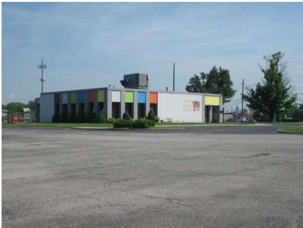
Existing outlot development to the north with one freestanding sign