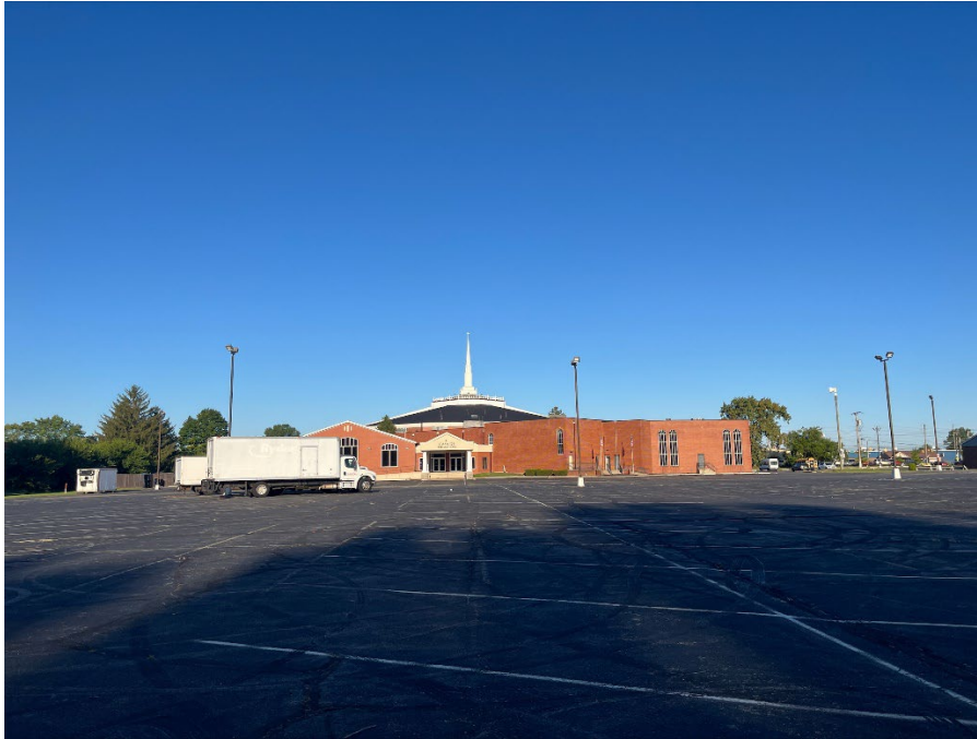
Looking west at the parking lot and Church in background