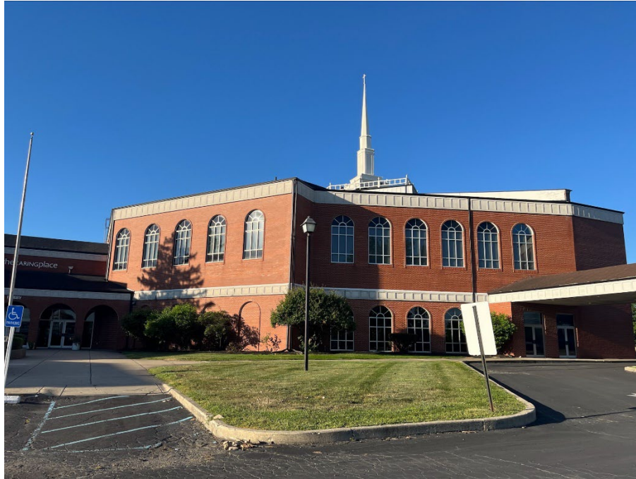
Looking southwest at Church