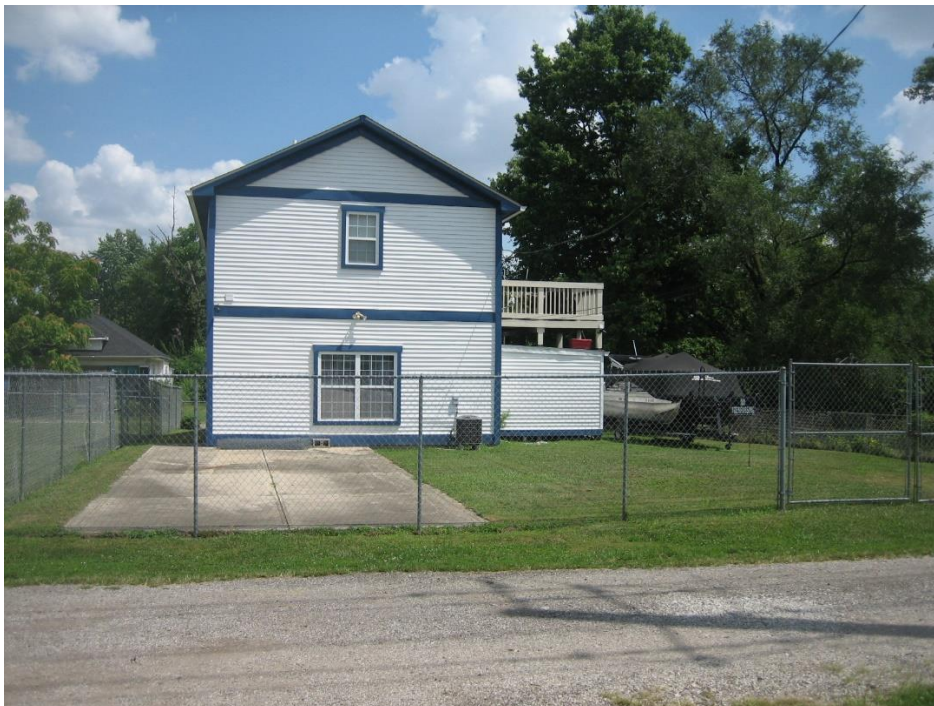
Subject site rear of dwelling, proposed garage location, looking east