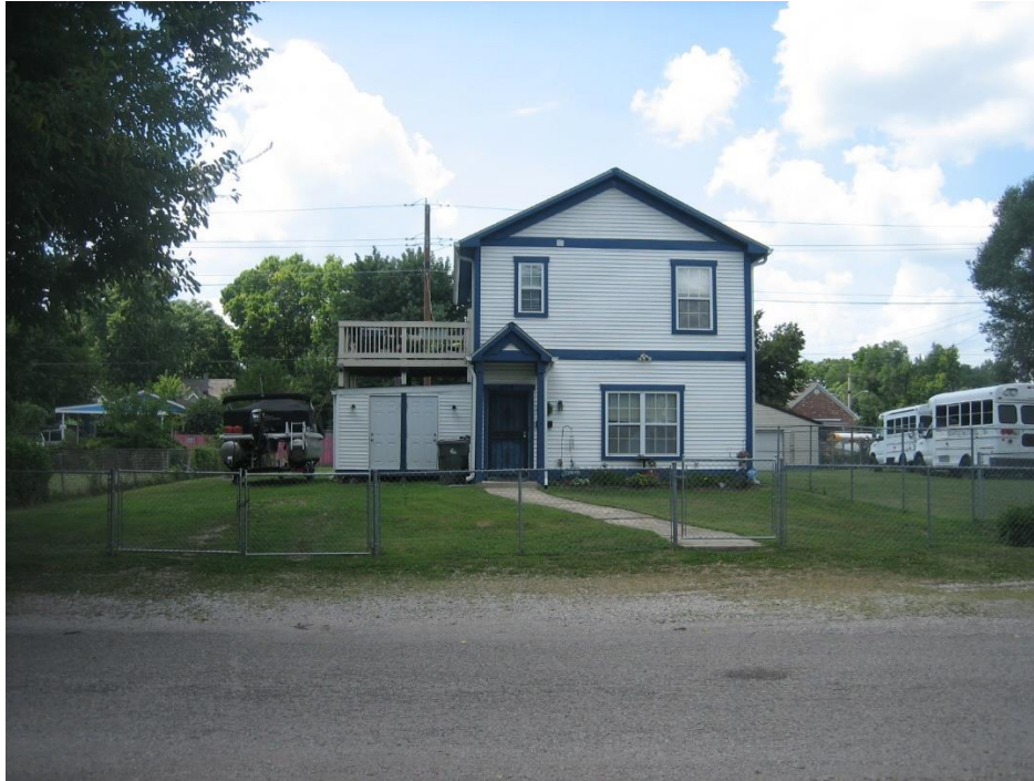
Subject site single family dwelling, looking west