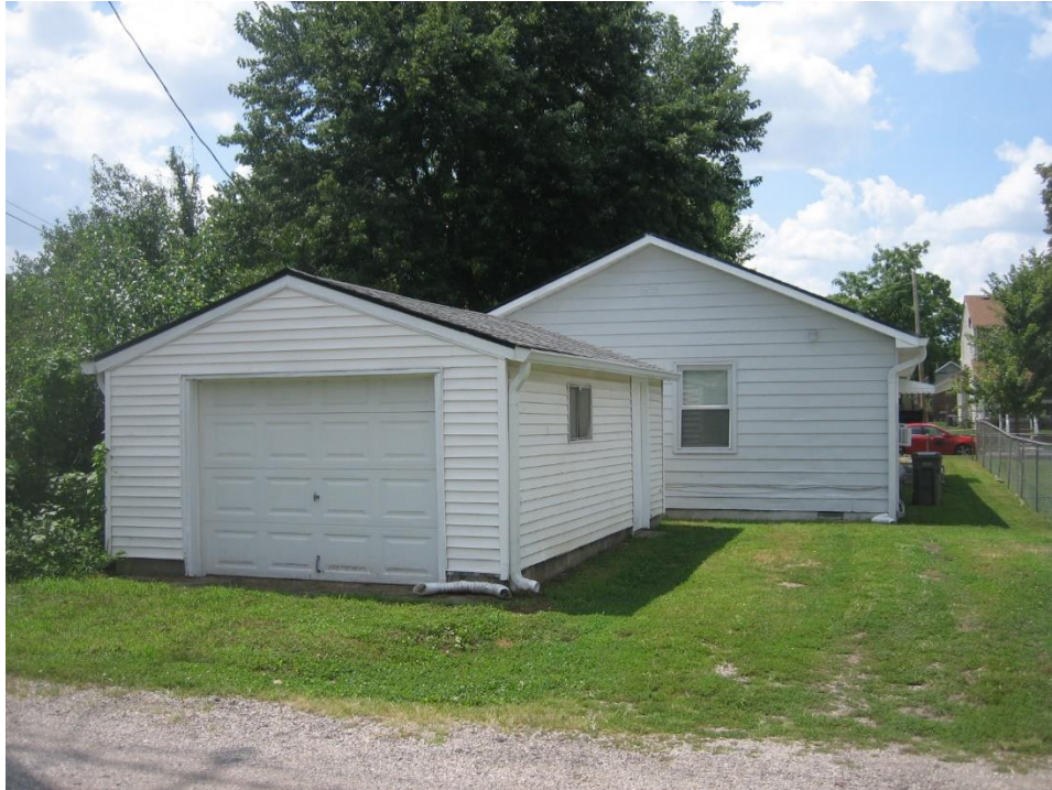
Adjacent single family dwelling with complaint garge, looking west.