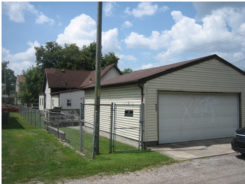
Adjacent single family dwelling with complaint garge, looking northwest.