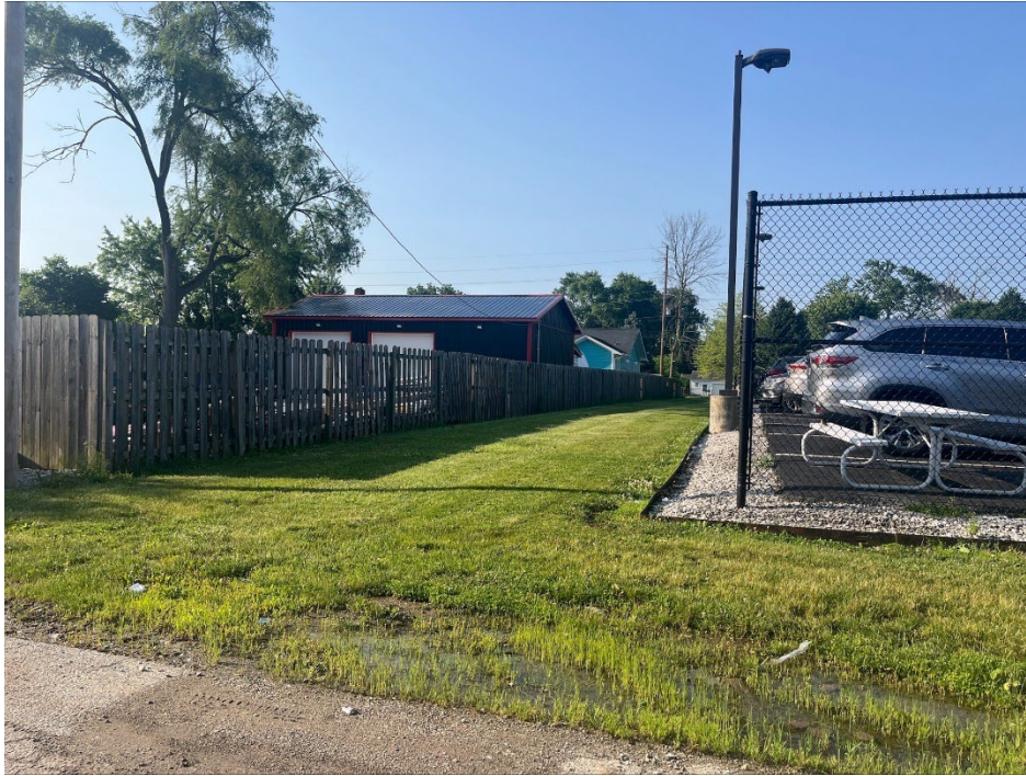
Looking south with the garage structure in the background