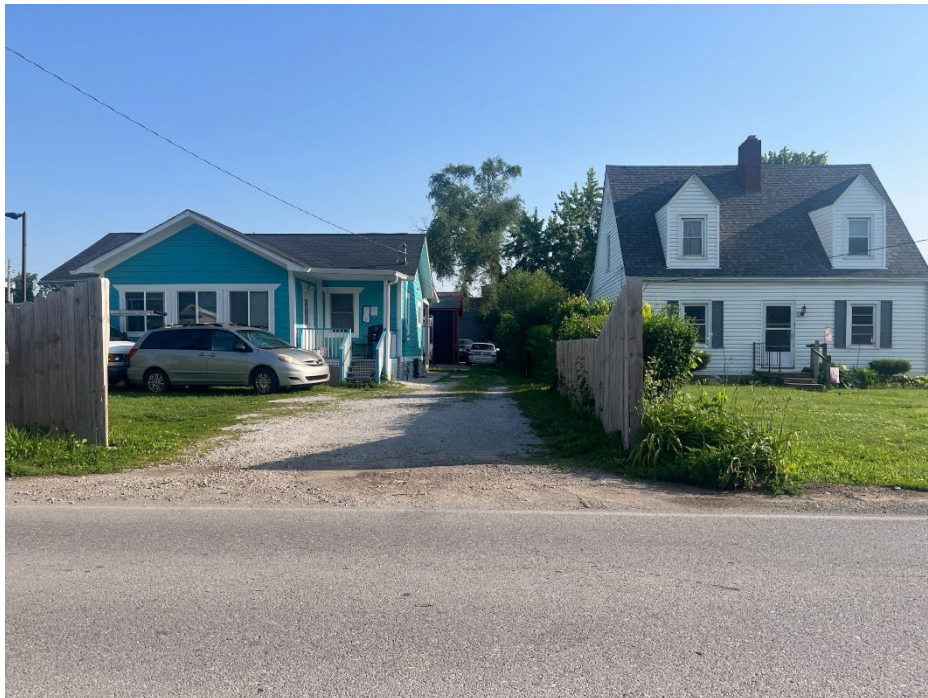
Looking north with the adjacent residence to the east