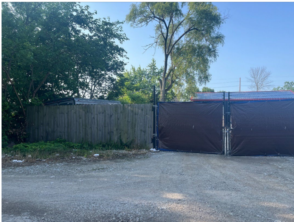
Rear gate from the alley