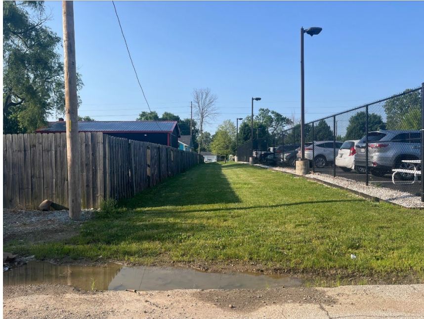
Looking south with the adjacent parking lot to the west