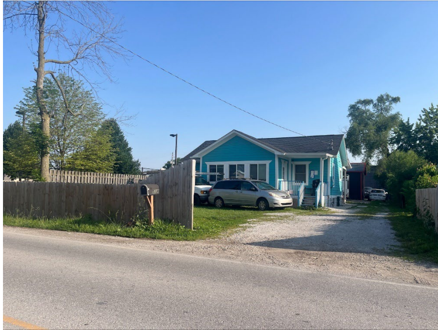
Subject site looking north from West Morris Street