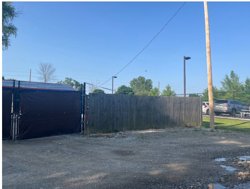
Looking south from the alley