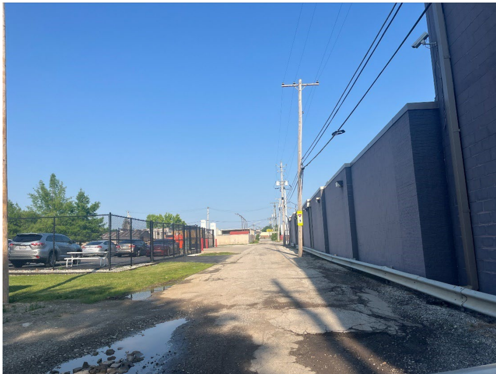
Looking west down the alley