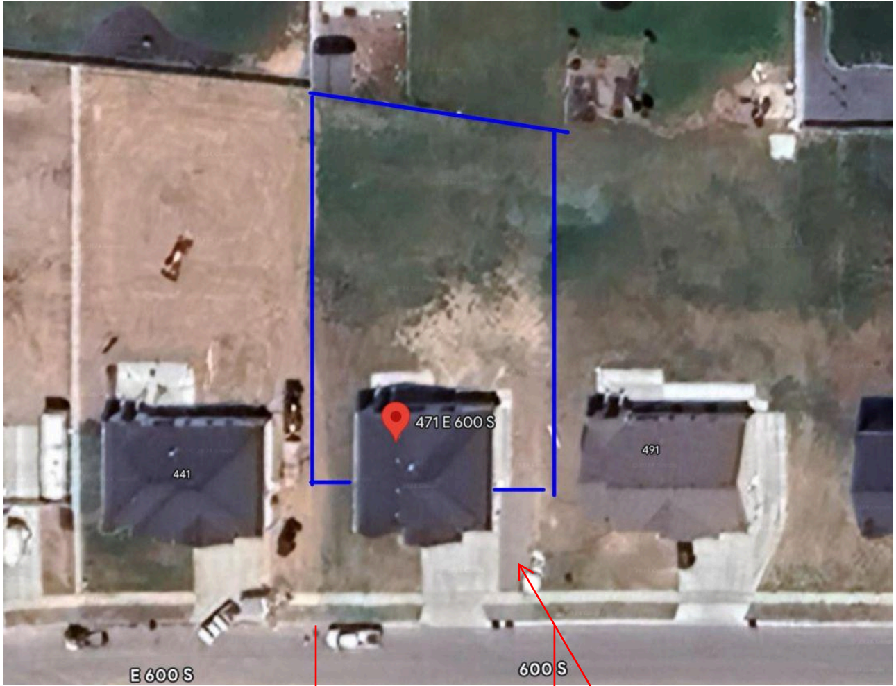
Image B: Satellite image overview of the lot. Front yard is fully landscaped already with a gravel pad next to the driveway for additional parking.

→ NO PARKING DURING DROP-OFF PICK-UP TIMES (8AM-4PM?) ←