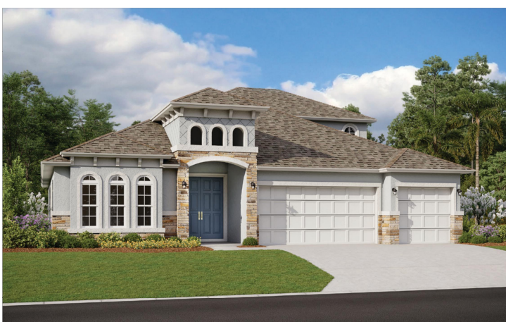
ELEVATION C WITH OPTIONAL STONE