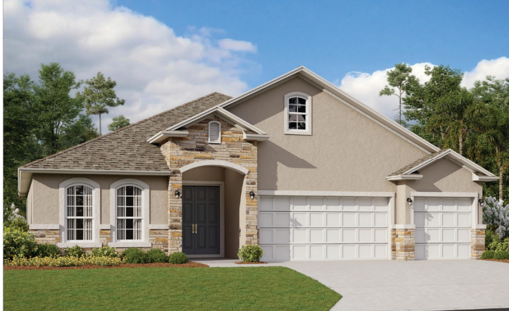
ELEVATION B WITH OPTIONAL STONE