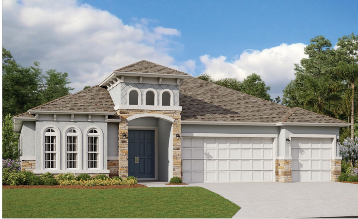
ELEVATION C WITH OPTIONAL STONE