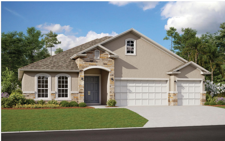
ELEVATION B WITH OPTIONAL STONE