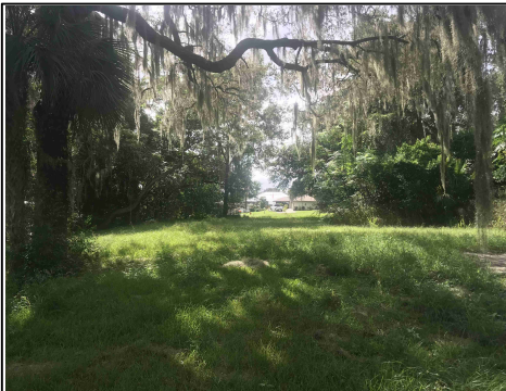
211 EAST LAUREL AVE , HOWEY IN THE HILLS , FLORIDA 34737

FIDELITY NATIONAL TITLE OF FLORIDA, INC.