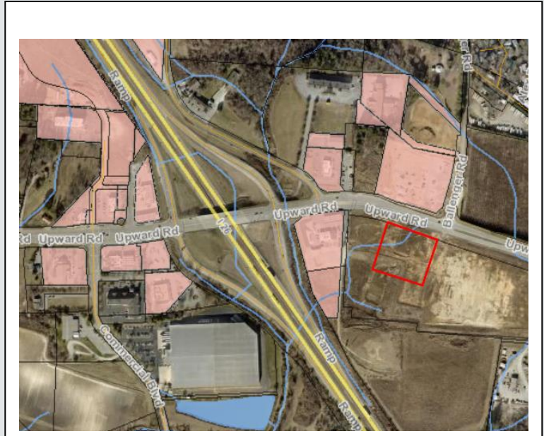
SITE VICINITY MAP

The City of Hendersonville has initiated a standard rezoning for a property located along Upward Road. The property owner has submitted a petition to annex the parcel, identified as PIN 9588-40-7325. If annexed into the City, the property must be assigned a zoning designation. Because the applicant did not request a specific zoning district in the annexation petition, the City has proposed CHMU (Commercial Highway Mixed Use) zoning.