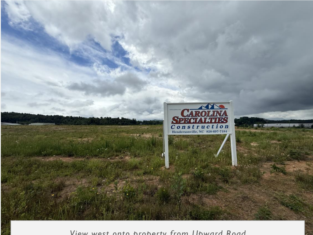
View west onto property from Upward Road.