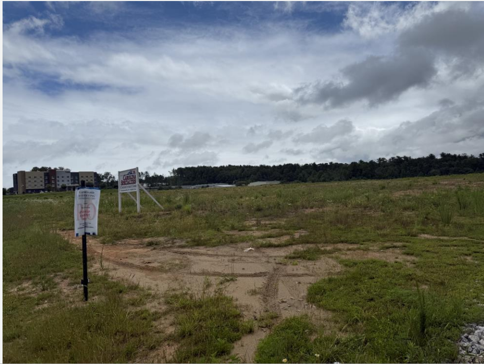
View of property looking east from Upward Road.