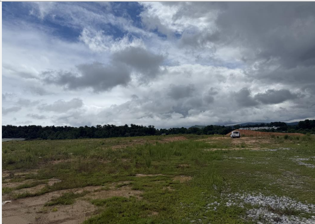
View south onto property from Upward Road.