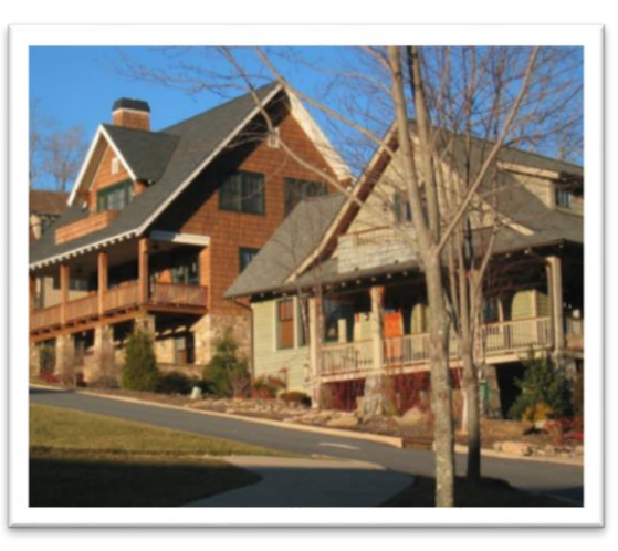
Example of "Infill Area" development presented in the Henderson County 2045 Comprehensive Plan

Henderson County 2045 Comprehensive Plan Future Land Use Designation: Infill Area.