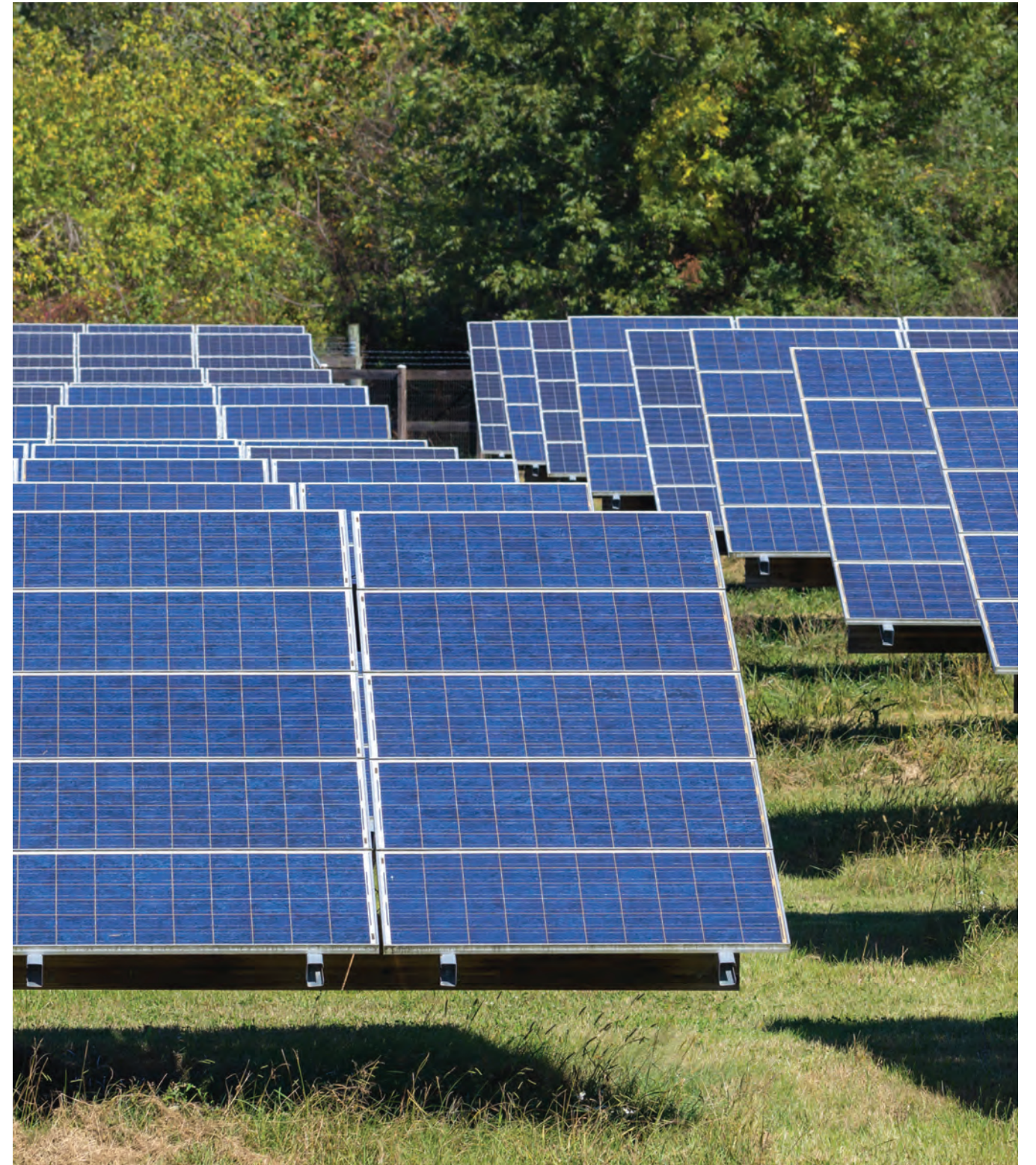
Solar panels