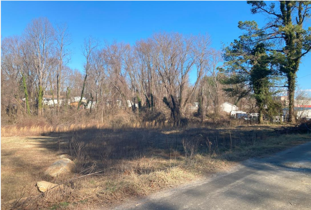
View of portion of subject property across Brevard Knoll Dr. Brevard Knoll Dr in foreground / right.