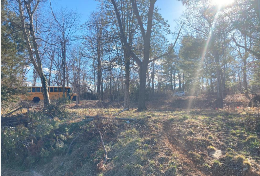
View of center of site from Brevard Knoll Dr.