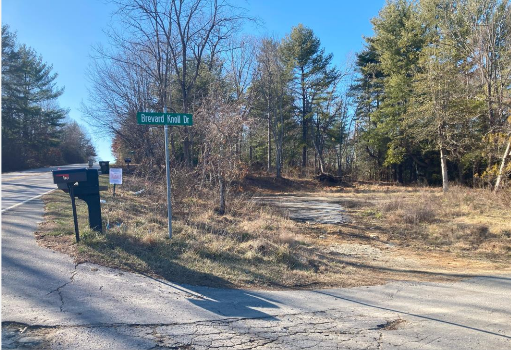
View of subject property from corner of Signal Hill Rd and Brevard Knoll Dr.