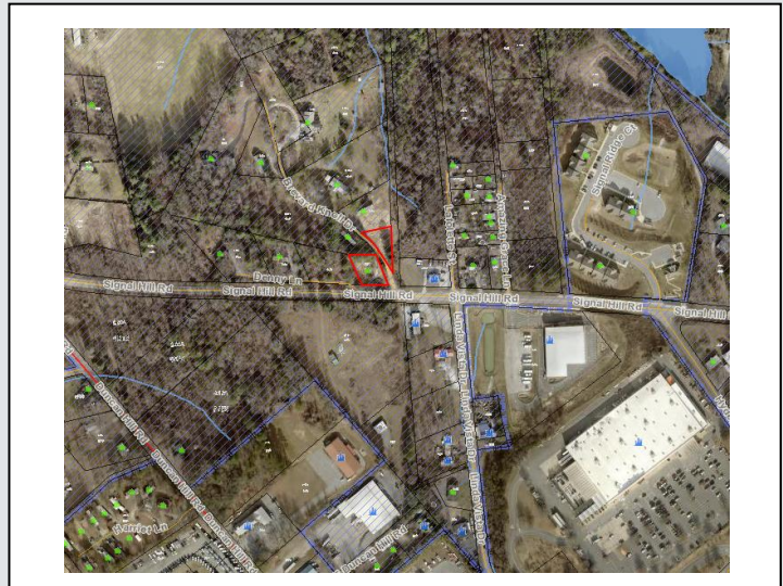
SITE VICINITY MAP