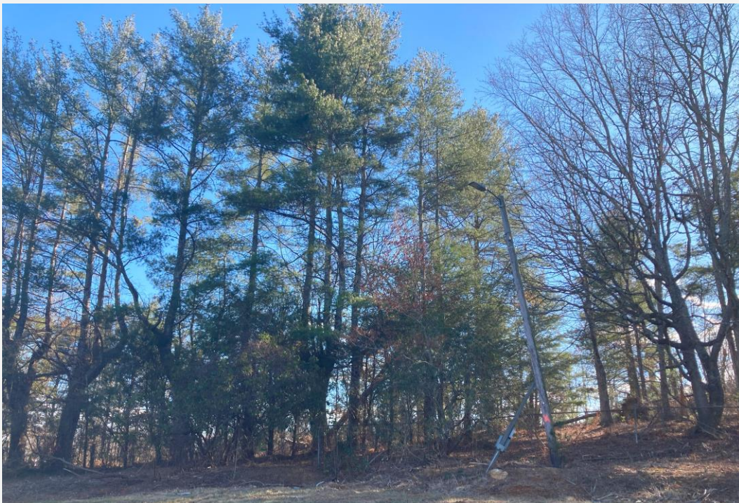
View of rear of site from Brevard Knoll Dr