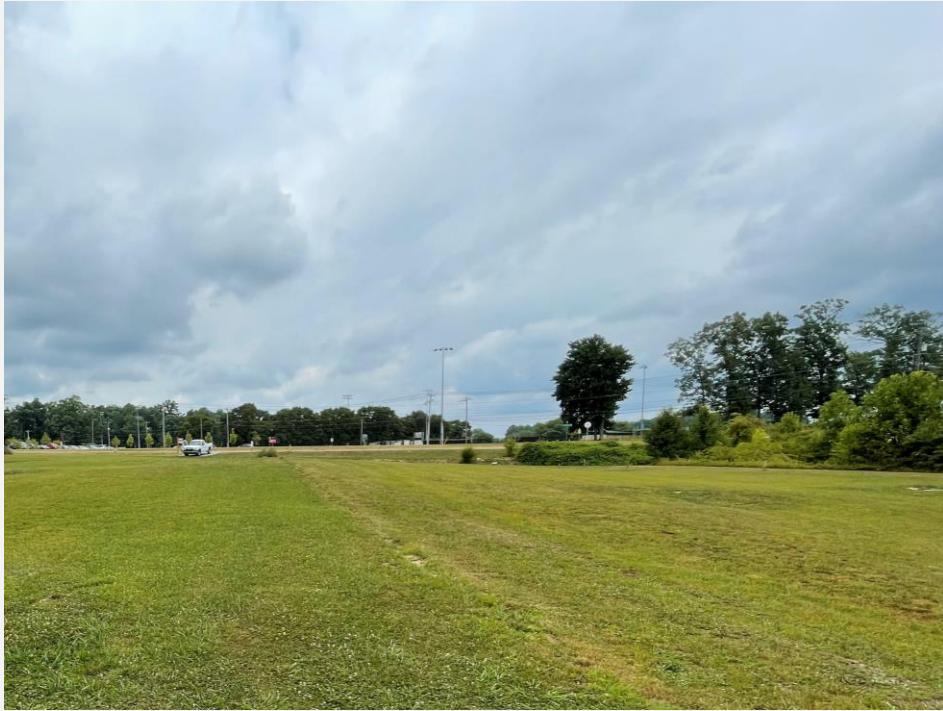
View of property looking toward Upward Road.