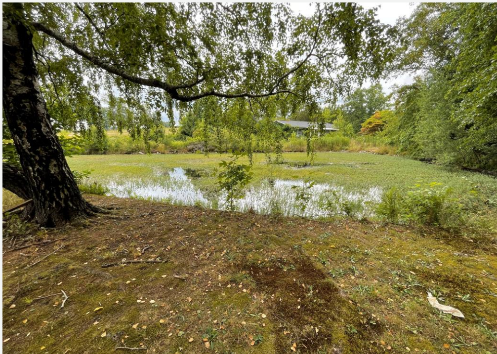
View of small pond that sits adjacent to property.