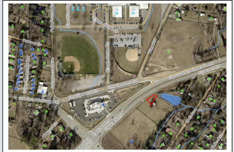
SITE VICINITY MAP

The City of Hendersonville approved an annexation petition from Lyndon Hill (property owners) for one parcel totaling .08 acres located along Upward Road. The applicant did not request zoning, therefore the City is initiating zoning. The County zoning remains in effect until municipal zoning is applied or a period of 60 days has elapsed after annexation. The City is proposing Central Highway Mixed Use as the proposed zoning district for this property. CHMU permits a range of commercial uses and residential uses (up to 12 units/acre) and includes design standards for all uses other than single-family and two-family (per State Statute). As a standard rezoning, all uses would be permitted if approved. In 2011, City planning staff brought forward a proposal for the creation of the Commercial Highway Mixed Use District. Additionally, City Council created the Upward Road Planning District in line with the City's sewer extension policy. A map of the Upward Road Planning District is attached in your packet.