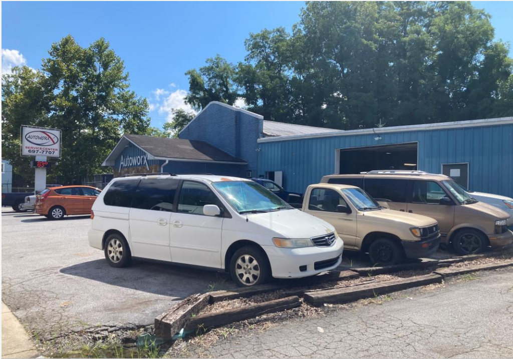
Existing Service Use in the MSD