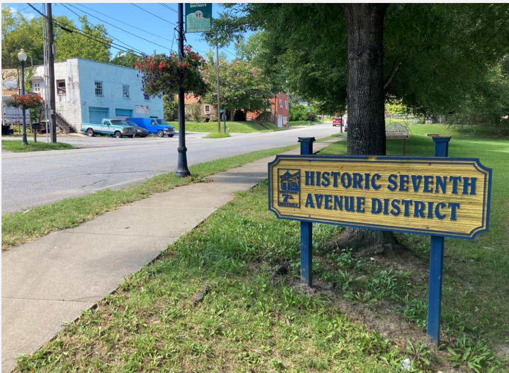
Far eastern edge of 7 th Ave MSD – two properties in background are under contract by the applicant