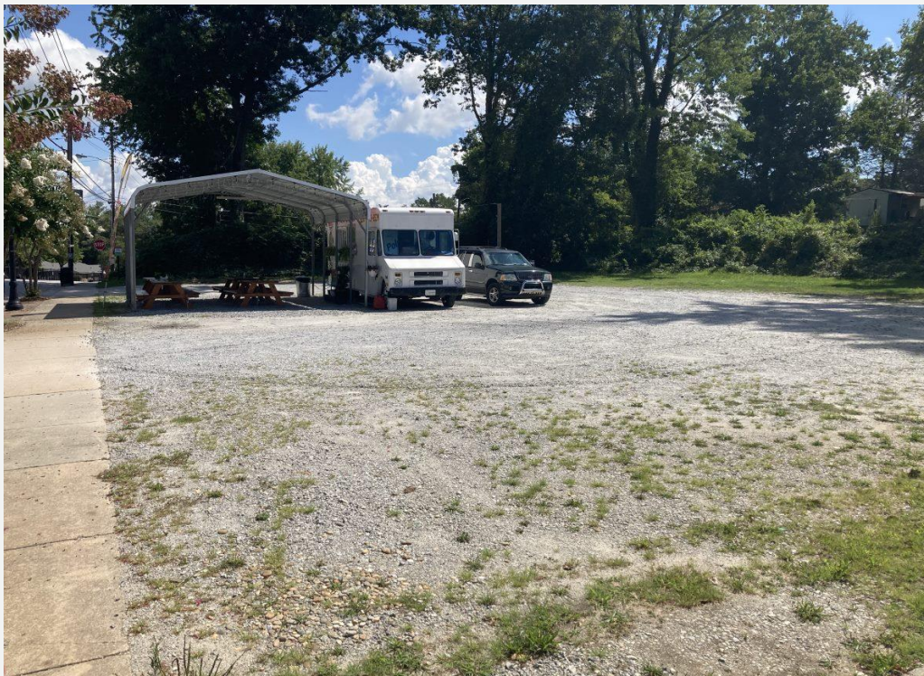
Vacant Lot in the MSD