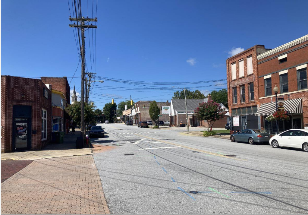
View of 7 th Ave NRHD