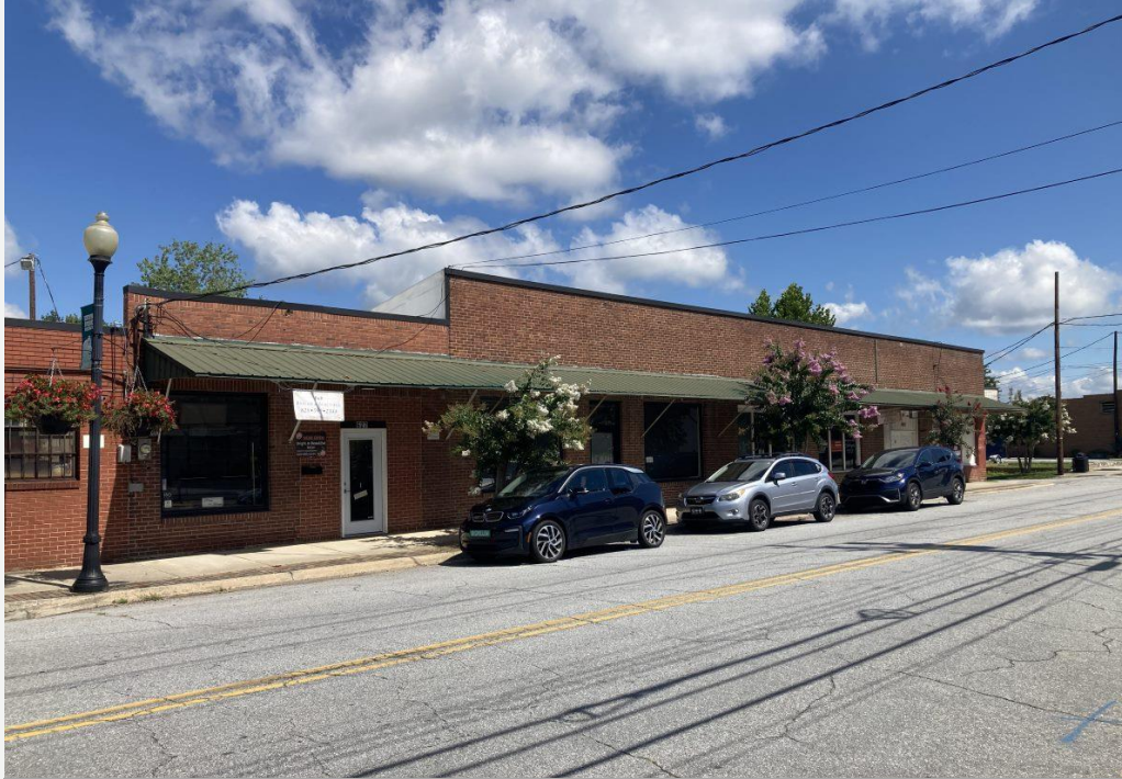
Existing Buildings in the 7 th Ave MSD