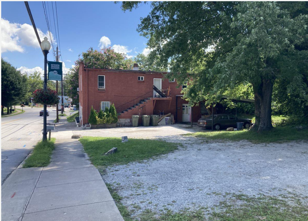
Existing “missing middle” apartment building in MSD with 0' Setback – under contract by applicant