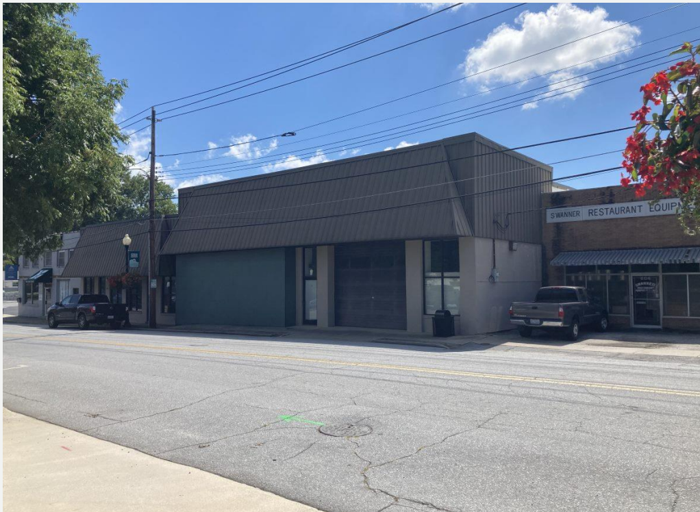
Existing Buildings in the 7 th Ave MSD