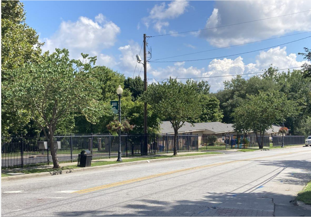
Conventional multi-family with 35'-40' setback in the MSD